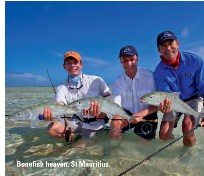
Bonefish heaven, St Mauritius.

Sportquest Holidays is the new name for Angling Direct Holidays. It continues to provide the same outstanding customer service, but now offers an even greater choice of destinations. Where do you dream of fishing?