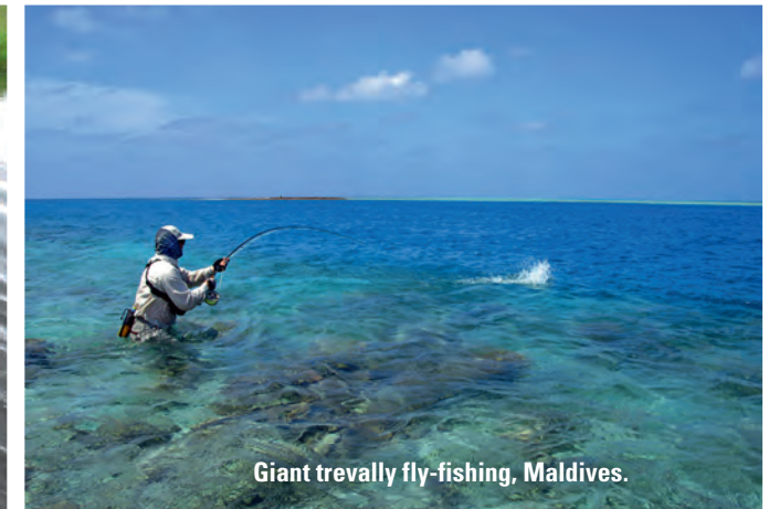
Giant trevally fly-fishing, Maldives.