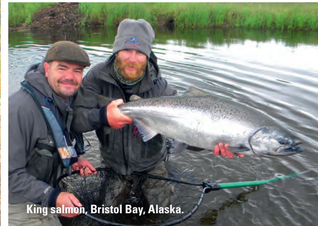
King salmon, Bristol Bay, Alaska.