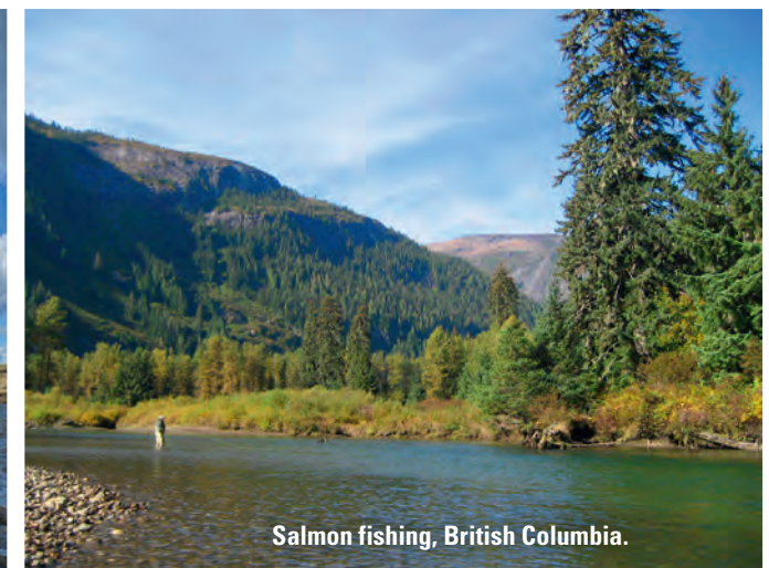
Salmon fishing, British Columbia.

S PORTQUEST IS unique in the world of fishing holidays. While some tour operators provide fishing and nothing else, the Sportquest team prides itself in providing a total package, looking after you from your front door every step of the way to the world's finest fly-fishing destinations.