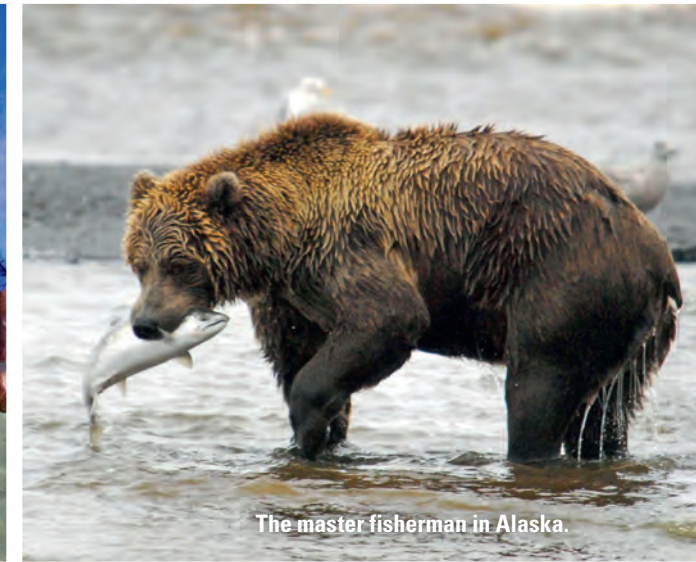
The master fisherman in Alaska.