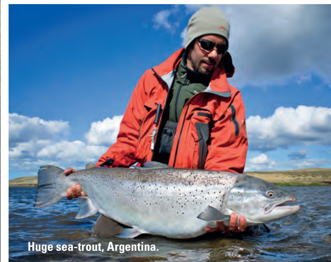
Huge sea-trout, Argentina.