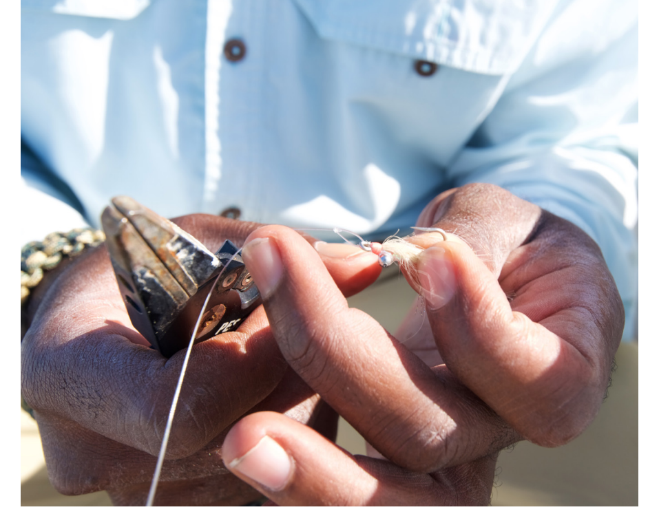
The salty ocean is hard on things. The guides periodically check the leader to ensure the Gotcha will hold under pressure.

When the fish started getting picky, a spawning mantis shrimp seemed to do the trick.