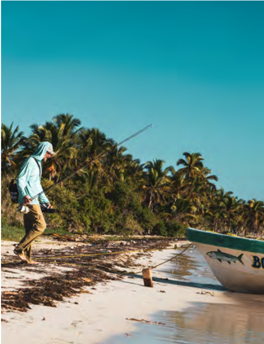
Comfortable pangas-Permit landing craft- are beached right near the lodge. No bumpy roads. No wasted time trailering.