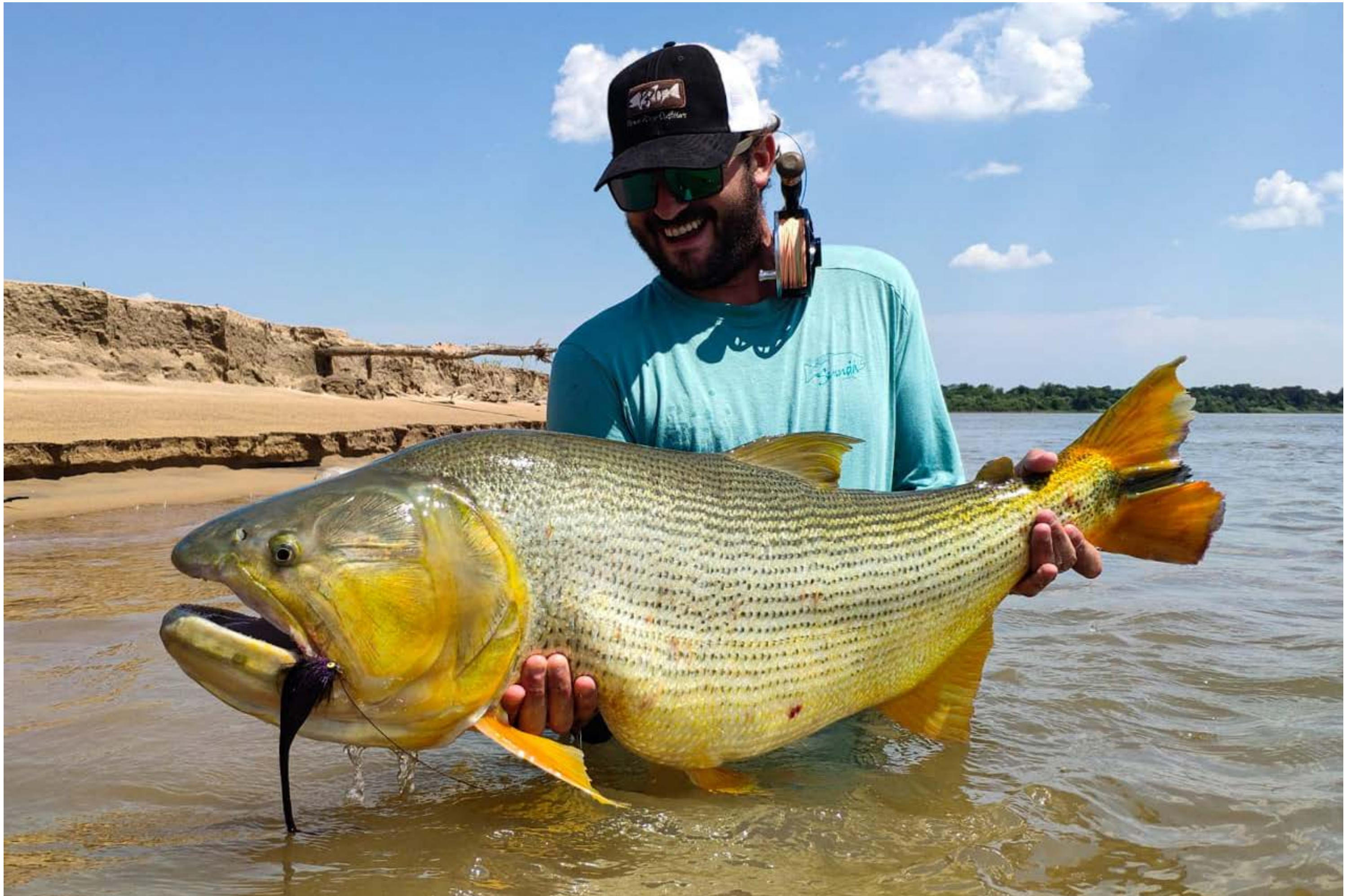
Here the odds of landing a true river monster are highest, and landing a 40-lb Golden Dorado on a 7-weight rod is a true possibility