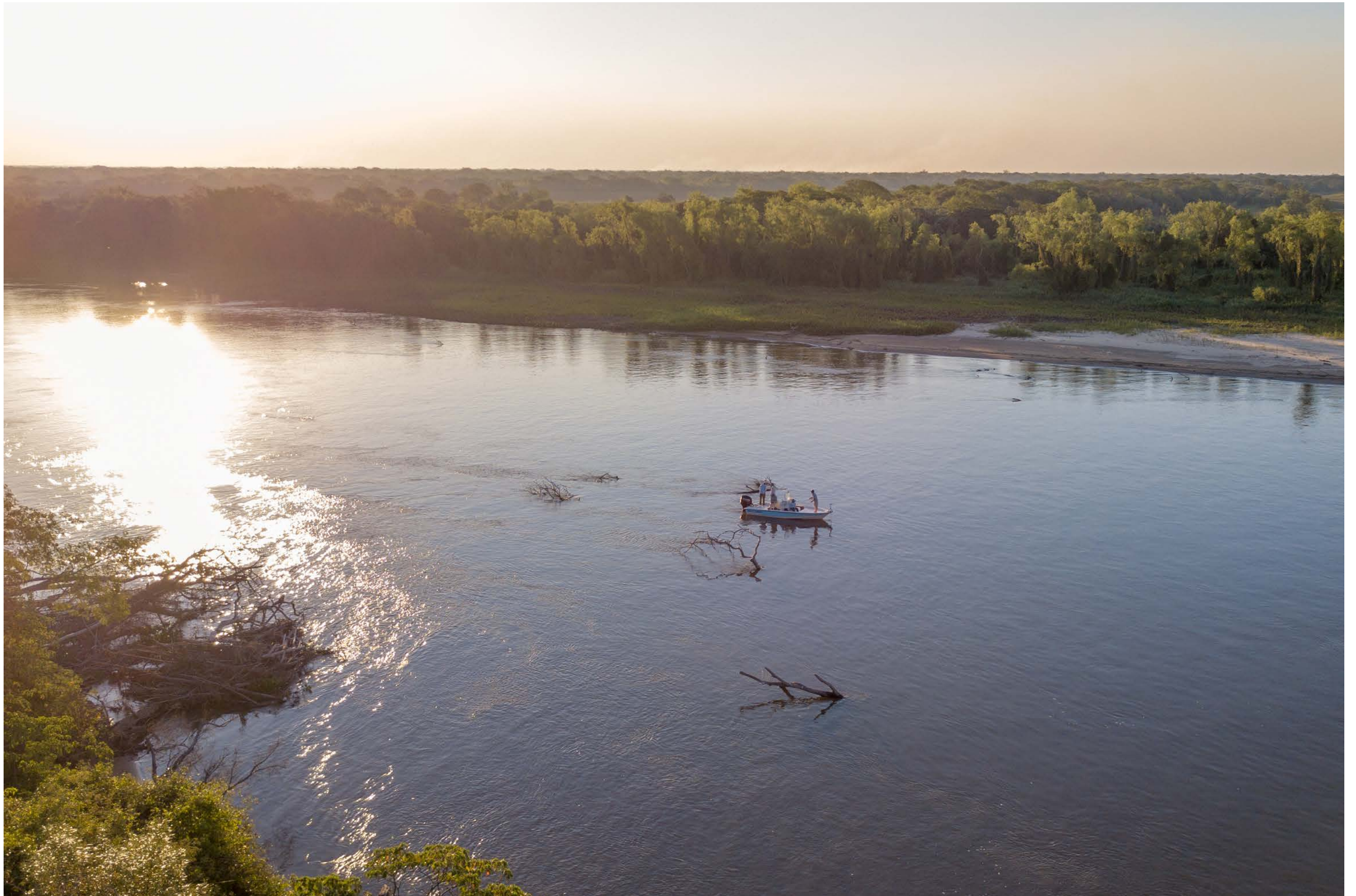
Situated in the middle section of the Río Paraná. You'll explore remote backwater creeks and fish every structure the river offers from submerged trees to cut-banks and deep channels