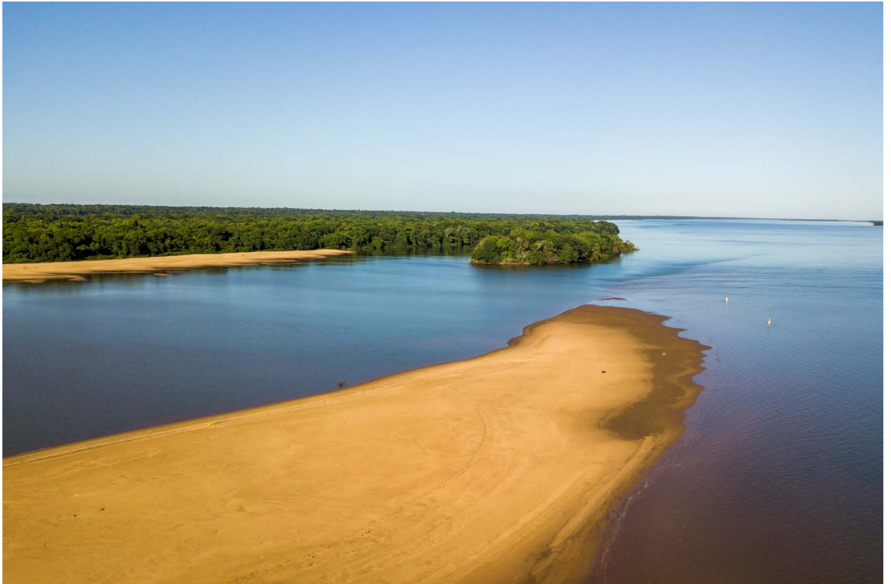
Experience sight casting nirvana on the clear sand-bar flats the Paraná is famous for