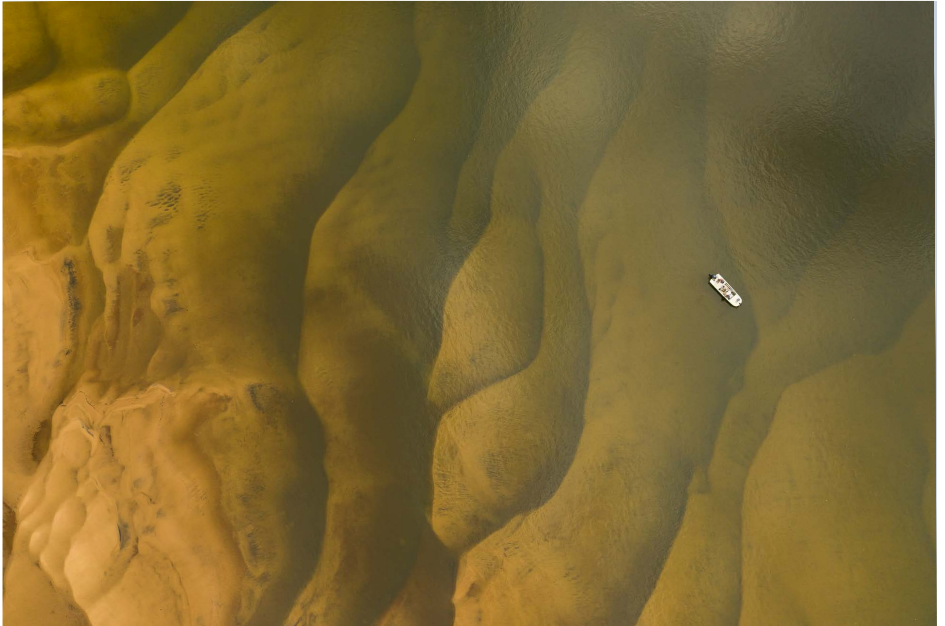
The sandbars are where the true excitement lies. When the conditions are right, colossal dorado hunt sabalo baitfish that seasonally congregate in big schools, resulting in massive boiling feeding frenzies in knee-deep water