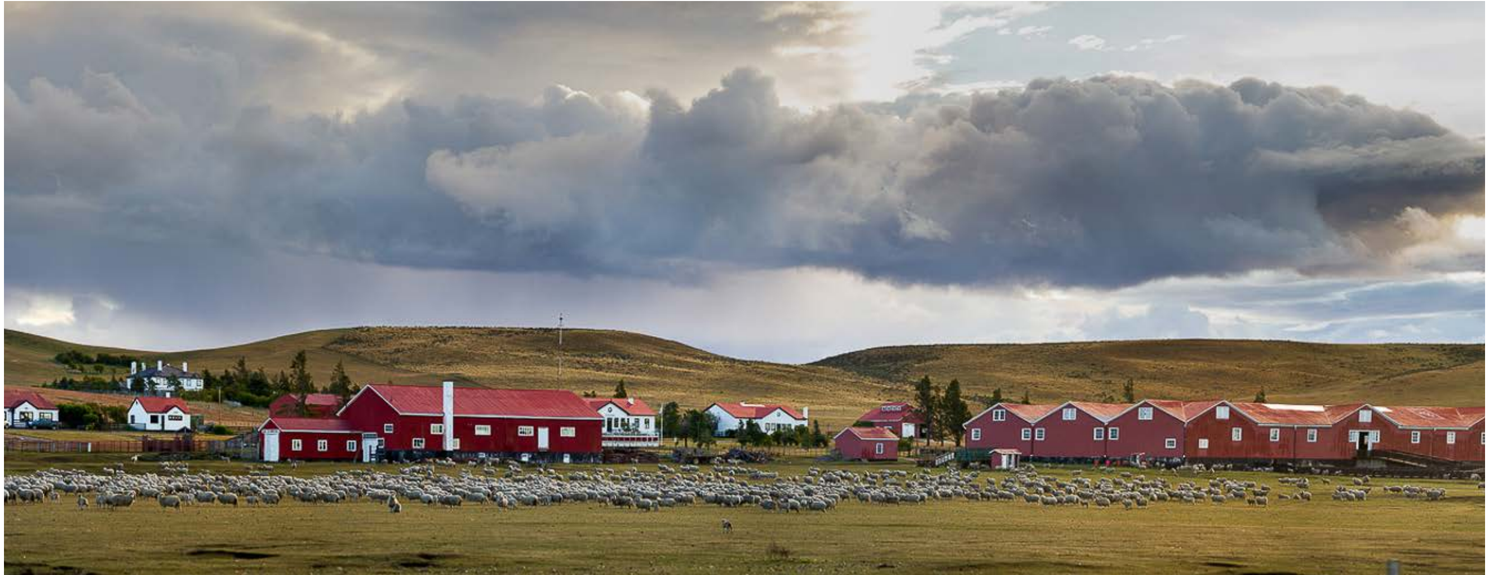
Villa María Lodge is located in the José Menéndez Estancia which was established in 1895