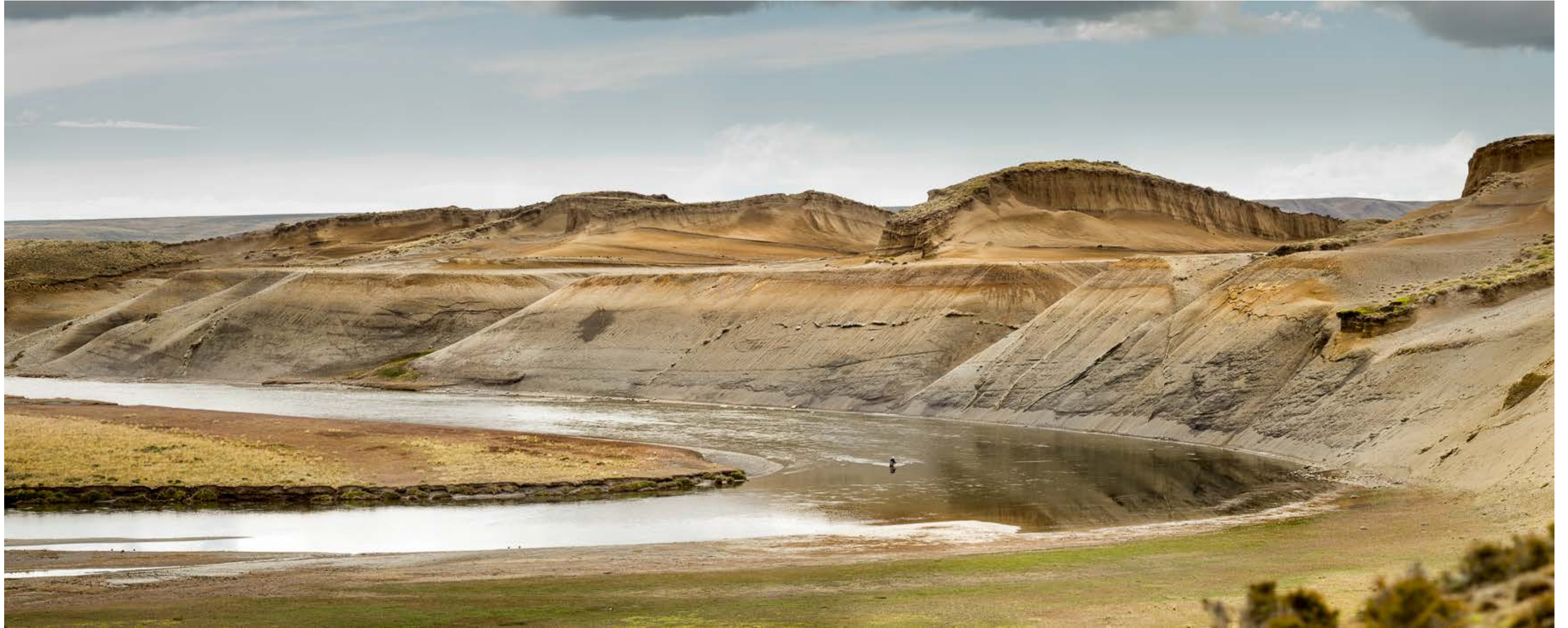
Villa María Lodge sits on the lower section of the Rio Grande, where powerful chrome sea trout enter the river system