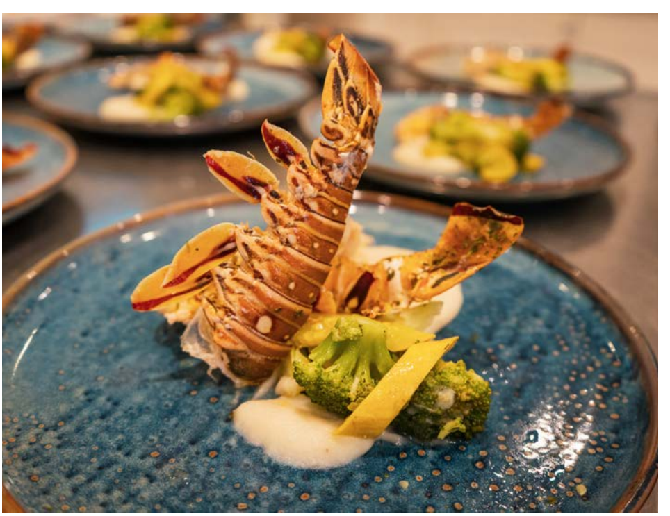
Roasted Crawfish. Food in the Bahamas is a magical encounter between the sea treasures, history, culture & its people.

concentrating on magnificent fresh seafood.