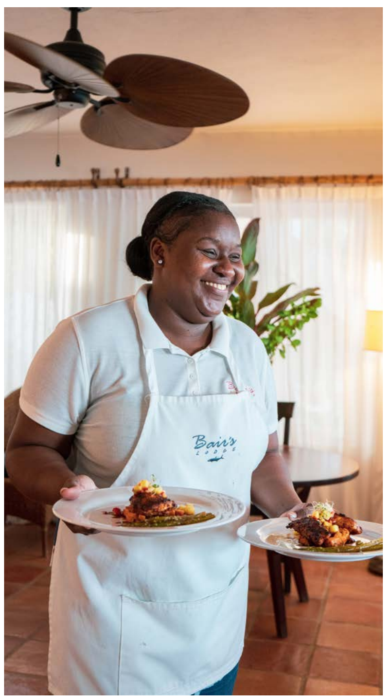
Our lodge has come to represent the benchmark in terms of quality guiding, delicious food, comfortable accommodations, and courteous hospitality.