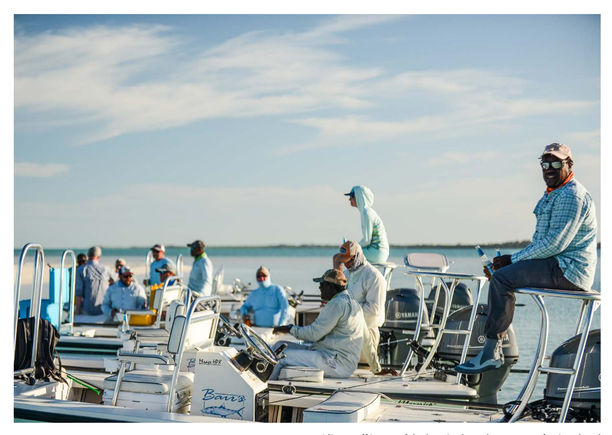
Our veteran guiding staff is one of the best in the Bahamas –professional and personable they can put you on the fish and help you iron your double haul.