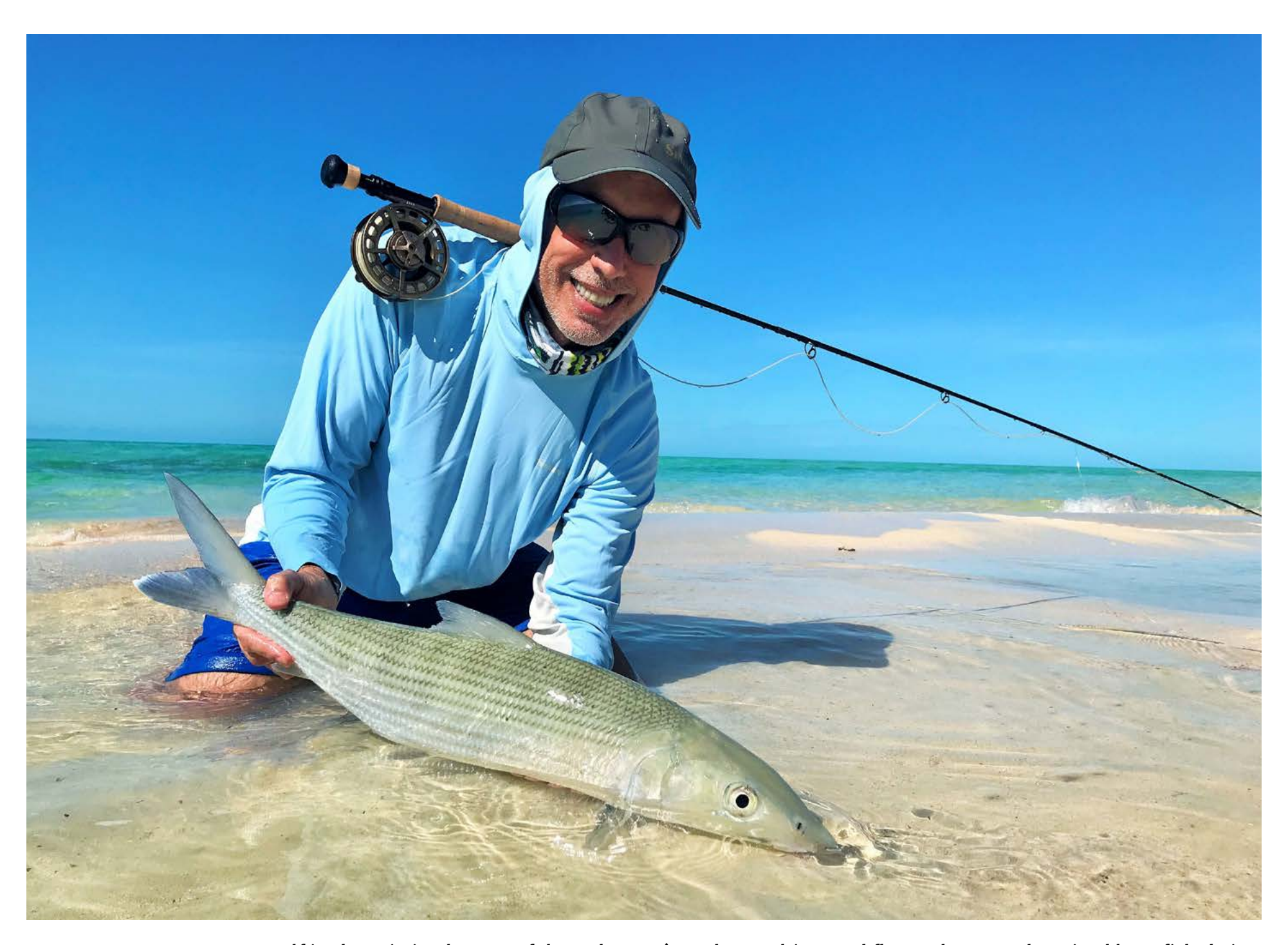
Immerse yourself in the pristine beauty of the Bahamas' southern white sand flats, where trophy-sized bonefish thrive.