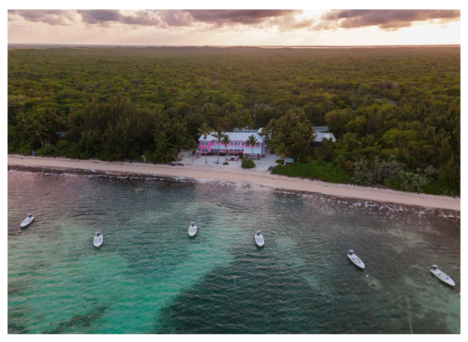
Bairs' Lodge is ideally located in front of the ocean, removing the need for trailering.