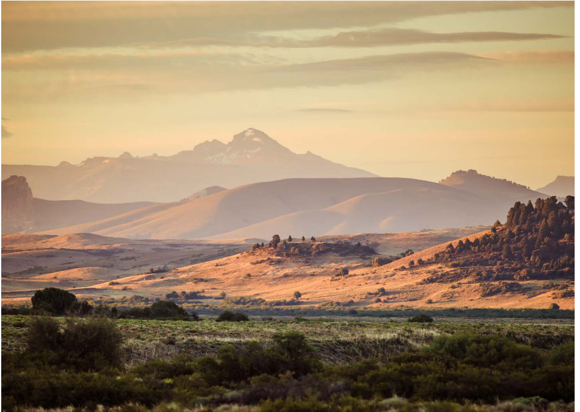
The landscape surrounding Northern Pataognia Lodge: Chimehuín Valley, Junín de los Andes.