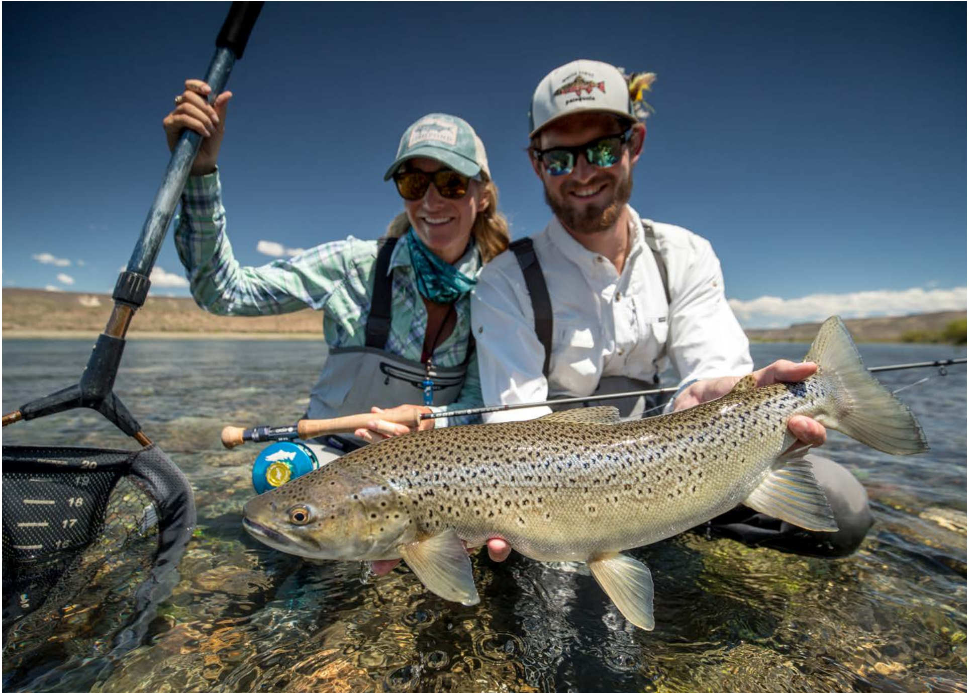
Northern Patagonia Lodge boasts front-door access to the greatest diversity of trophy brown and rainbow trout waters.