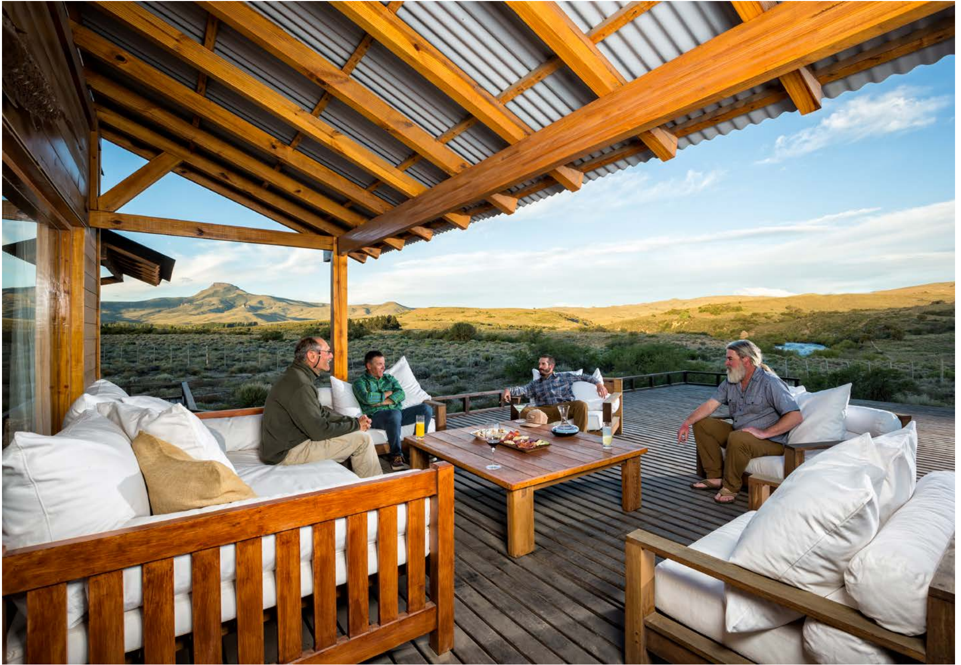
Enjoy a nice cocktail and appetizers on the deck, with matchless views of the Chimehuín River and the surrounding landscape.