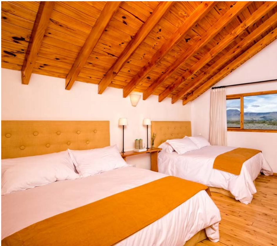
5 Double Rooms with 2 queen size beds.