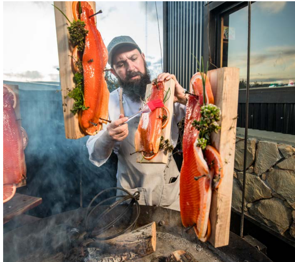
Wood roasted Patagonian trout hung over the fire.