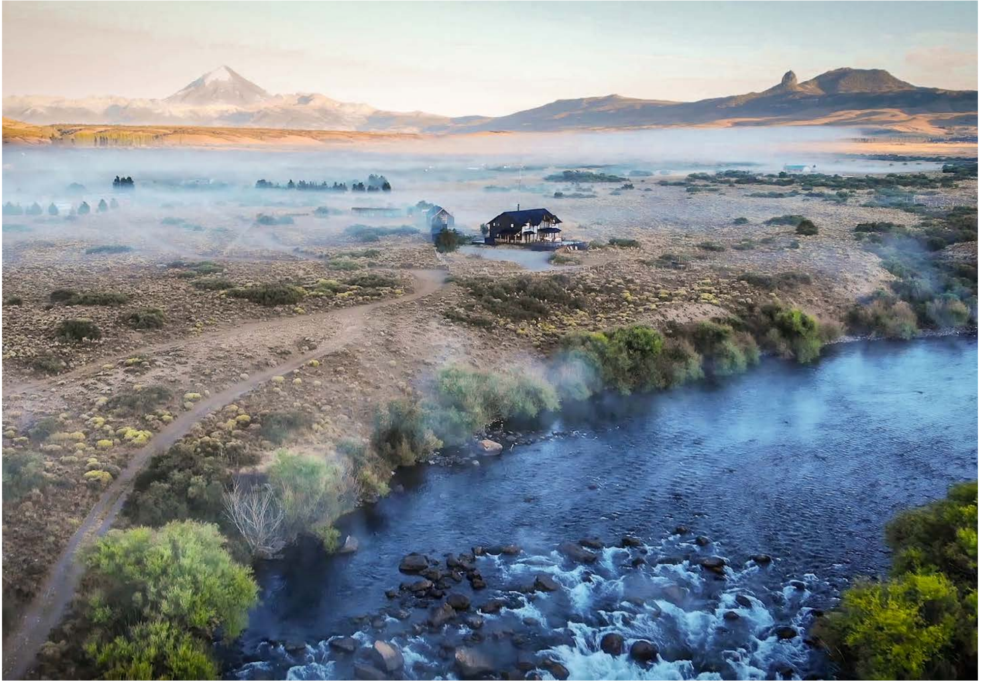
Nestled on the shores of the idyllic Chimehuin River, Northern Patagonia Lodge's location makes it a strategic hub for traveling anglers from around the world.