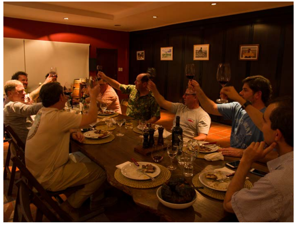
Dinner is served in our private dining/living area back at the lodge where you can expect delicious meals each night.