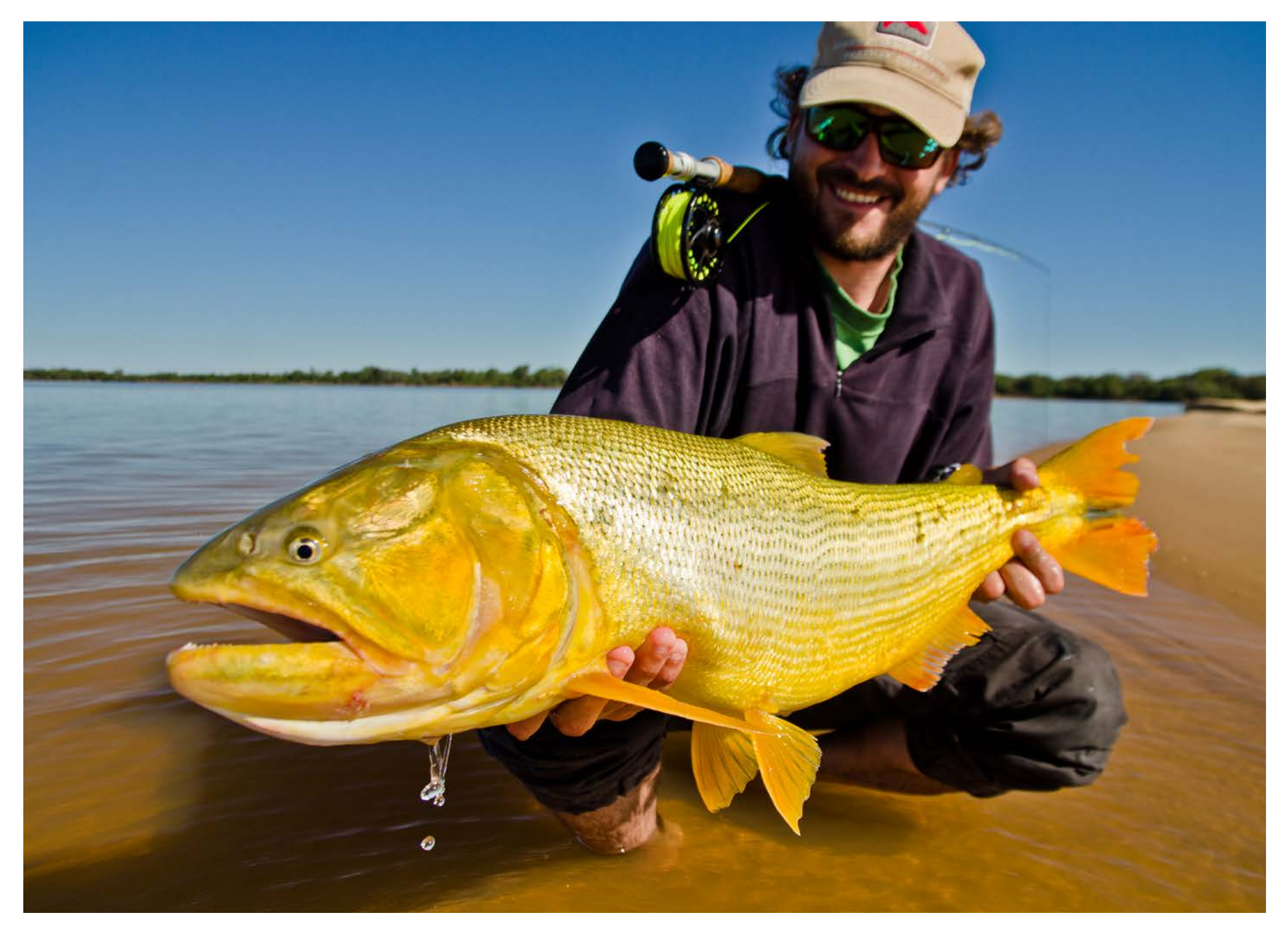
Double-digit Dorado are real possibilities... and that is PRO's main focus