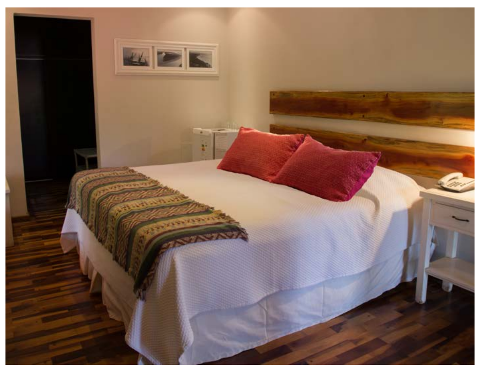
3 Doubles with 2 king/queen size beds.