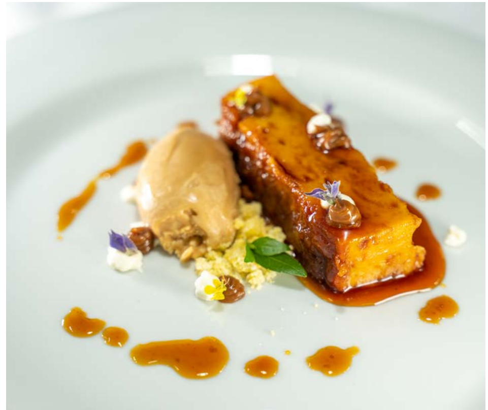
Desserts will surprise you with multiple textures and flavors designed to provide a unique final touch to your dining experience.