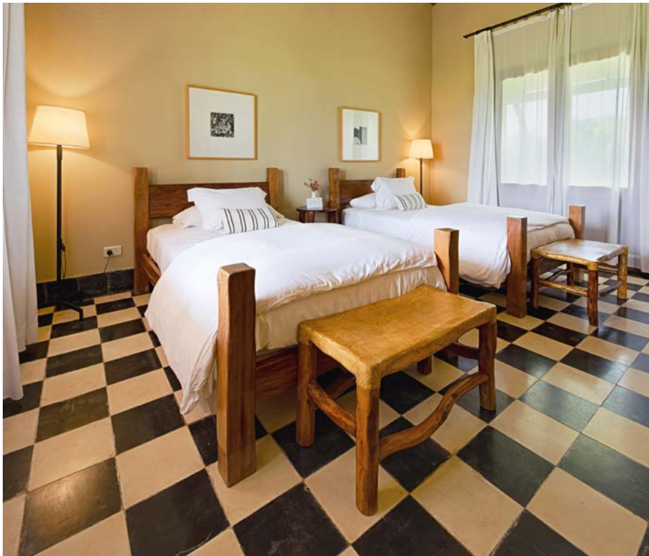
5 en-suite bedrooms fully air- conditioned and a cottage with 2 rooms and a shared bathroom.