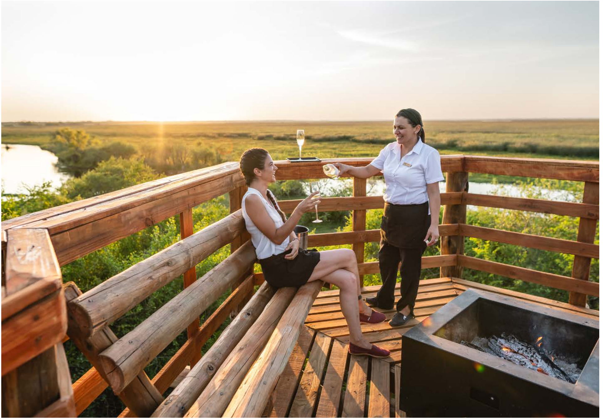
Enjoy a cold drink by the pool, or gather around the fire pit where under a setting sun the day's fishing stories commence.