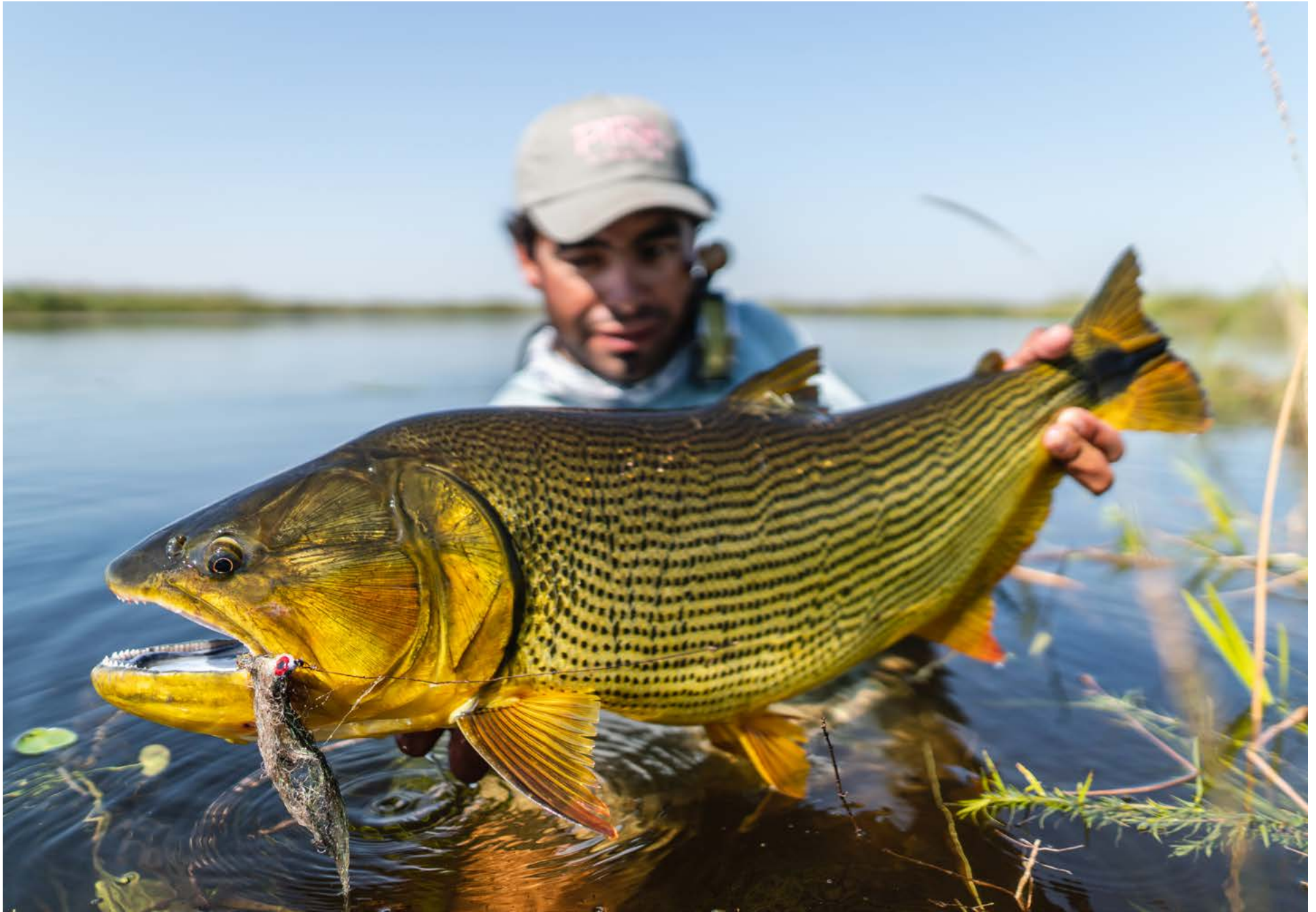
Pirá Lodge places anglers on a habitat-rich bottleneck where the marsh and Corriente River ecosystems converge. Here, the Dorado is king.