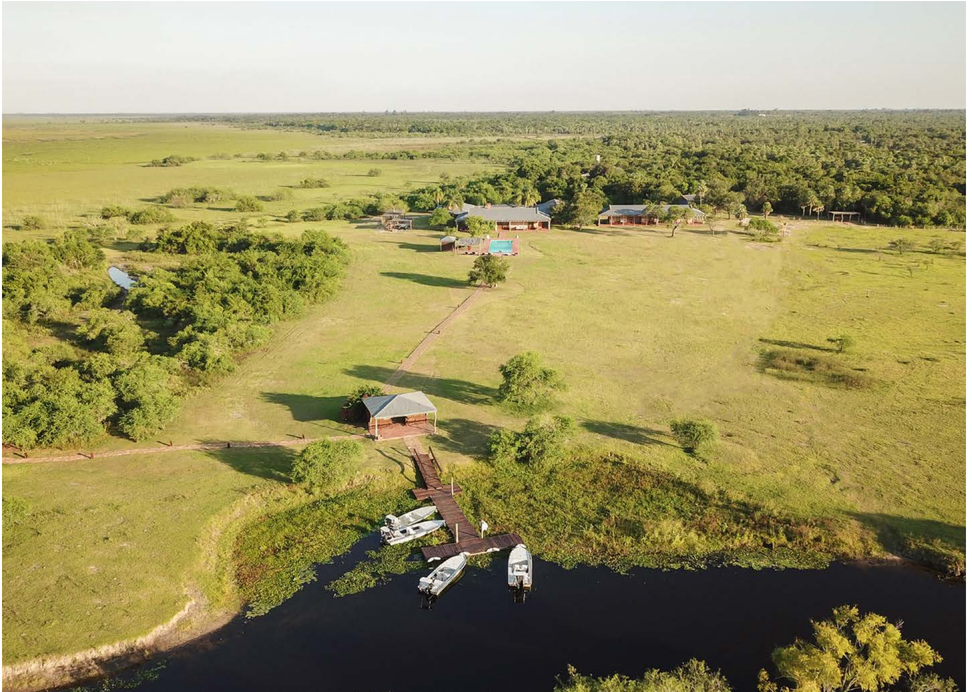
Luxurious and strategically located, Pirá Lodge has direct access to the Iberá Marshlands.