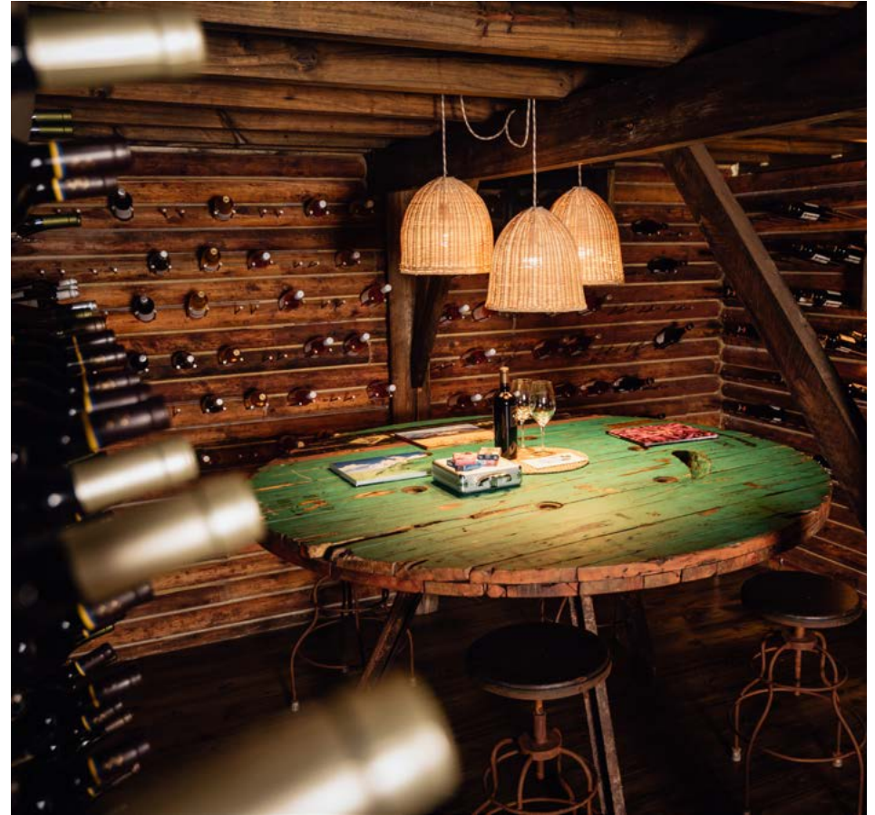
Game Room & Wine Cellar.