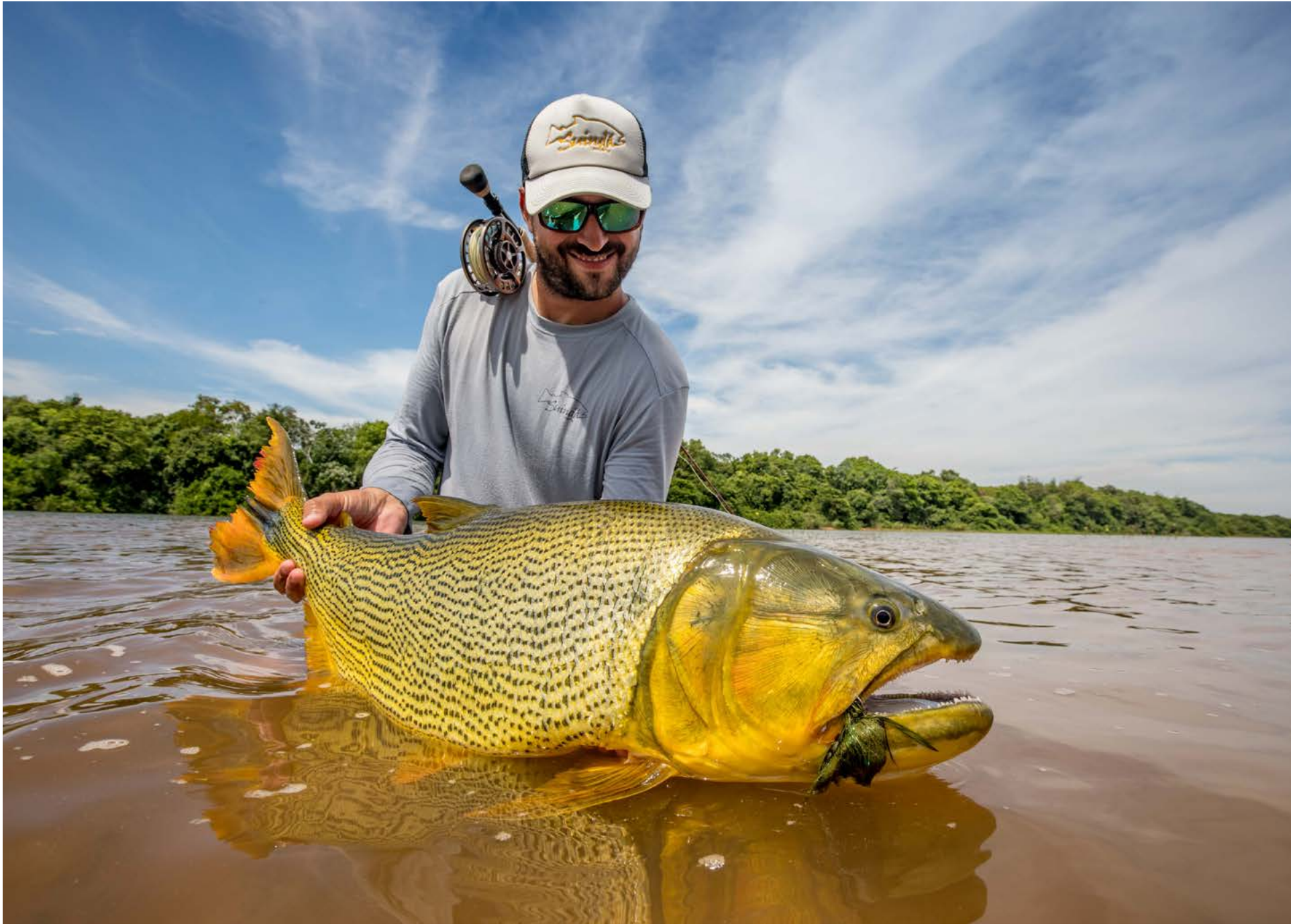
Double-digit Dorado are a possibility all season long.