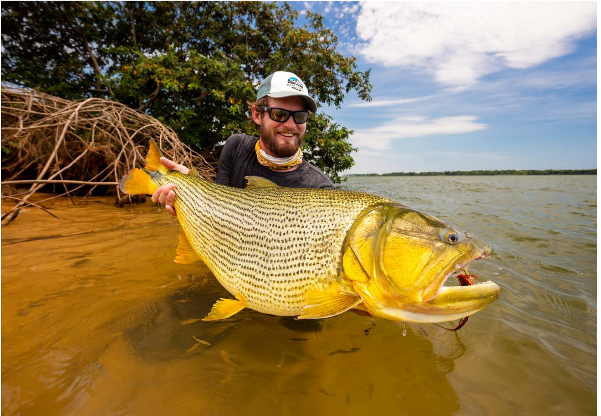
The region houses one of the most productive sections on the Upper Paraná River, a clear-water fishery that consistently kicks out good numbers of large Dorado.