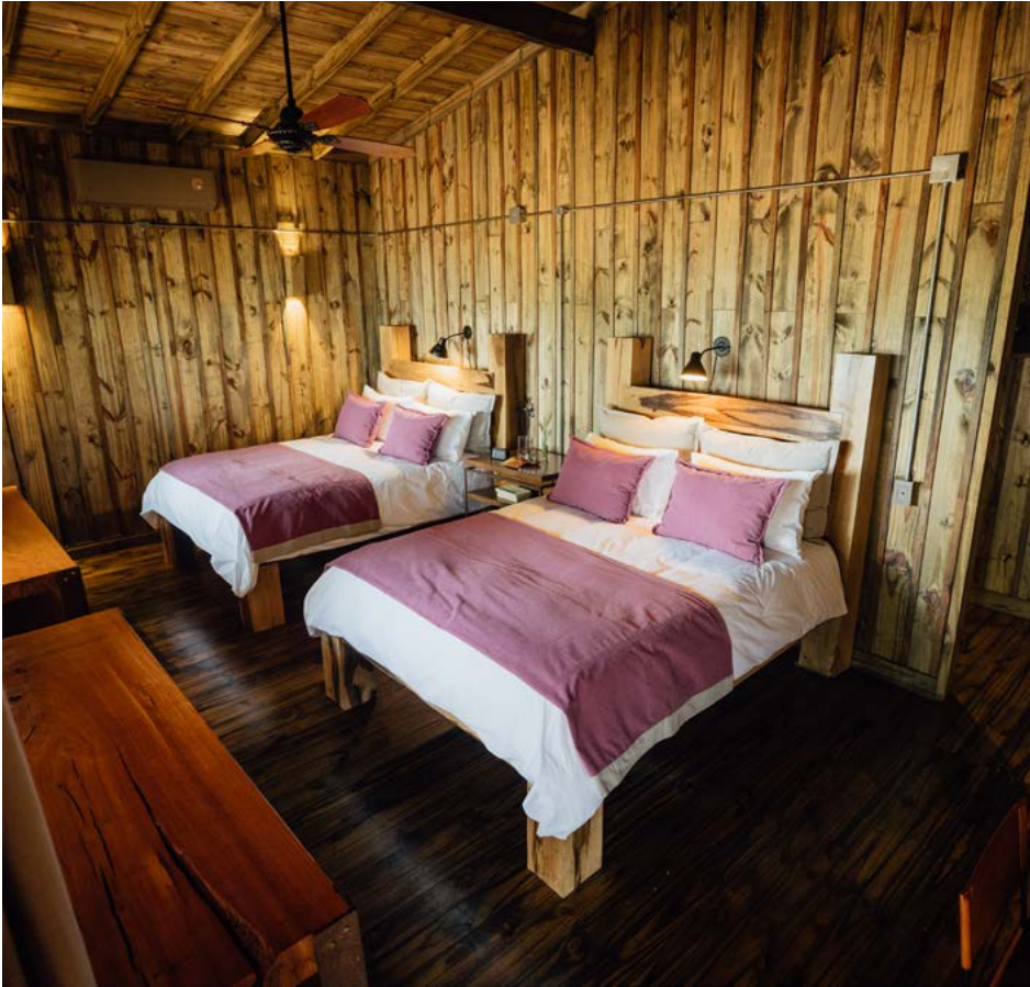
All rooms feature two double beds and en-suite bathrooms.