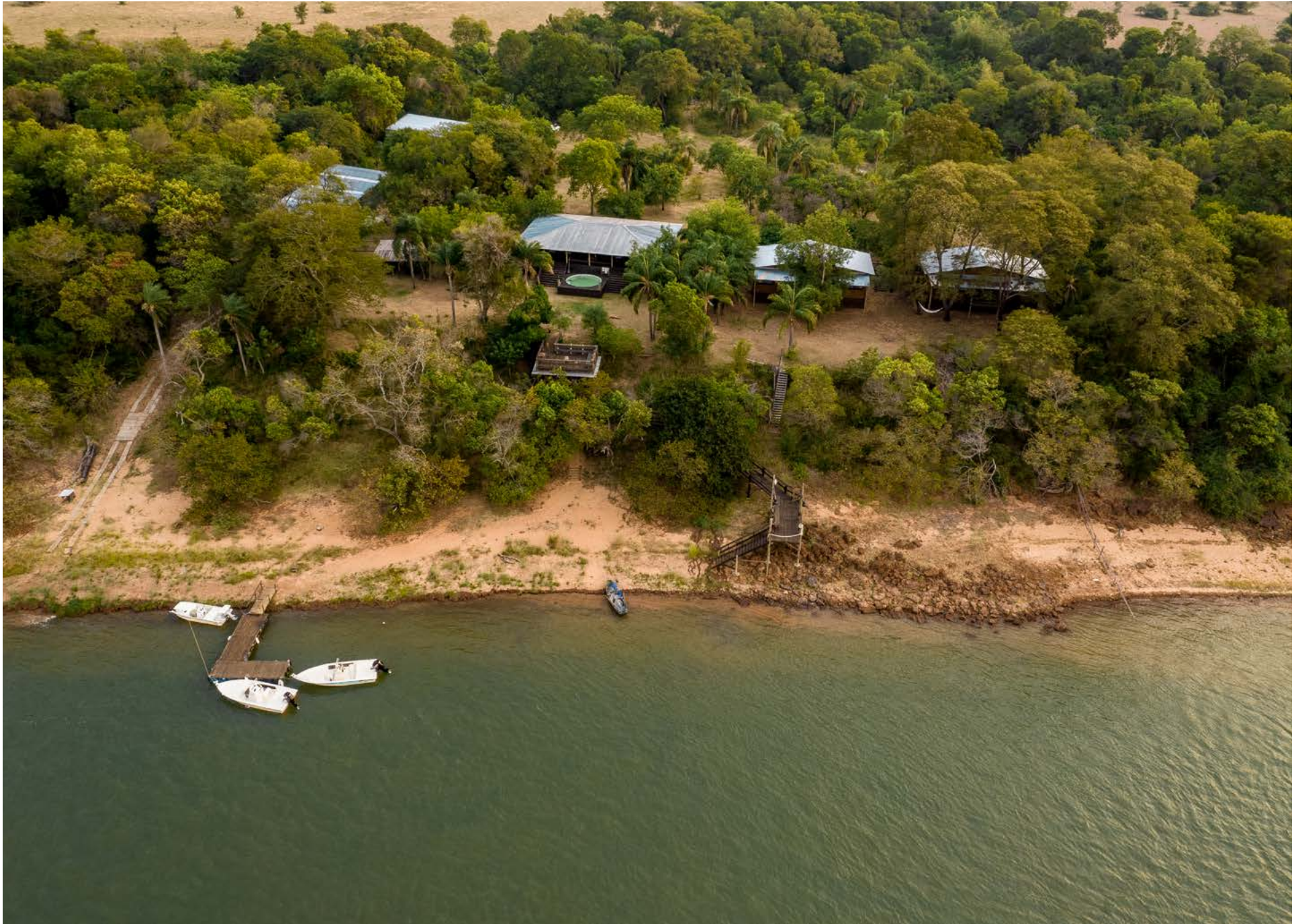
Suindá is a Dorado angler's dream, strategically located near the town of Itatí, in the province of Corrientes.