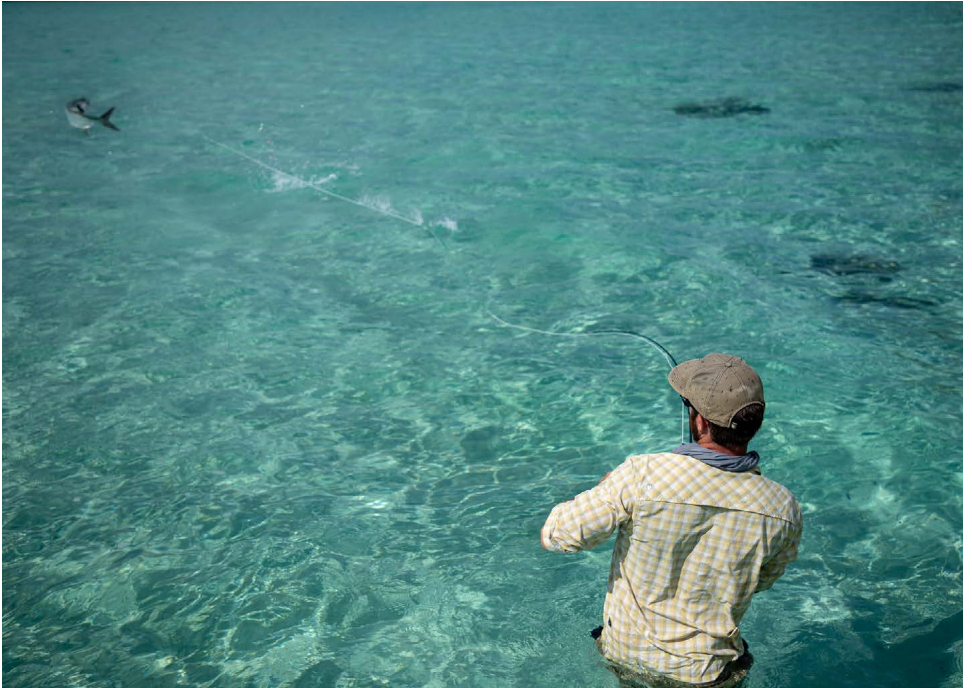
Thanks to the protection of the Sian Ka'an Biosphere, Ascension Bay has a huge nursery of juvenile tarpon.