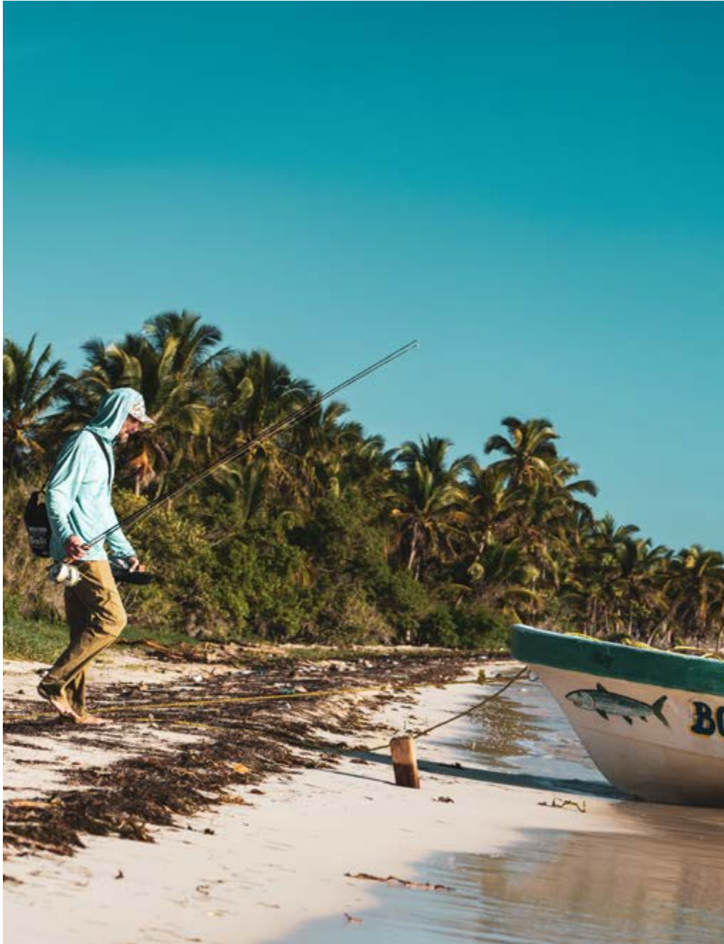
Comfortable pangas–Permit landing craft– are beached right near the lodge. No bumpy roads. No wasted time trailering.