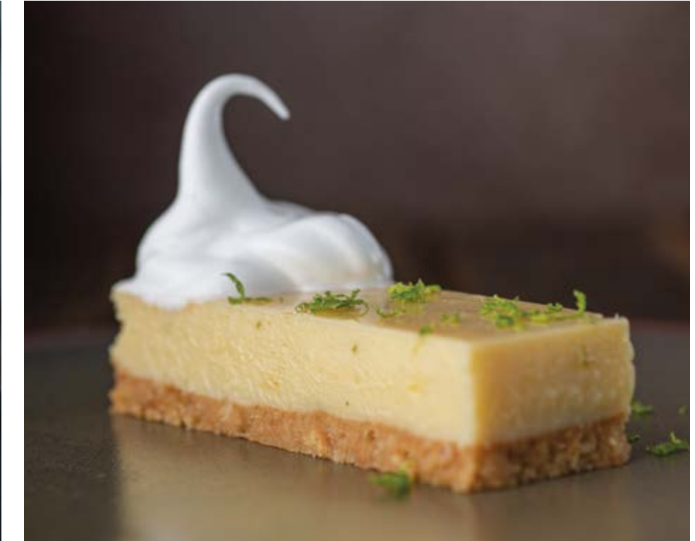
Key Lime Pie