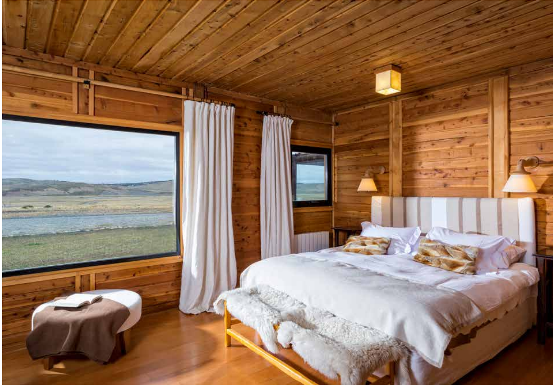
Kau Tapen has 10 en suite single rooms; some offer a king bed, some have one queen, and others are furnished with two doubles.