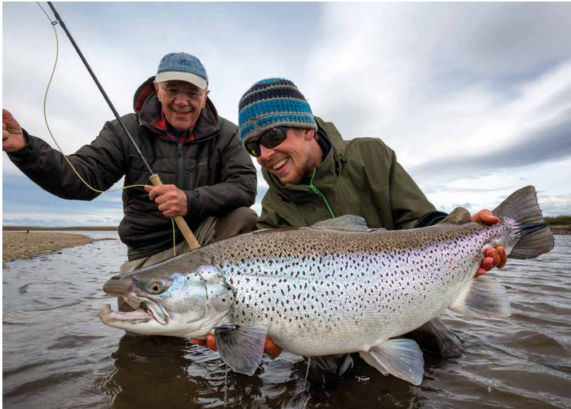
The Rio Grande has become the most productive sea-run brown trout fishery in the world.