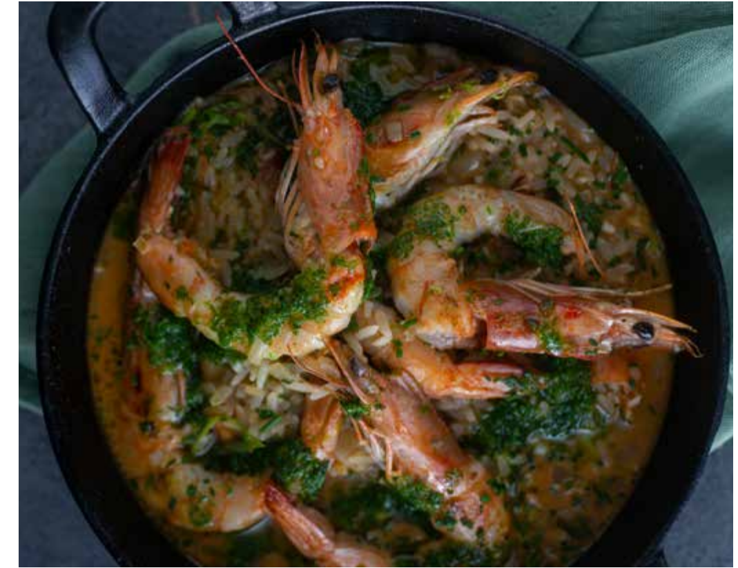
Soupy Rice with Patagonian Prawns.