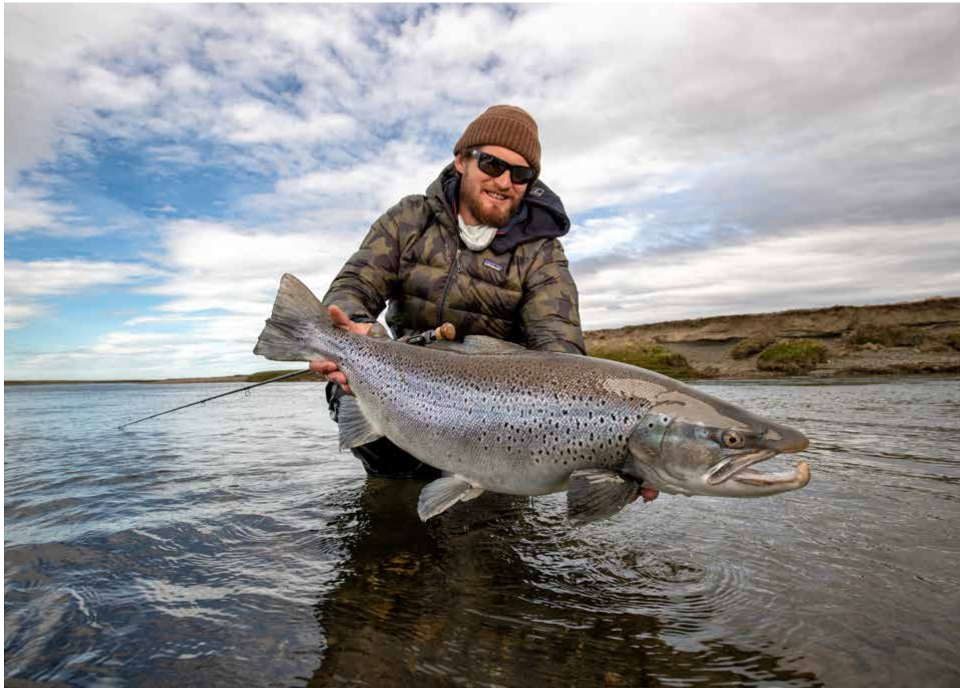
In the heart of the Río Grande watershed, lie the best pools on the river, and the finest fish.