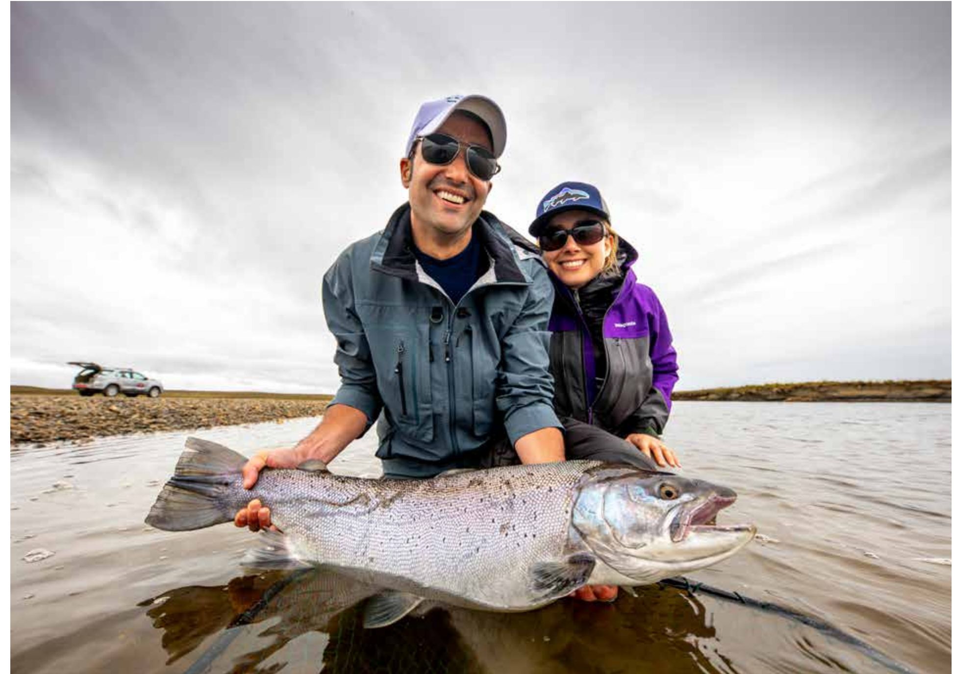
At Kau Tapen we fish for Sea-Run Brown Trout weighing an average of 7 lbs and ascending to 30lbs and above.