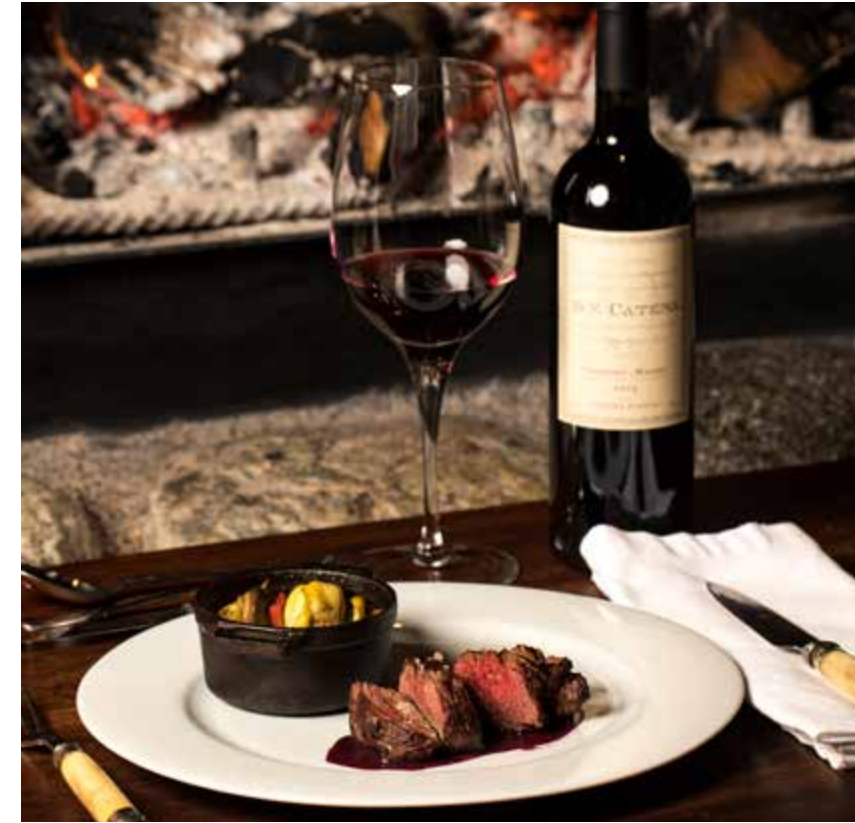
Our menus are paired with some of the world's best wines.

Built-in 1984, Kau Tapen Lodge was designed to offer rods maximum comfort during their fishing trips as well as easy access to the best pools on the world-famous Río Grande. The lodge accommodates up to 10 guests (and occasionally 12) in en-suite single rooms to ensure privacy and comfort; some offer a king bed, some have one queen, and others are furnished with two doubles. A large living room opens up to peaceful vistas of the Menendez and Río Grande valleys and includes a roaring fire and a well-stocked bar. The lodge also boasts a tackle shop with an excellent selection of Loop rods, quality fly reels, flies, lines, Simms clothing, and other fishing essentials. In addition, guests have full use of the lodge's fly-tying table and equipment. Additional Kau Tapen highlights include two wading/fly gear rooms, a full spa with jacuzzi, a sauna, and a Finnish steam bath.