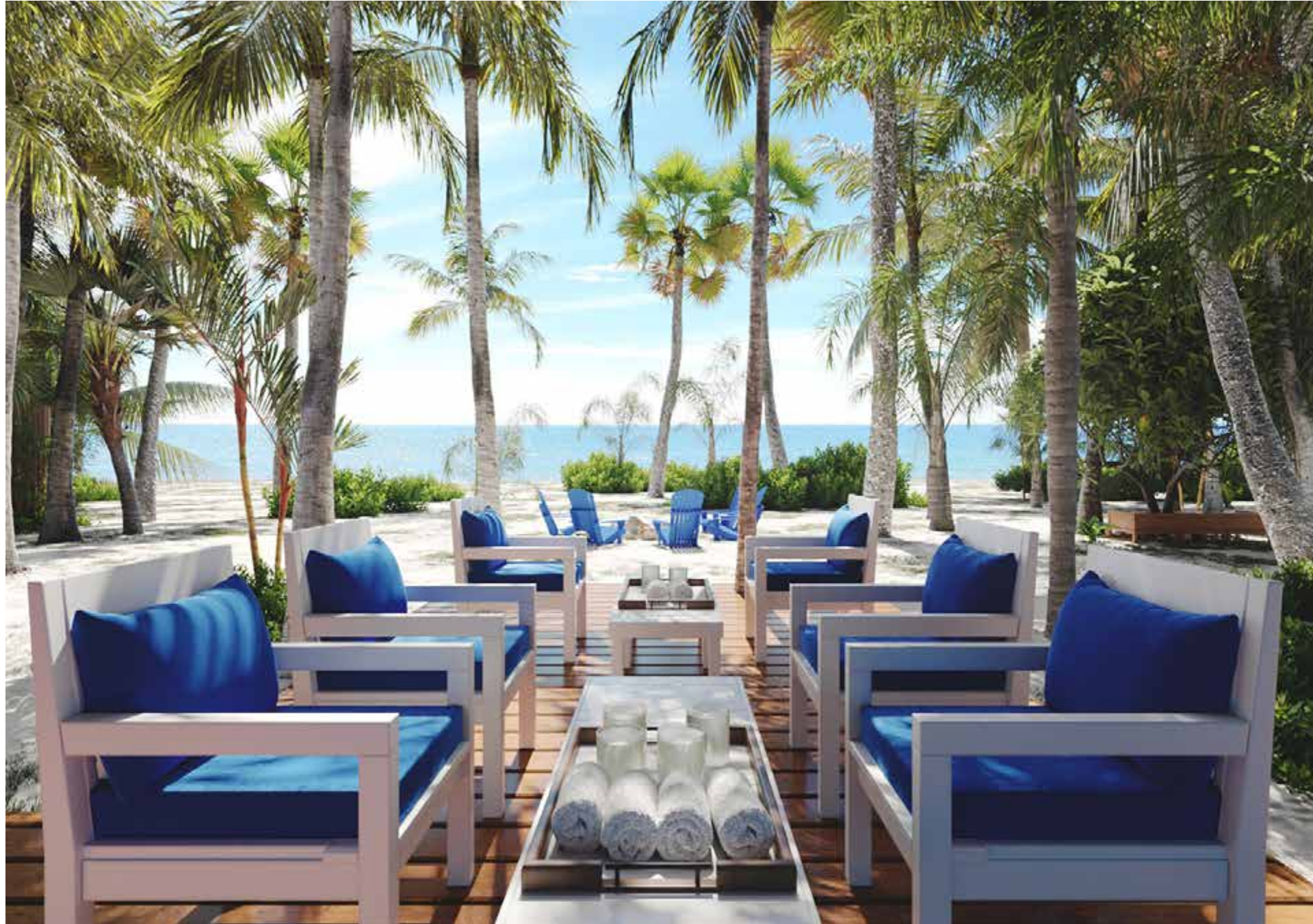
Picture yourself relaxing here after an exciting day of fishing. In the background, salt water. In the foreground salt on the rim of a cool drink.