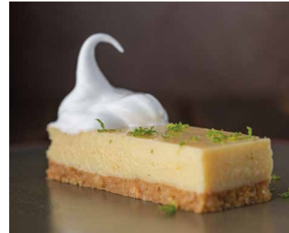
Key Lime Pie