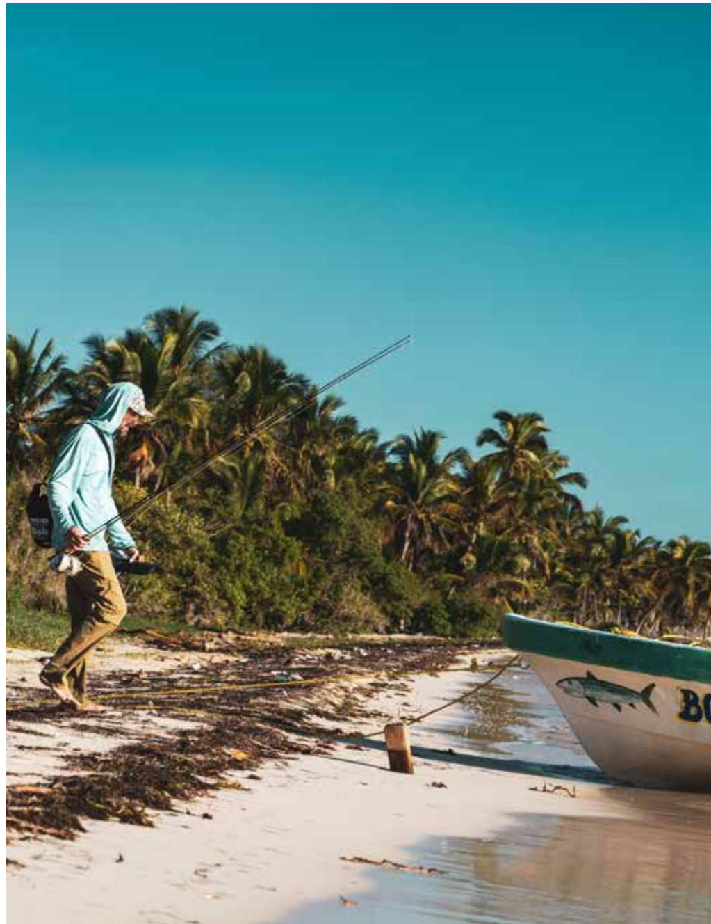
Comfortable pangas-Permit landing craft- are beached right near the lodge. No bumpy roads. No wasted time trailering.