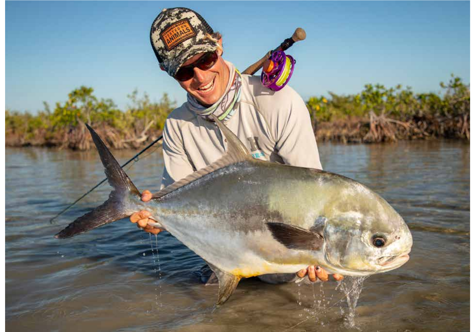
A big permit in hand—the final product of dreams, planning, work, luck, and clean living!