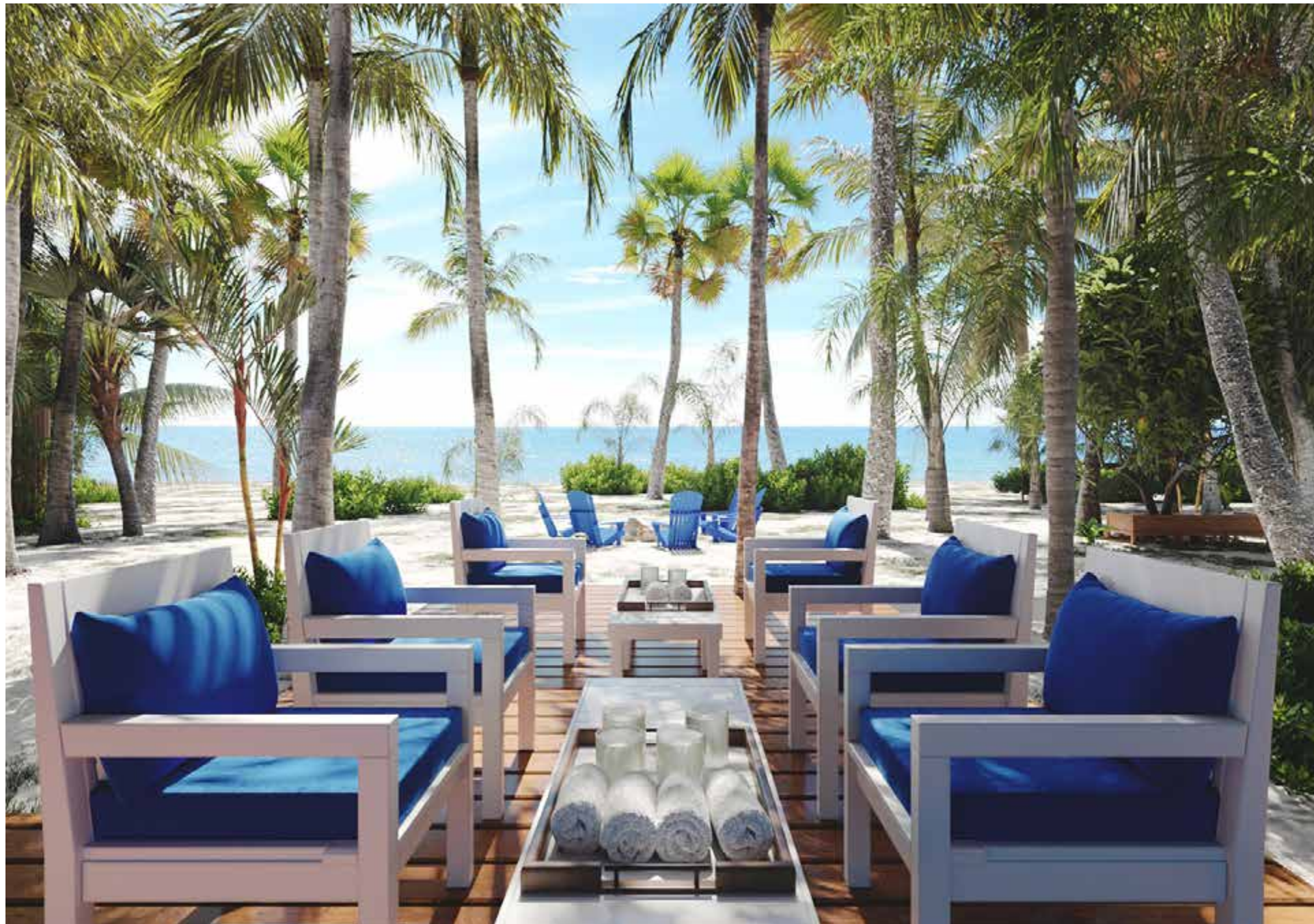
Picture yourself relaxing here after an exciting day of fishing. In the background, salt water. In the foreground salt on the rim of a cool drink.