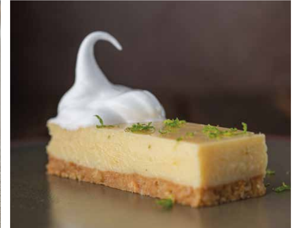
Key Lime Pie