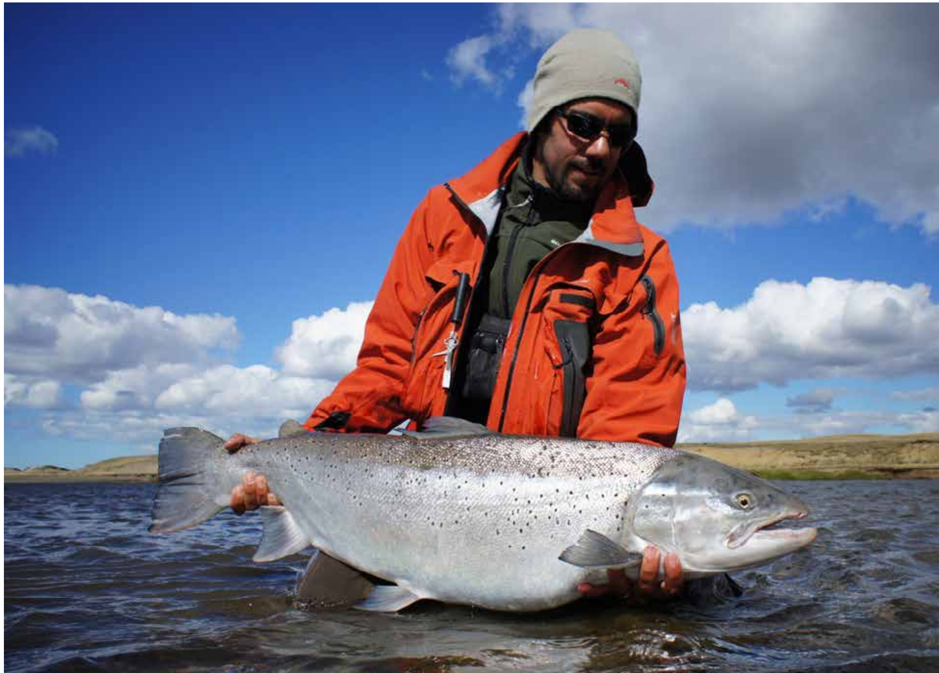
Villa María Lodge sits on the lower section of the Rio Grande, where powerful chrome sea trout enter the river system.