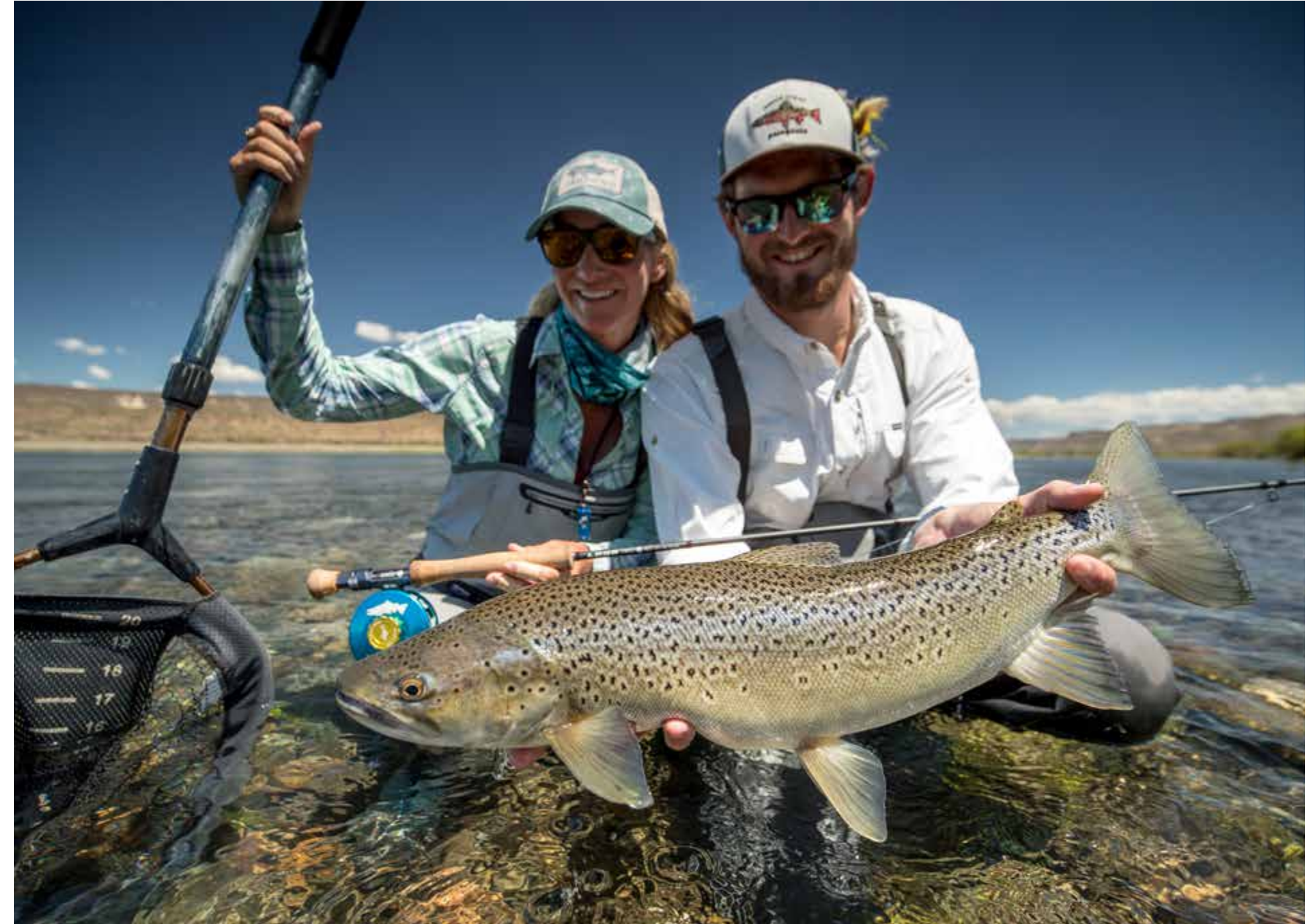
Northern Patagonia Lodge boasts front-door access to the greatest diversity of trophy brown and rainbow trout waters.