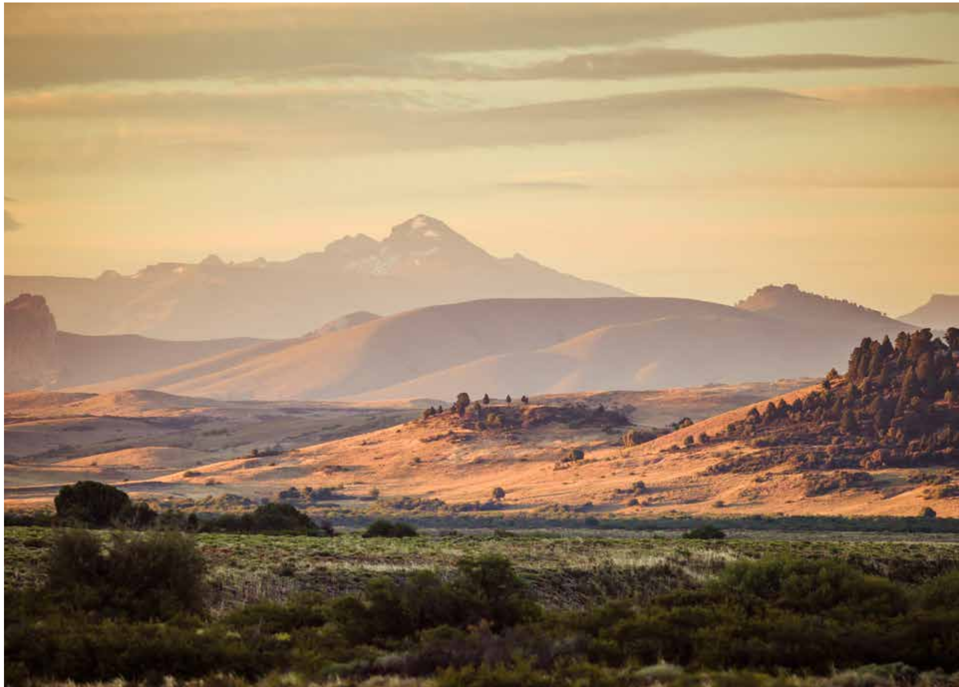
The landscape surrounding Northern Patagonia Lodge: Chimehuín Valley, Junín de los Andes.