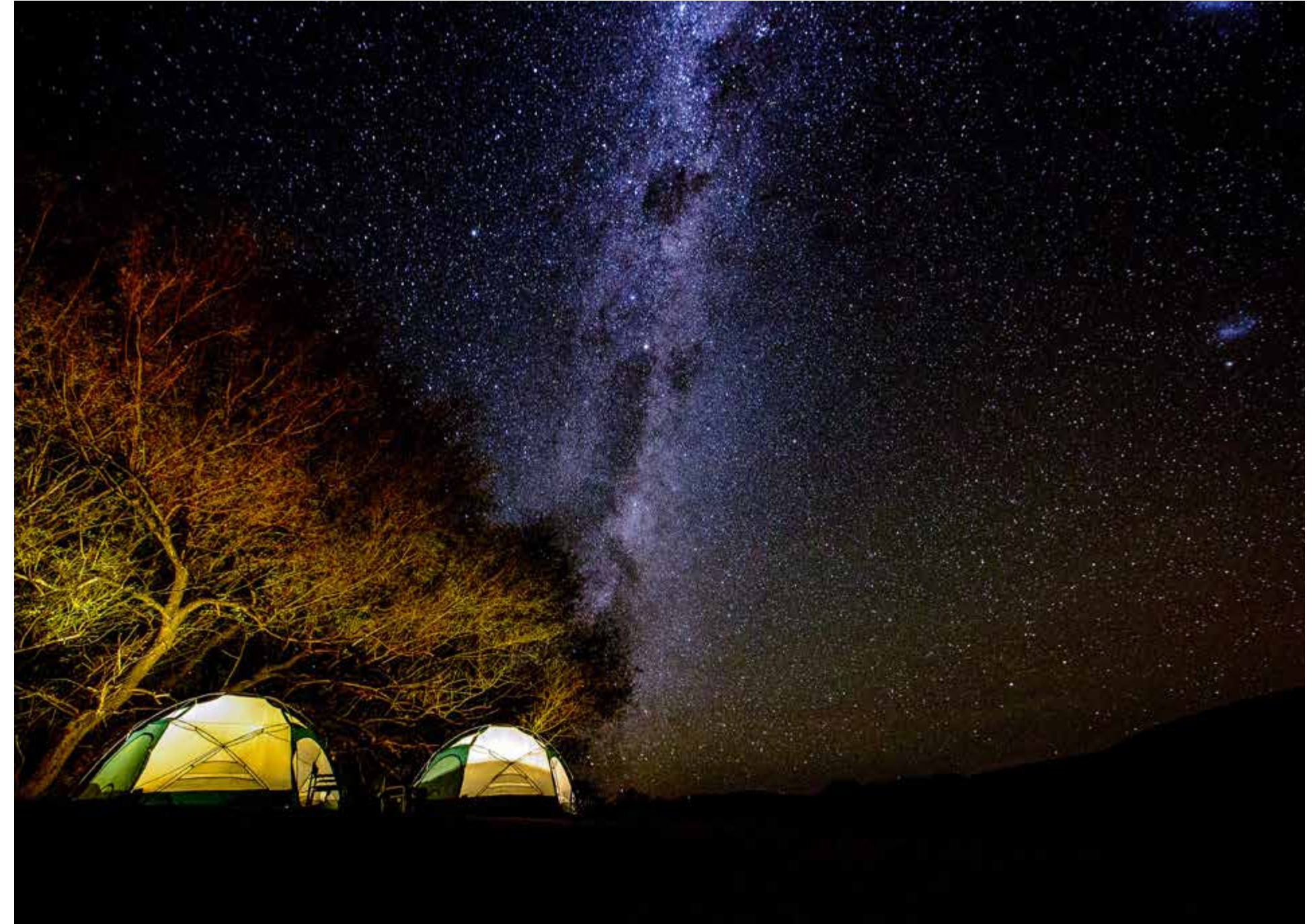
Discover breathtaking views of the night sky found nowhere else.