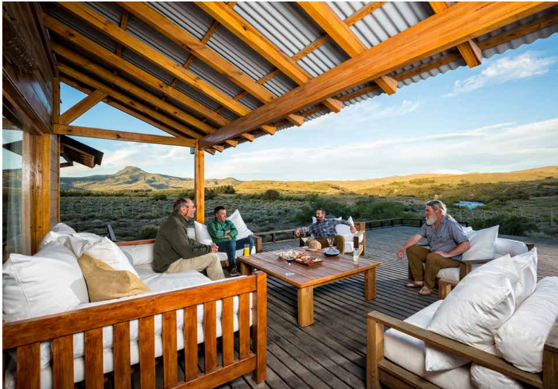
Enjoy a nice cocktail and appetizers on the deck, with matchless views of the Chimehuín River and the surrounding landscape.