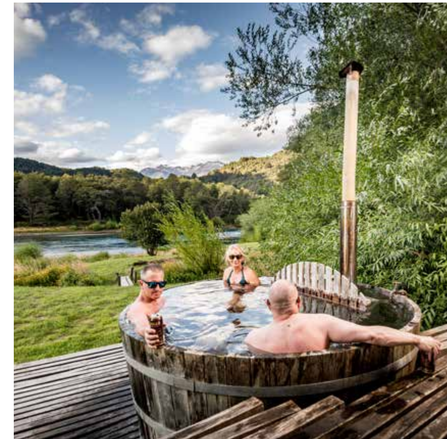
There is a wooden Hot Tub located right in front of the river so you can relax after a day of fishing.