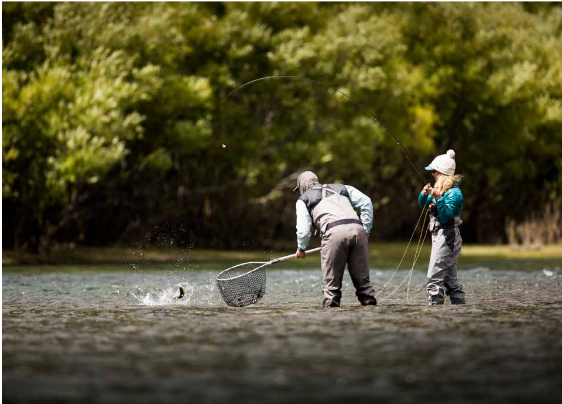
A variety of the rivers and techniques is used to deceive the resident and occasional sea-run fish that inhabit our home waters.