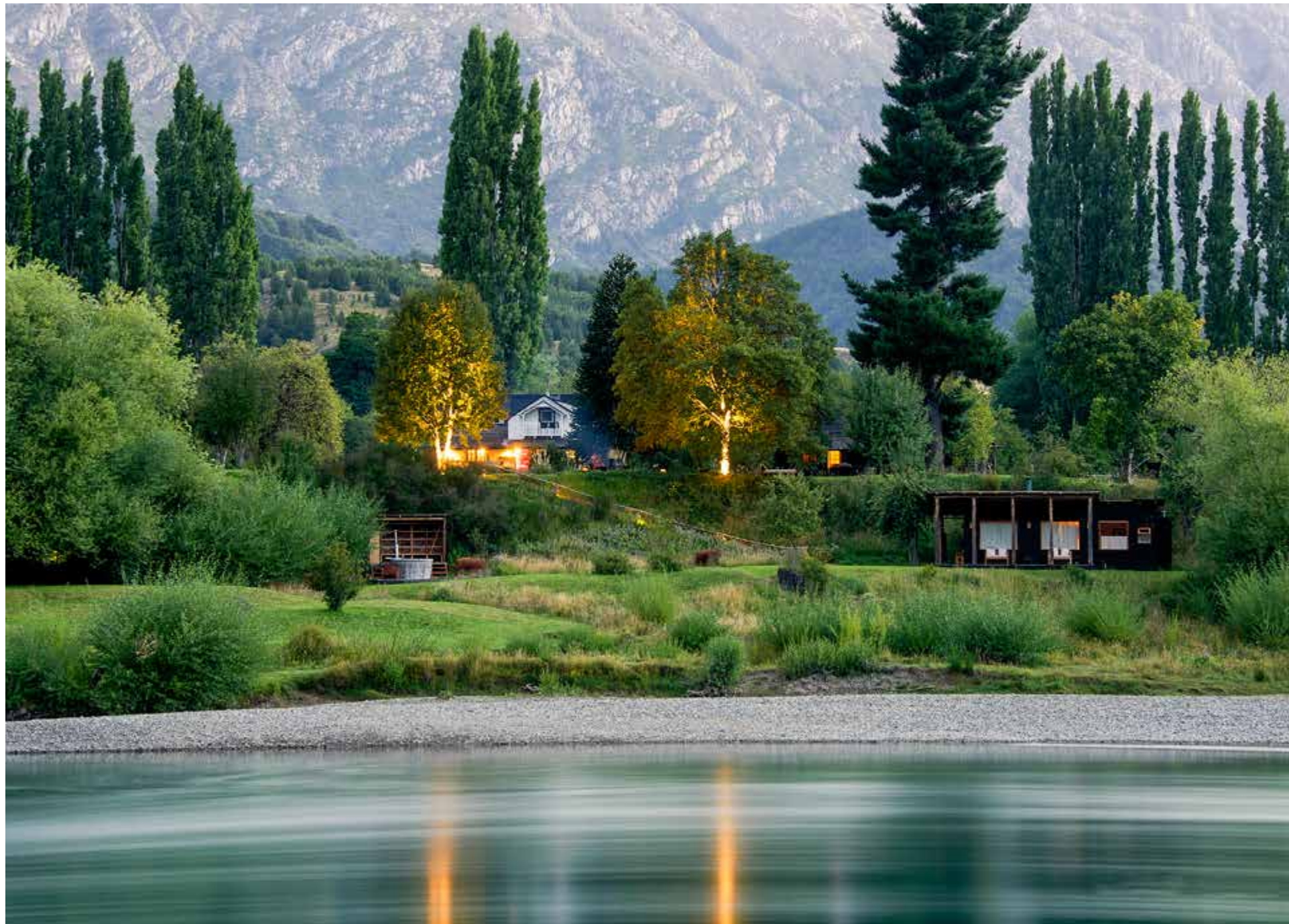
Futa Lodge is situated in the Valle de las Escalas, boasting pristine views of the Futaleufú river.