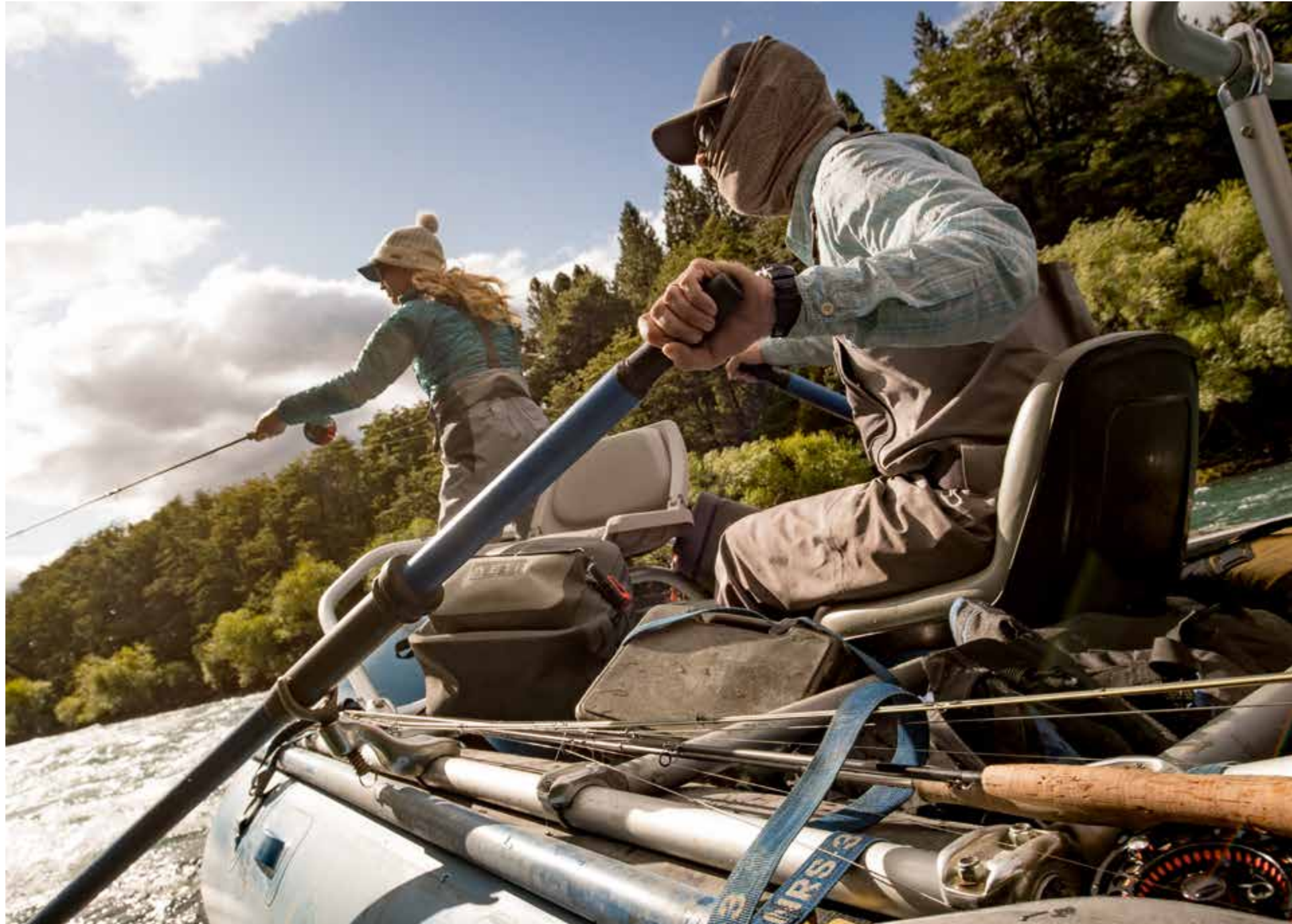
A spectacular diversity of fishing, from float trips on the Futaleufú to intimate tributaries and hidden lakes.