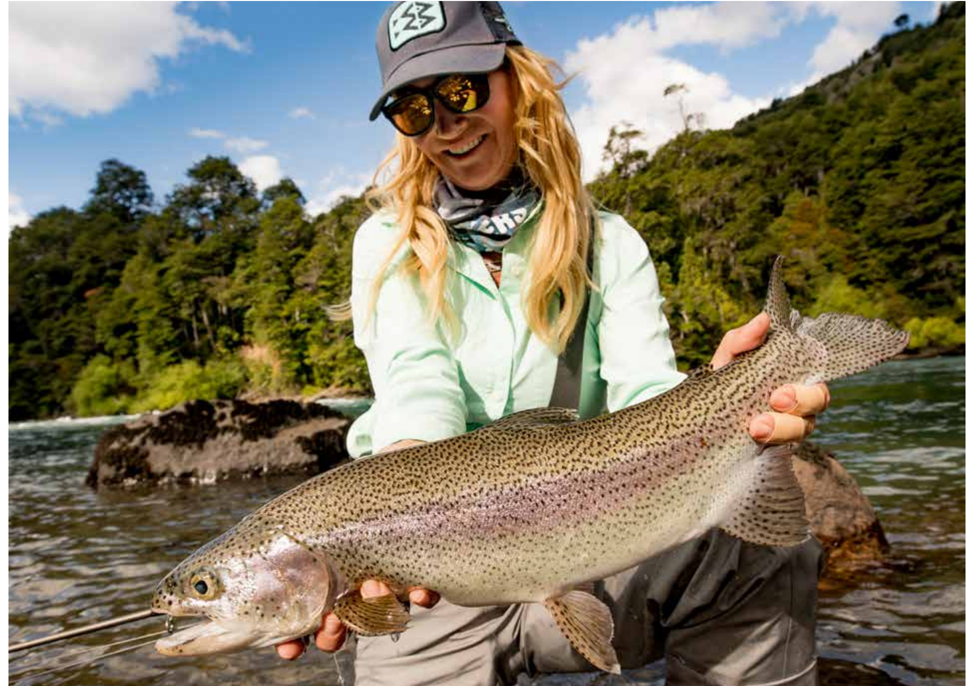
Trophy trout in addition to prolific numbers of fish in the 15–18 inch class.