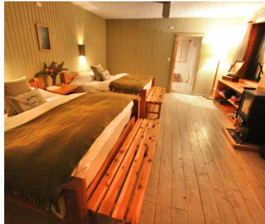
Futa Lodge has three bright and comfortable cottages, each with two queen size beds and en-suite bathroom.

Welcome to your remote and relaxing riverfront home in the Valle de las Escalas region of Chilean Patagonia. Our lodge can host up to 8 guests (6 anglers and 2 non-anglers). There are three bright and comfortable cottages—one next to the main lodge and the others bordering the river's edge. The main lodge consists of a cozy living room with a fireplace and two additional double rooms.