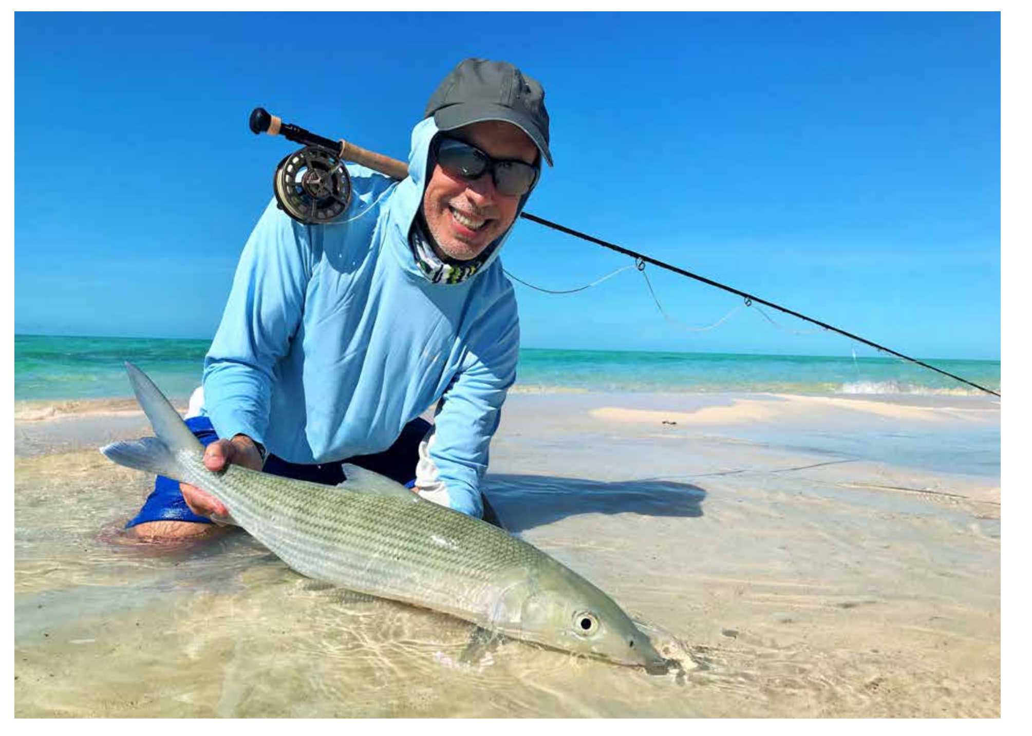
Immerse yourself in the pristine beauty of the Bahamas' southern white sand flats, where trophy-sized bonefish thrive.