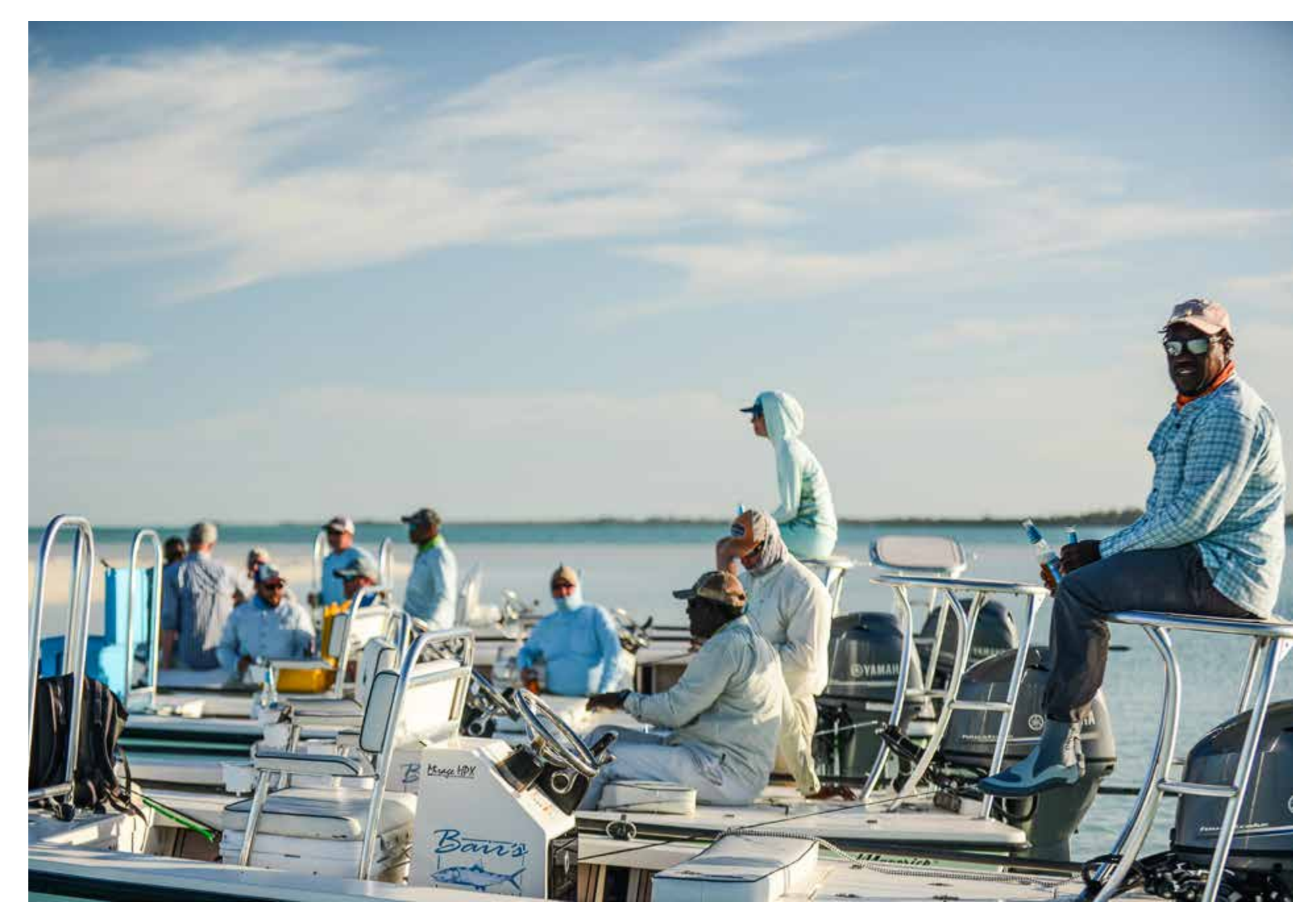
Our veteran guiding staff is one of the best in the Bahamas –professional and personable they can put you on the fish and help you iron your double haul.