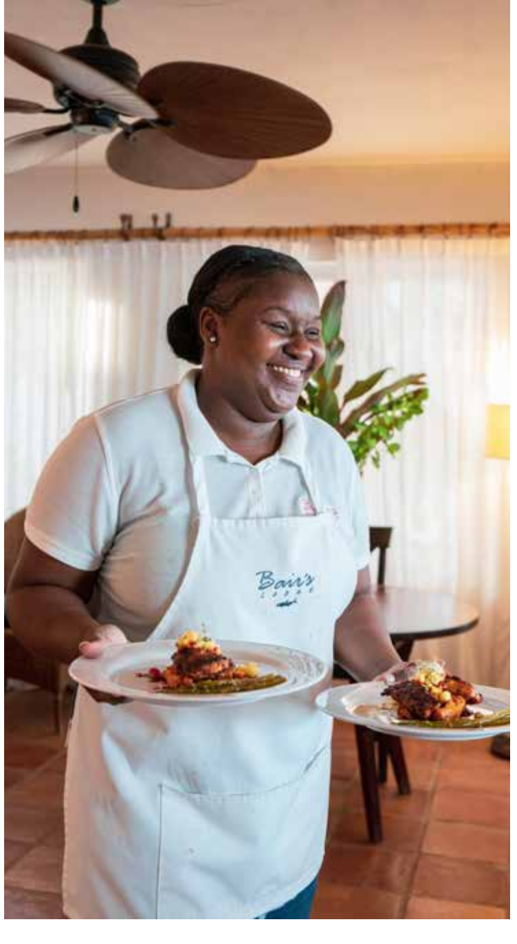
Our lodge has come to represent the benchmark in terms of quality guiding, delicious food, comfortable accommodations, and courteous hospitality.