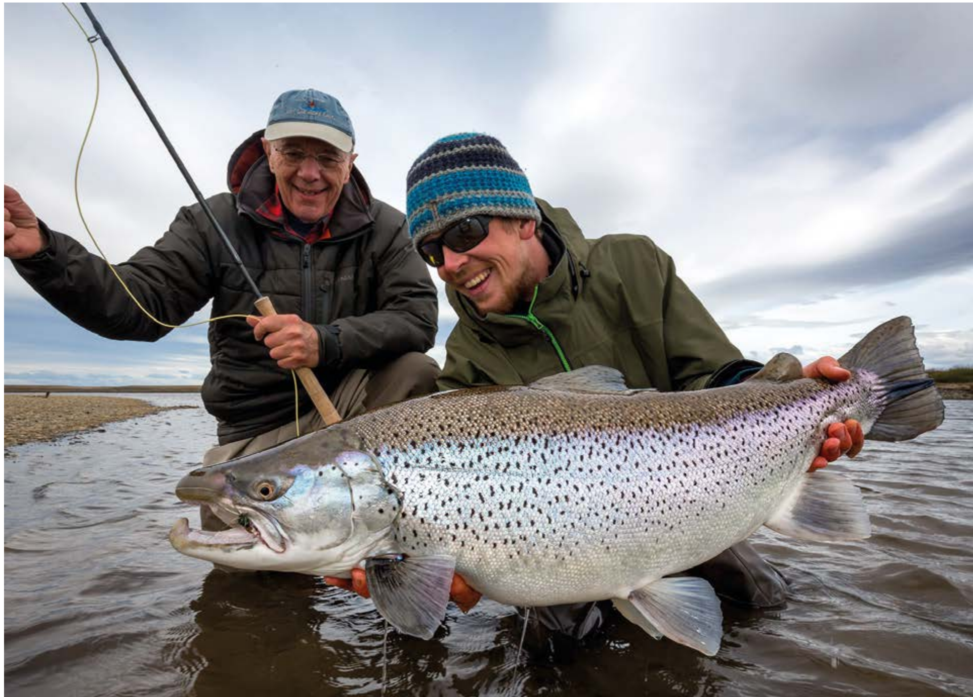
The Rio Grande has become the most productive sea-run brown trout fishery in the world.