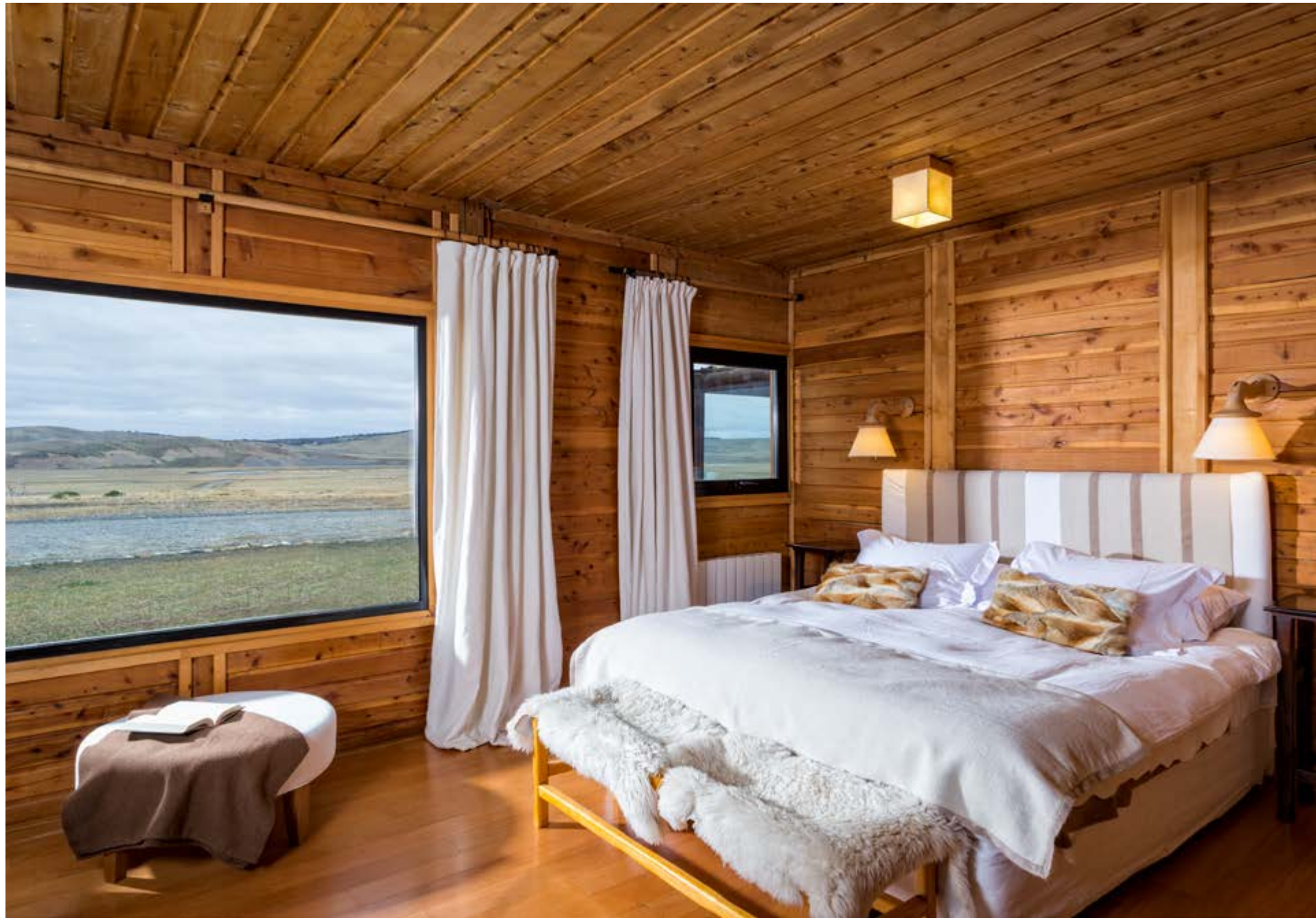
Kau Tapen has 10 en suite single rooms; some offer a king bed, some have one queen, and others are furnished with two doubles.