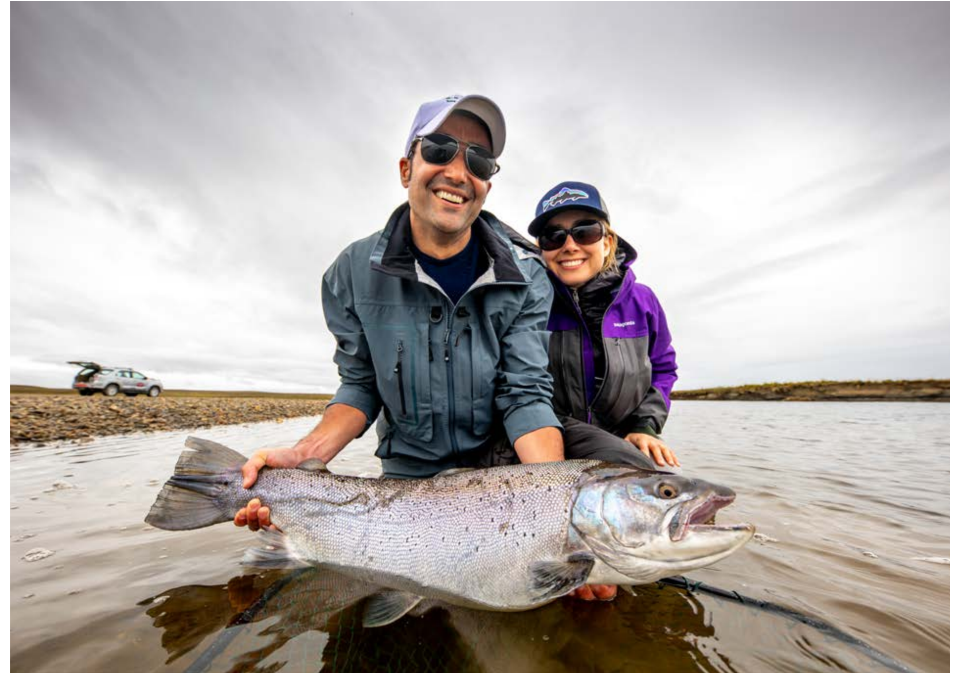
At Kau Tapen we fish for Sea-Run Brown Trout weighing an average of 7 lbs and ascending to 30lbs and above.