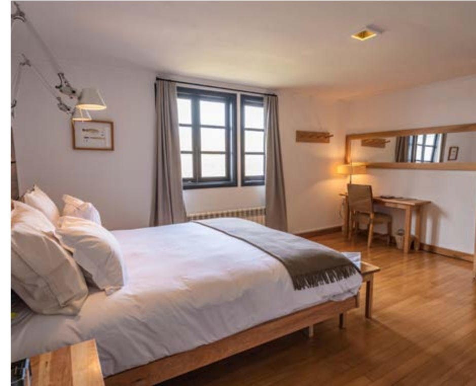
Villa María Lodge offers 3 en-suite double rooms and 3 single en-suite queen bedrooms.

Though it appears to be a traditional ranch structure on the outside, make no mistake that Villa María Lodge is a modern, comfortable fishing lodge in every way today with 6 en suite double and single rooms, smart furnishings, and spacious living areas. Delightful meals are prepared daily by the lodge's dedicated chef, so you will fish each day well fortified for battle with the Río Grande's giant trout. Each evening, a roaring fire and well-stocked bar will welcome you back from the day's adventures. The lodge has a tackle shop stocked with Loop rods, quality reels, flies, lines, clothing, and other on and off water gifts and essentials. In addition, guests have the full use of the lodge's fly-tying table and gear storage rooms.