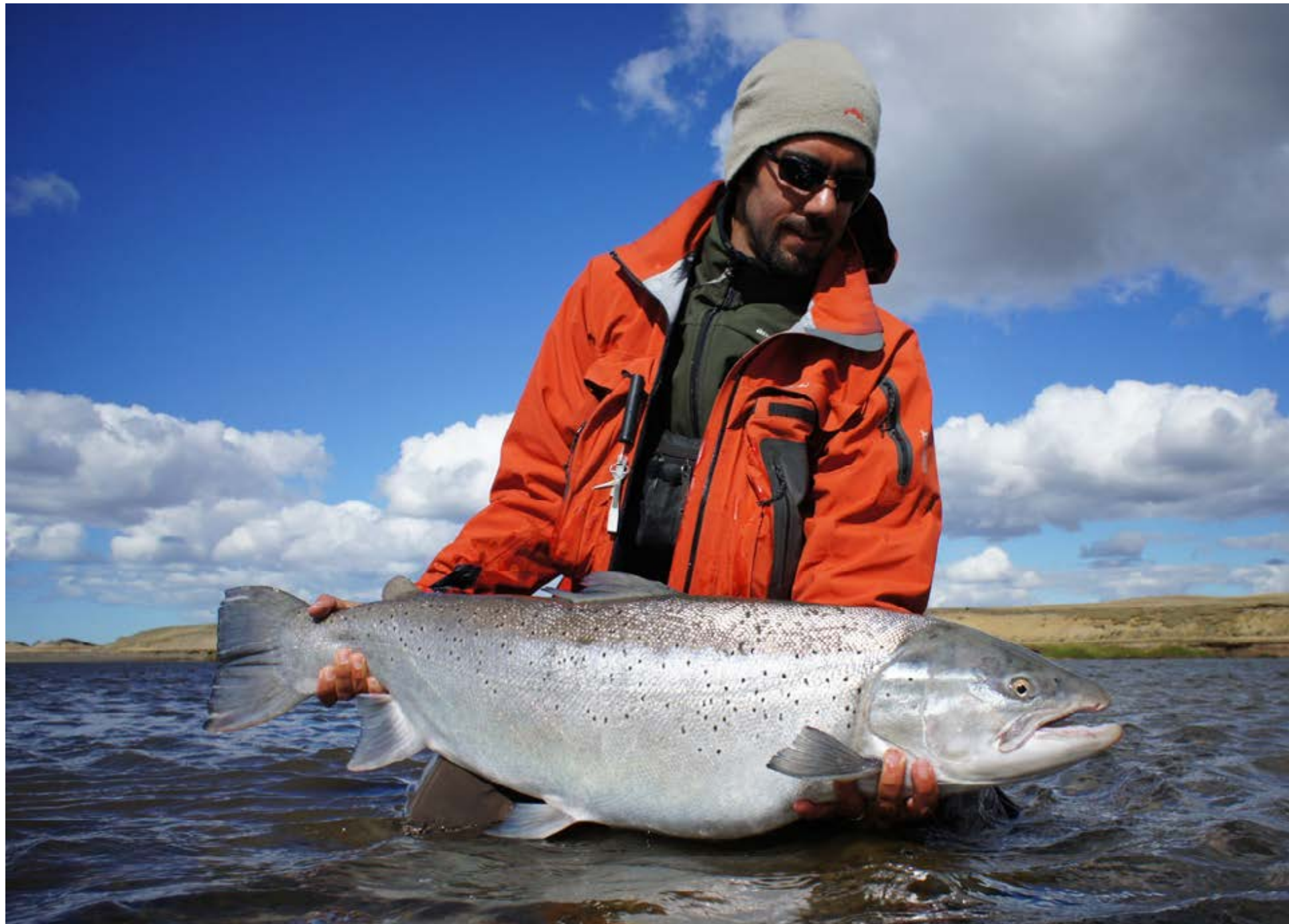
Villa María Lodge sits on the lower section of the Rio Grande, where powerful chrome sea trout enter the river system.