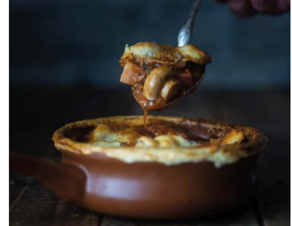
Pot Lamb Pie – Each dish is prepared with an artisan's touch and influenced by the earthiness of the surrounding landscape.