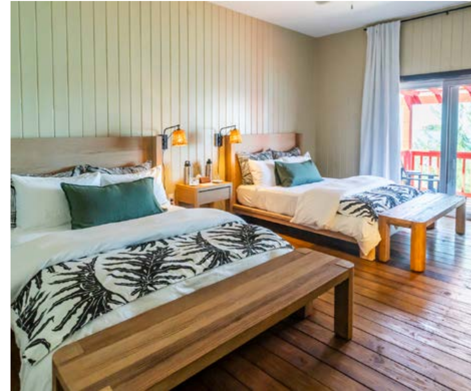
The lodge consists of 7 double rooms with 2 queen beds & 2 rooms with king size beds.

The lodge's main bar is stocked with spirits, cold beer, soft drinks, plenty of ice, and mixers for cocktails. We also have an on-site fly shop where you can purchase everything from flies, leaders and tippet, and lodge logo-wear.