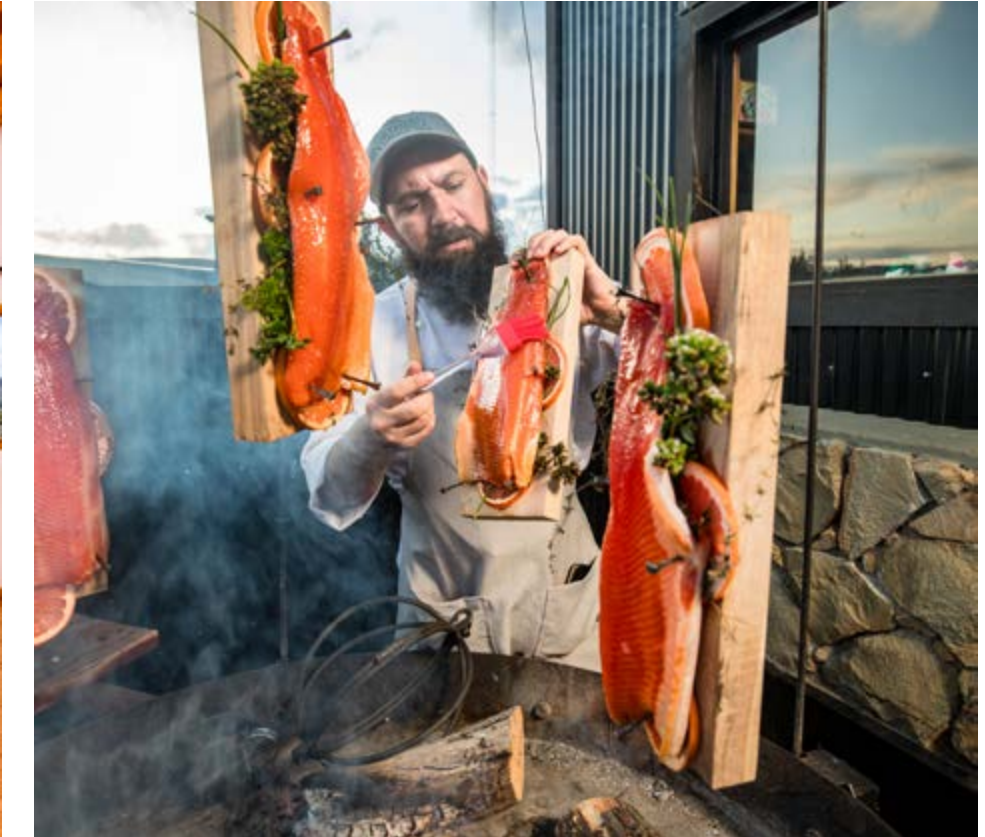
Wood roasted Patagonian trout hung over the fire.