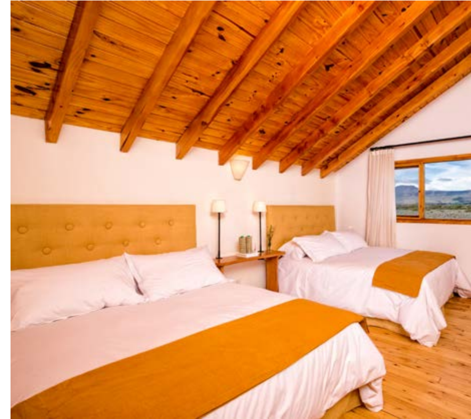
5 Double Rooms with 2 queen size beds.

Chime Lodge was constructed in 2008 and is located on the upper Chimehuín River. The beautifully, appointed lodge can accommodate 10 guests in six large bedrooms, each with a private bathroom. Each bedroom sleeps two anglers comfortably in single beds. The lodge also features two common living rooms, a reading/internet room, an open kitchen, and a large dining area where our guests enjoy delicious meals.