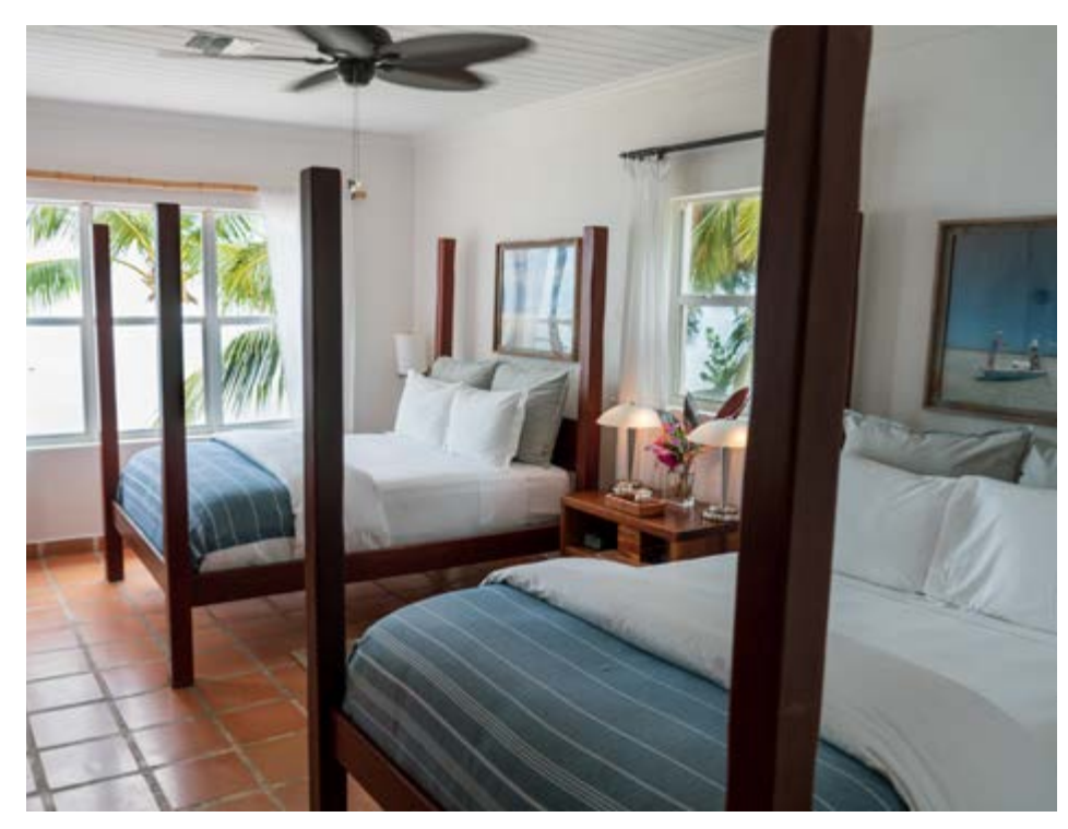
Bedrooms have terracotta tile flooring, white cotton sheets, as well as tropical-weight duvets, and plenty of down pillows.

Our unpretentious and air-conditioned living room and dining room areas have comfortable sofas, plenty of reading material and face the ocean. Here you will find your buffet breakfast laid out each morning. The lodge has a main bar fully stocked with spirits, cold beers, soft drinks, plenty of ice, a blender, and mixers for cocktails.