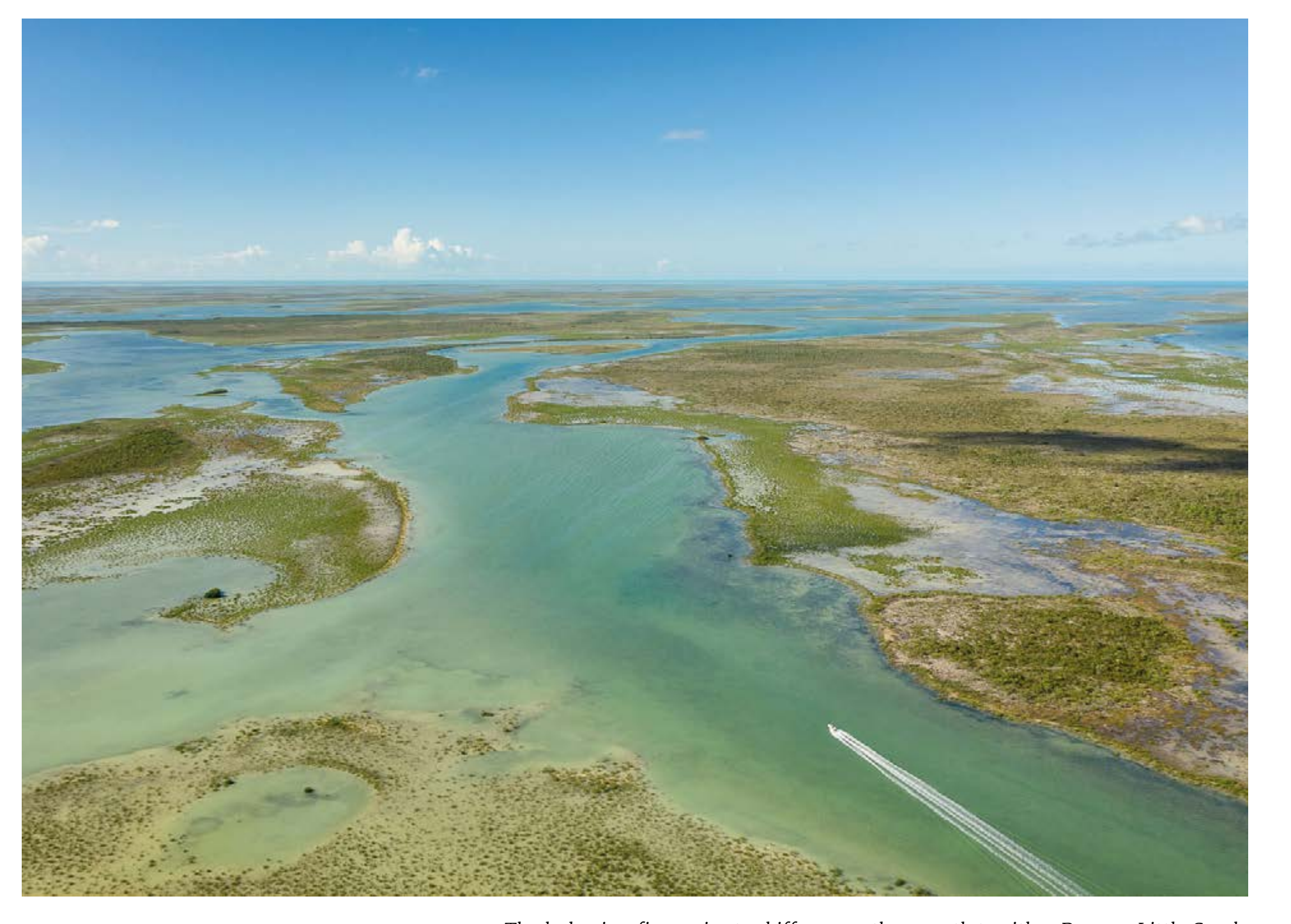
The lodge is a five-minute skiff run north or south to either Deep or Little Creek.