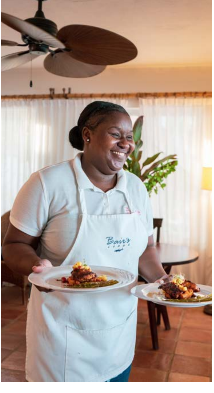
Our lodge has come to represent the benchmark in terms of quality guiding, delicious food, comfortable accommodations, and courteous hospitality.