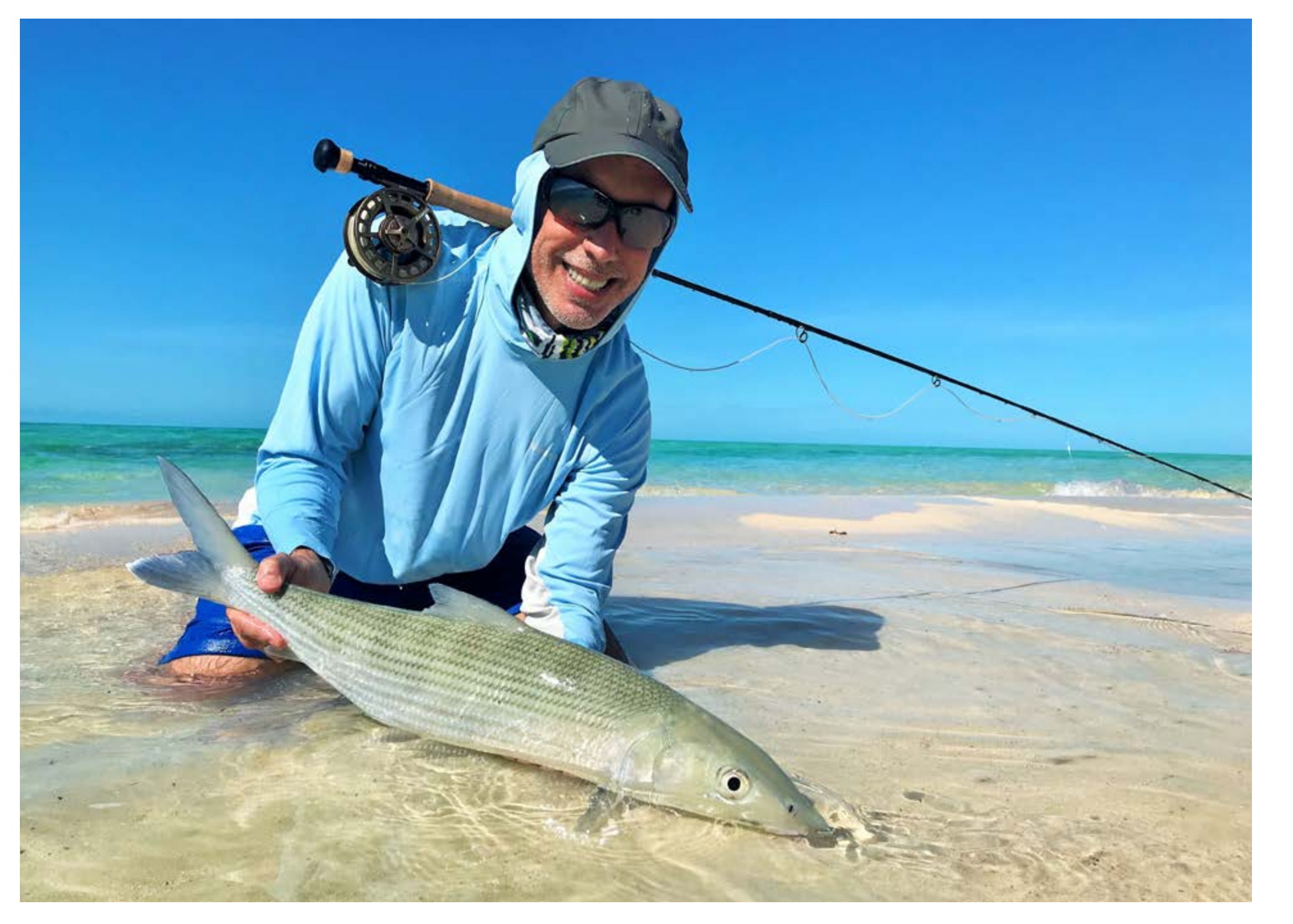
Immerse yourself in the pristine beauty of the Bahamas' southern white sand flats, where trophy-sized bonefish thrive.