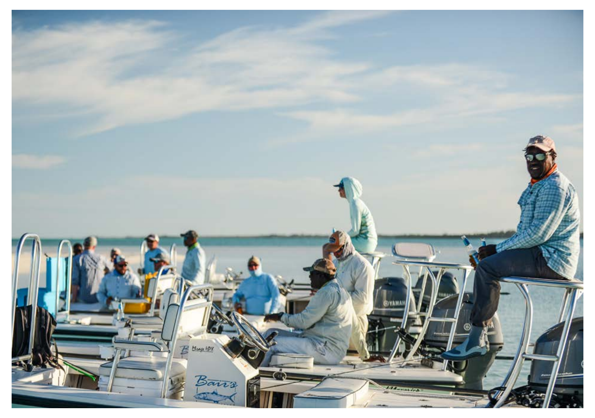
Our veteran guiding staff is one of the best in the Bahamas –professional and personable they can put you on the fish and help you iron your double haul.