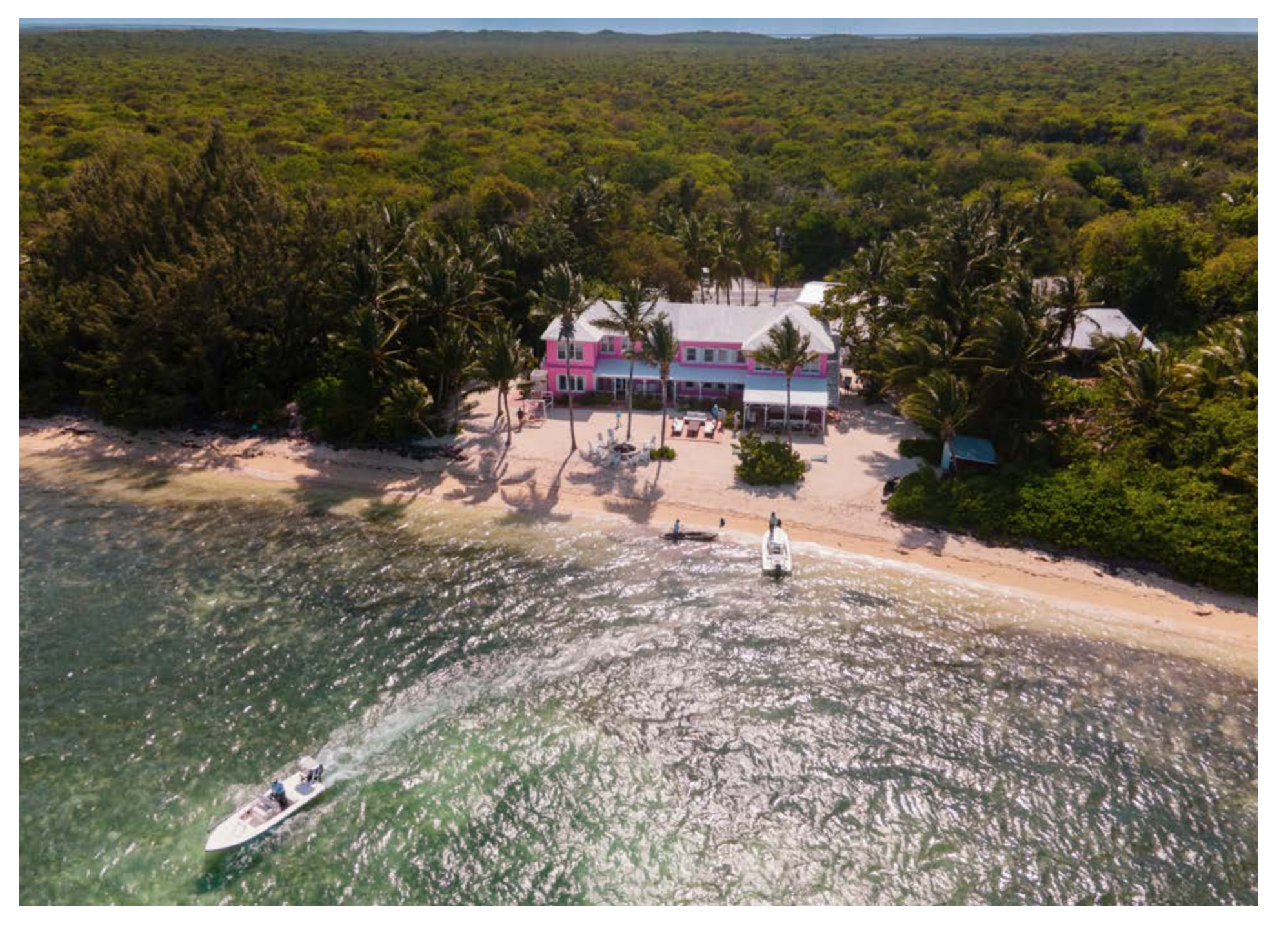
Bairs' Lodge is ideally located in front of the ocean, removing the need for trailering.