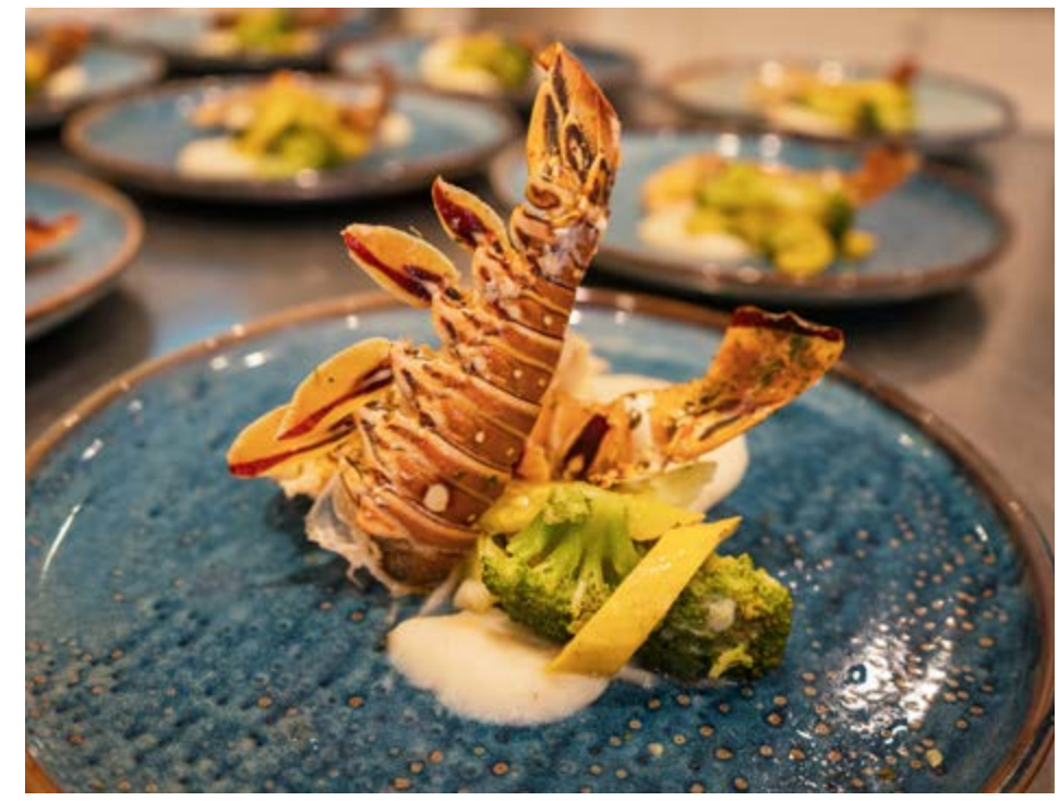
Roasted Crawfish. Food in the Bahamas is a magical encounter between the sea treasures, history, culture & its people.

concentrating on magnificent fresh seafood.