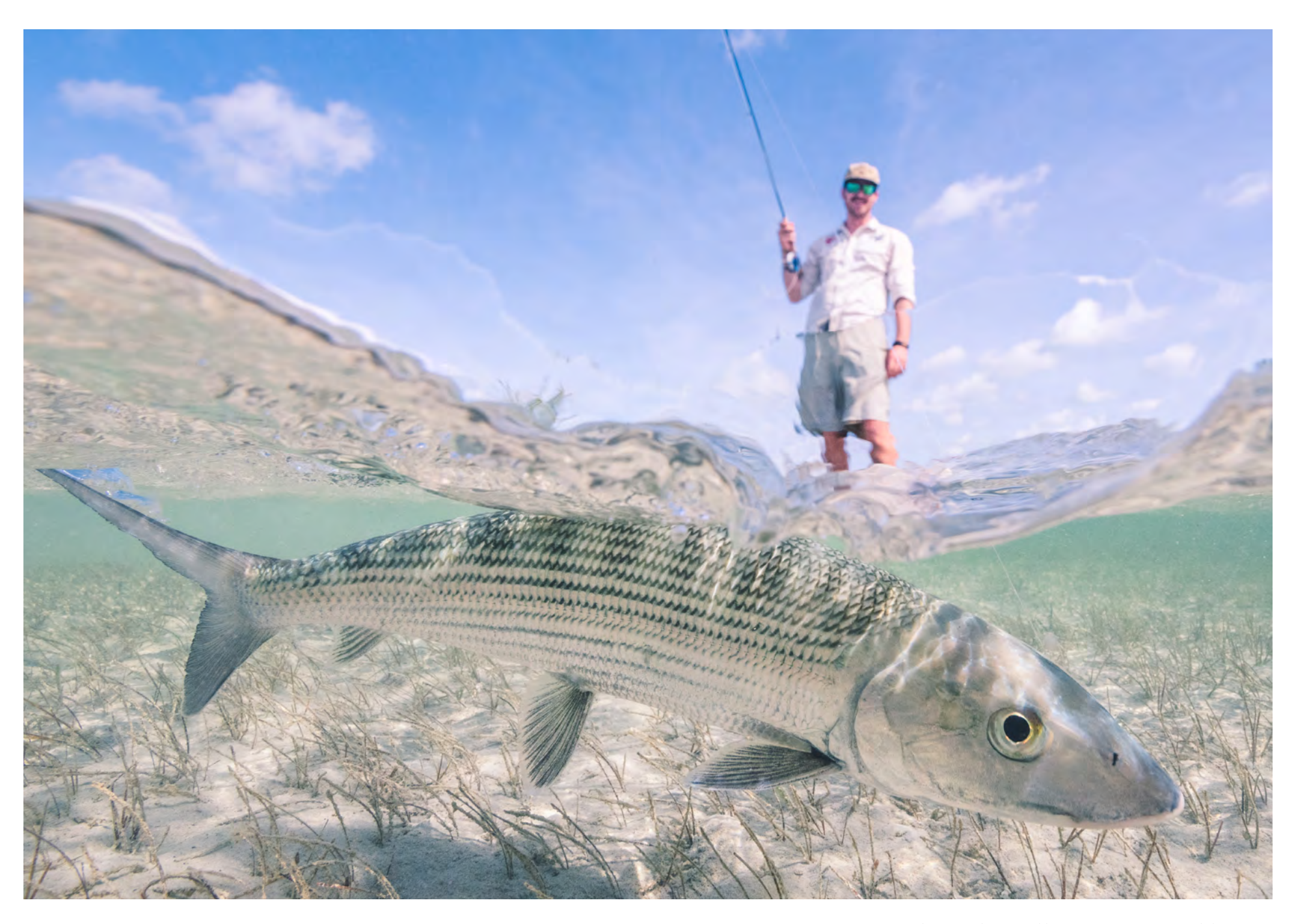
Abaco is home to unrivaled numbers of bonefish, offering a haven of fishing opportunities in an expansive, unpressured flats system