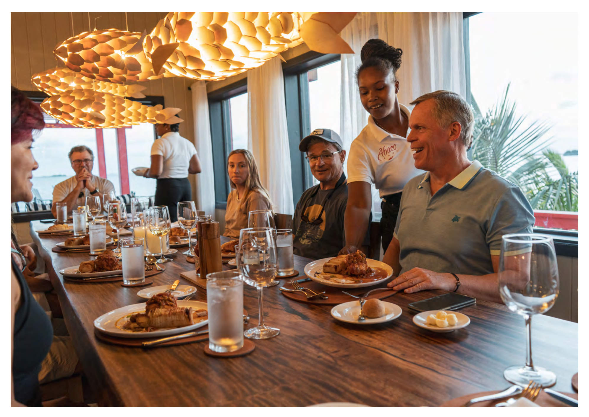
Our lodge has come to represent the benchmark in terms of quality guiding, delicious food, comfortable accommodations, and courteous hospitality.