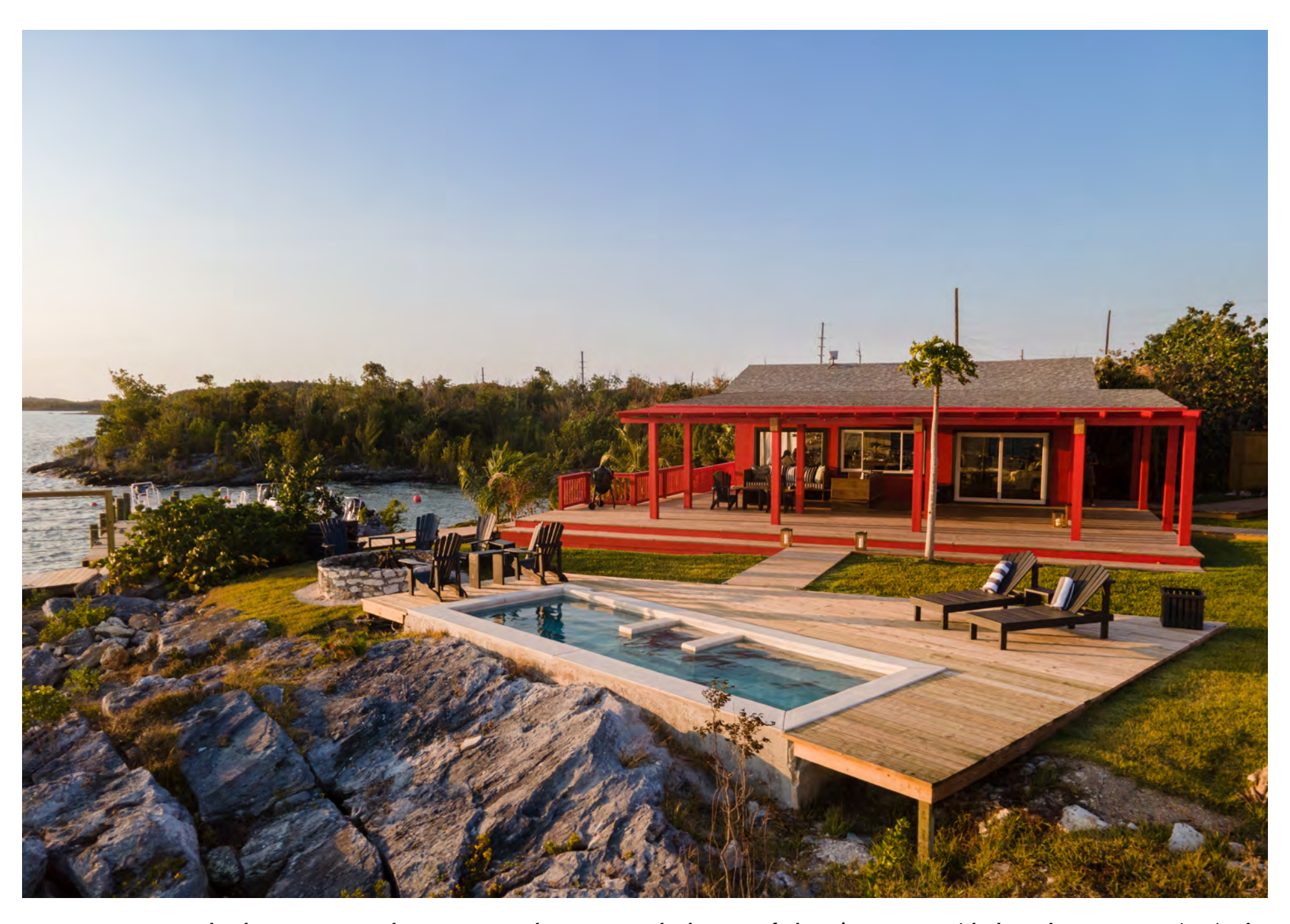
As the day comes to a close, guests gather to savor the beauty of Abaco's sunsets. With the palm trees swaying in the gentle breeze and the warm colors of the sky reflecting on the tranquil waters, it's a moment of pure bliss.