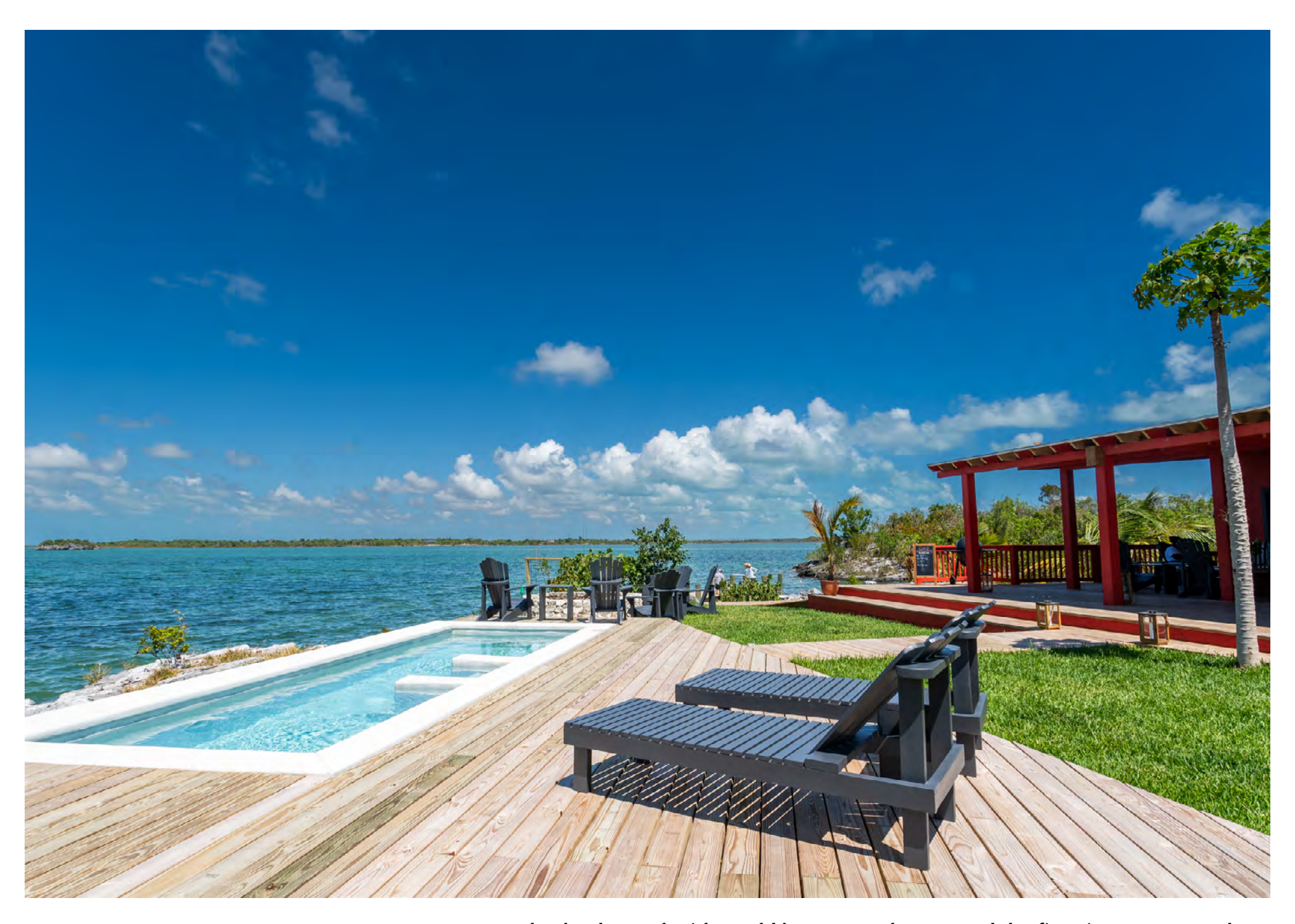
Relax by the pool with a cold beer, or gather around the fire pit at sunset to share your day's fishing stories and become a part of the island's lore.