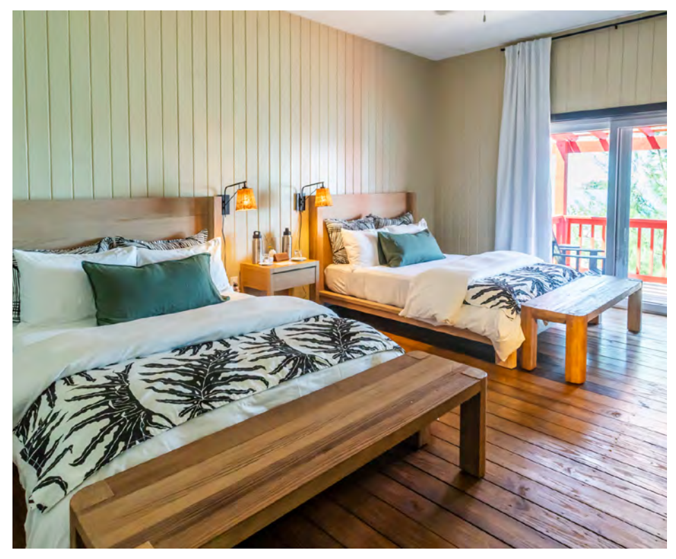
The lodge consists of 7 double rooms with 2 queen beds & 2 rooms with king size beds.