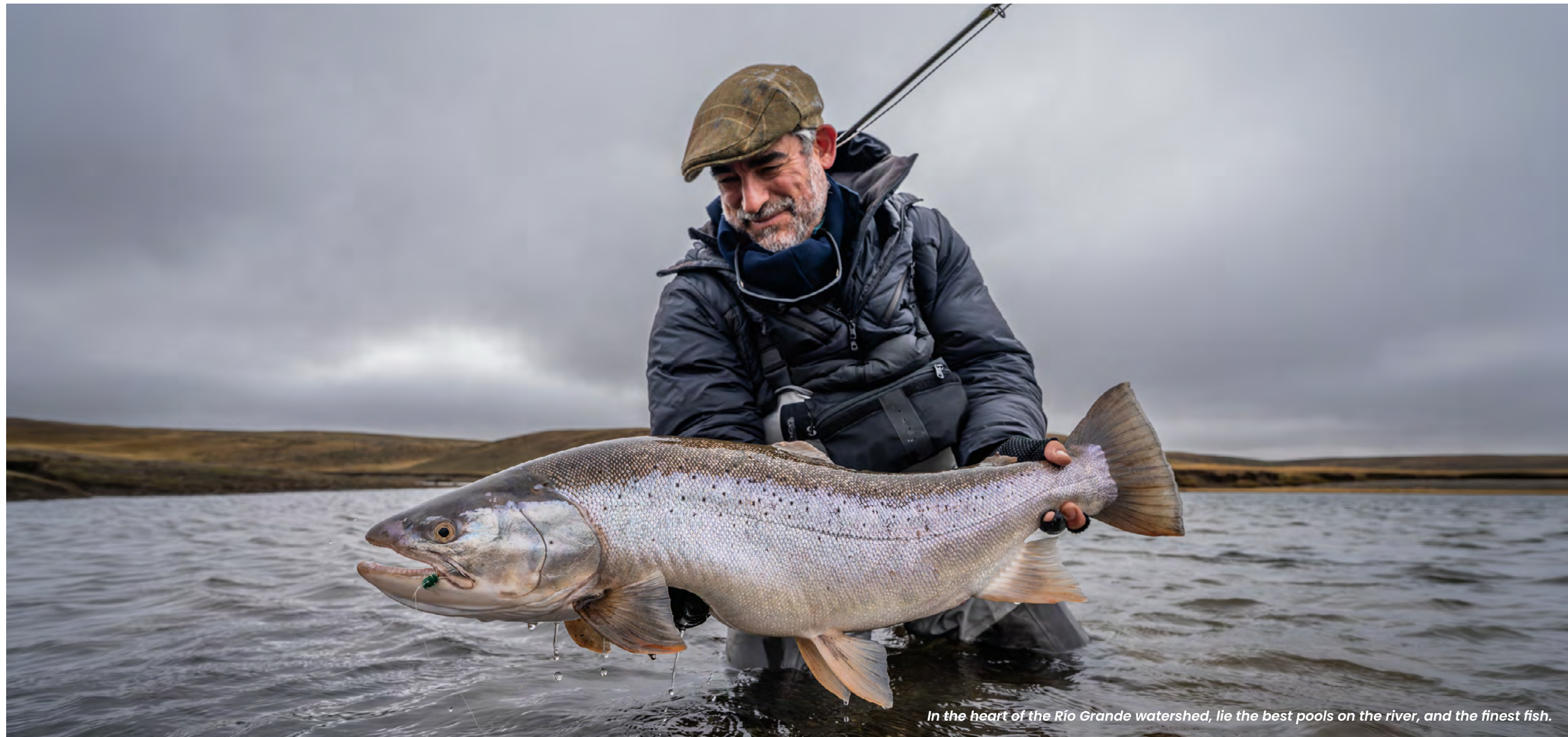
In the heart of the Río Grande watershed, lie the best pools on the river, and the finest fish.

In this ever-changing environment, every cast feels alive with possibility. It's a fishery that challenges and rewards in equal measure—where one perfect drift can deliver the trout of a lifetime.