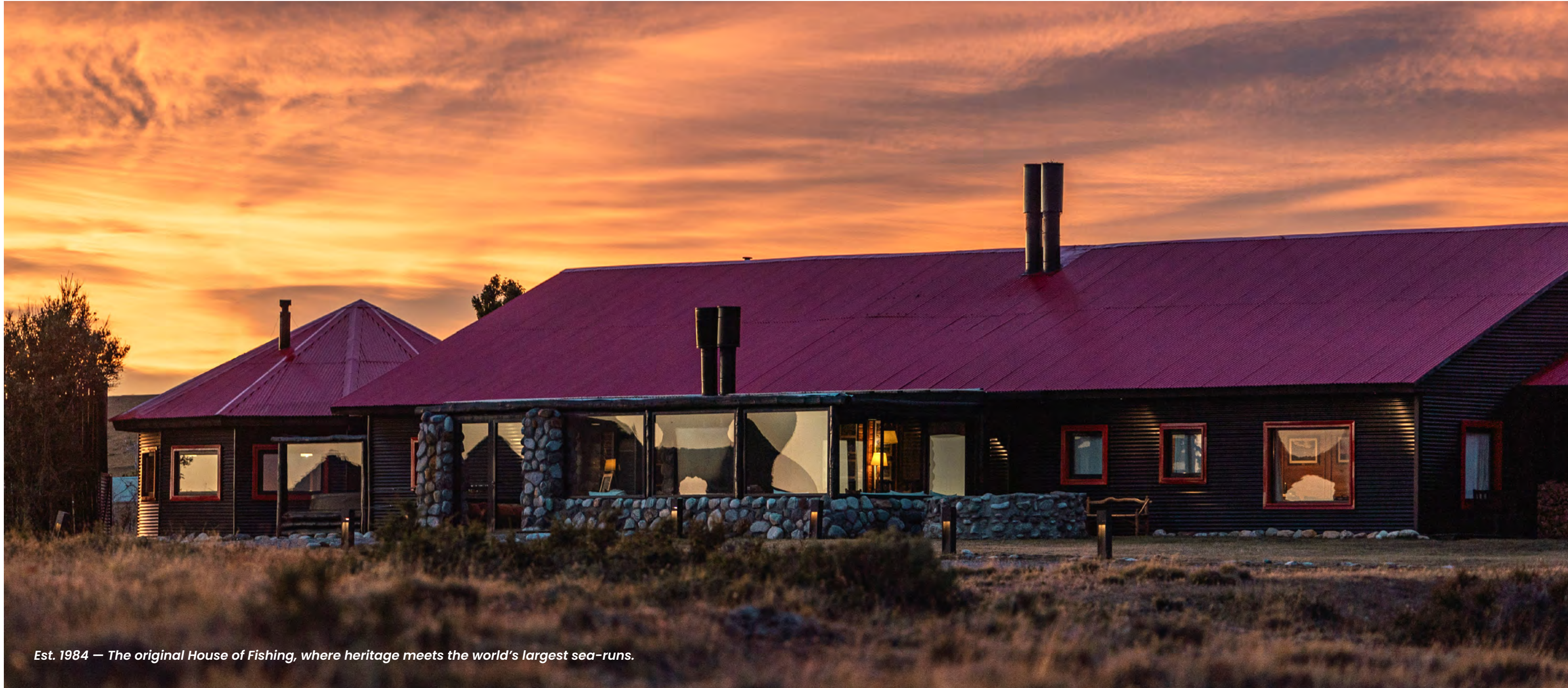
Est. 1984 — The original House of Fishing, where heritage meets the world's largest sea-runs.