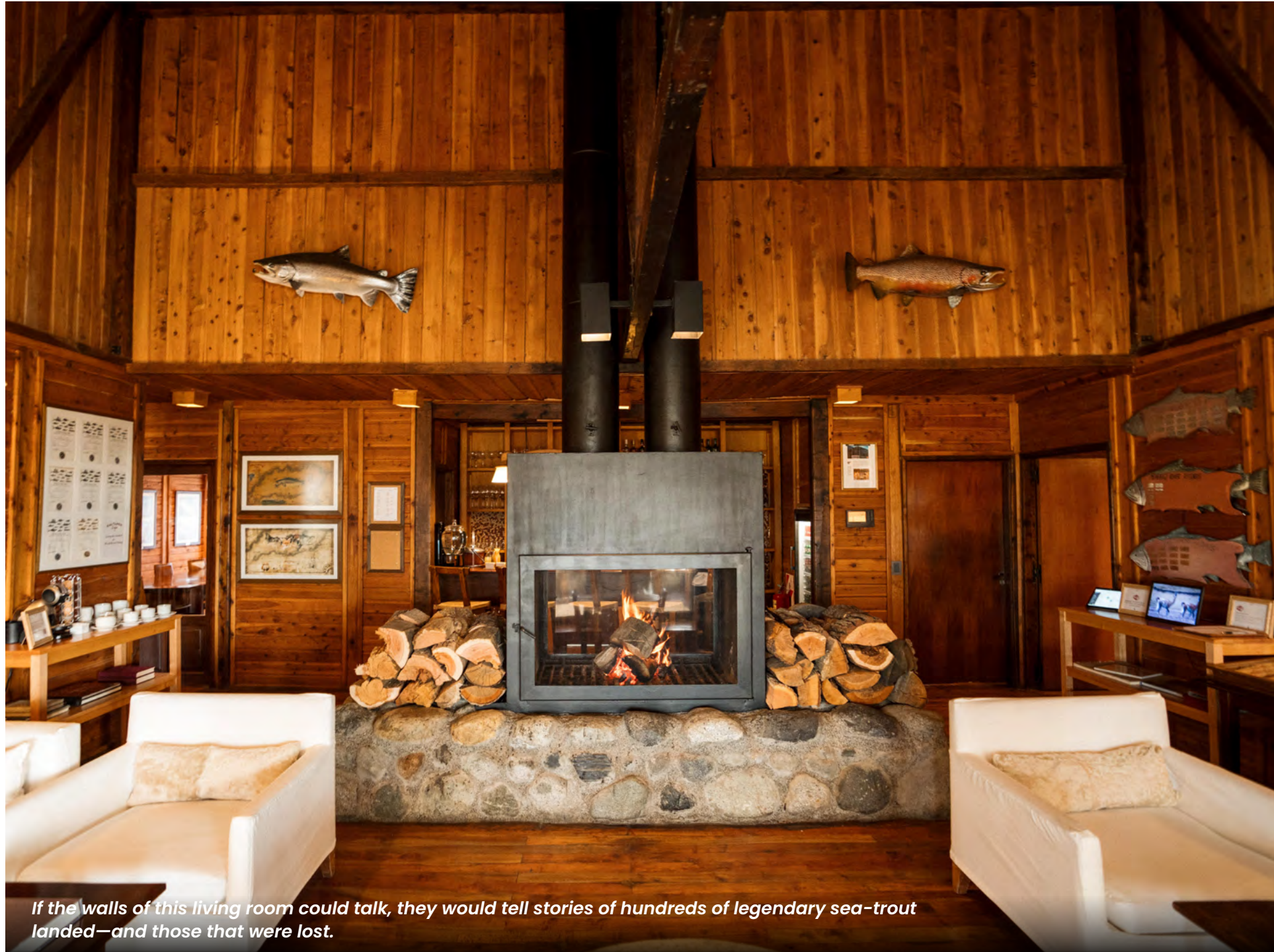
If the walls of this living room could talk, they would tell stories of hundreds of legendary sea-trout landed—and those that were lost.