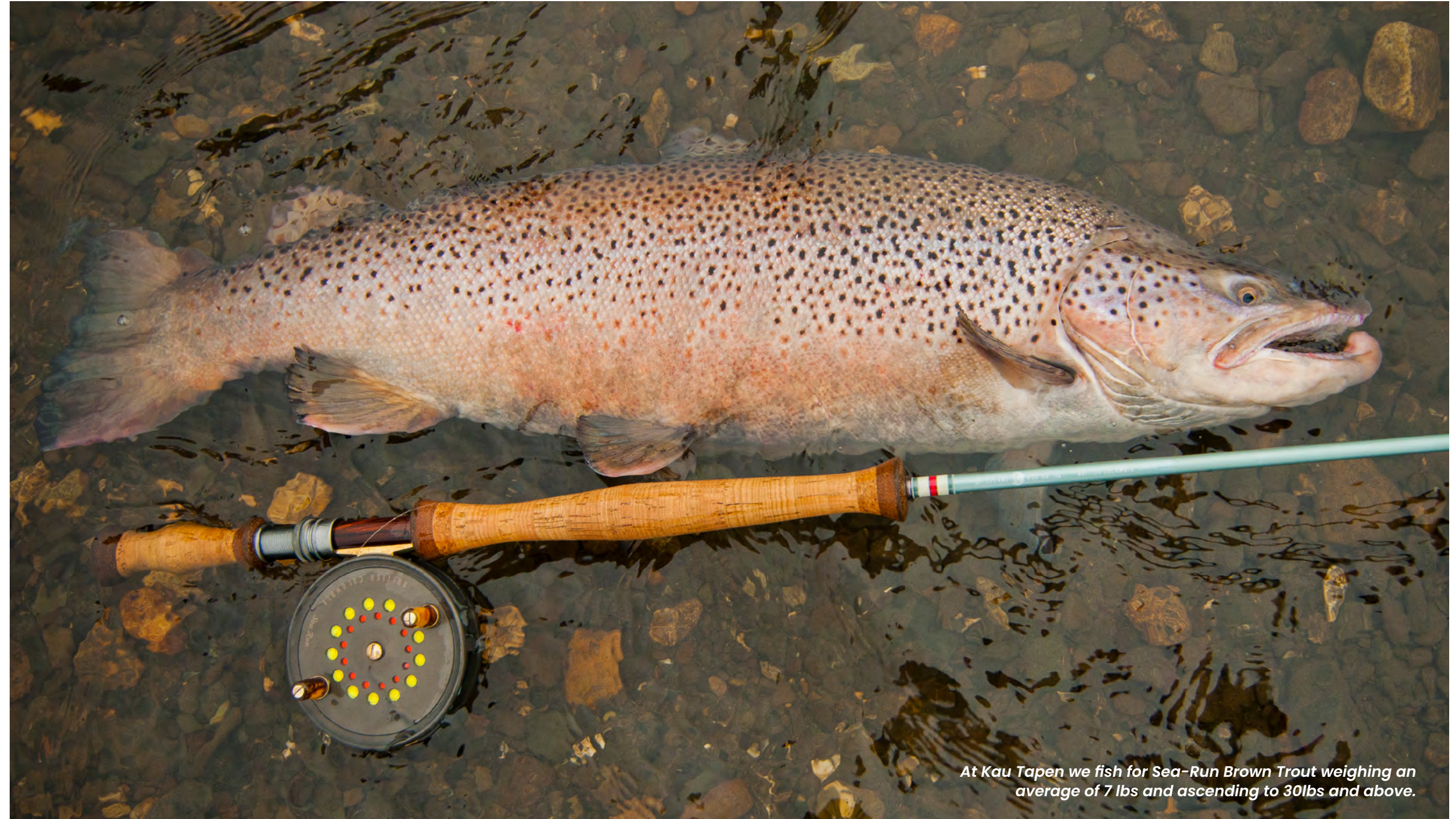
At Kau Tapen we fish for Sea-Run Brown Trout weighing an average of 7 lbs and ascending to 30lbs and above.