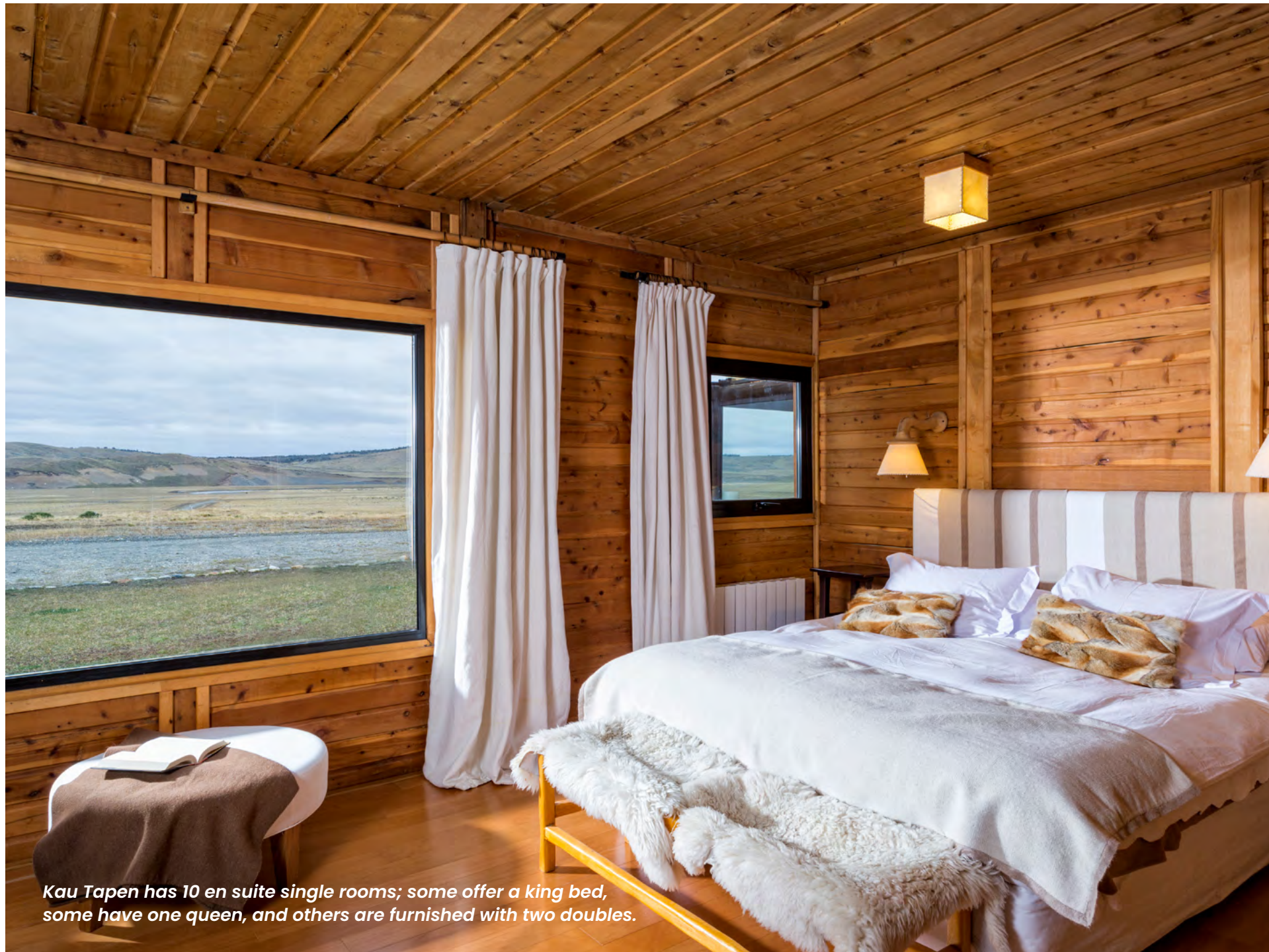
Kau Tapen has 10 en suite single rooms; some offer a king bed, some have one queen, and others are furnished with two doubles.