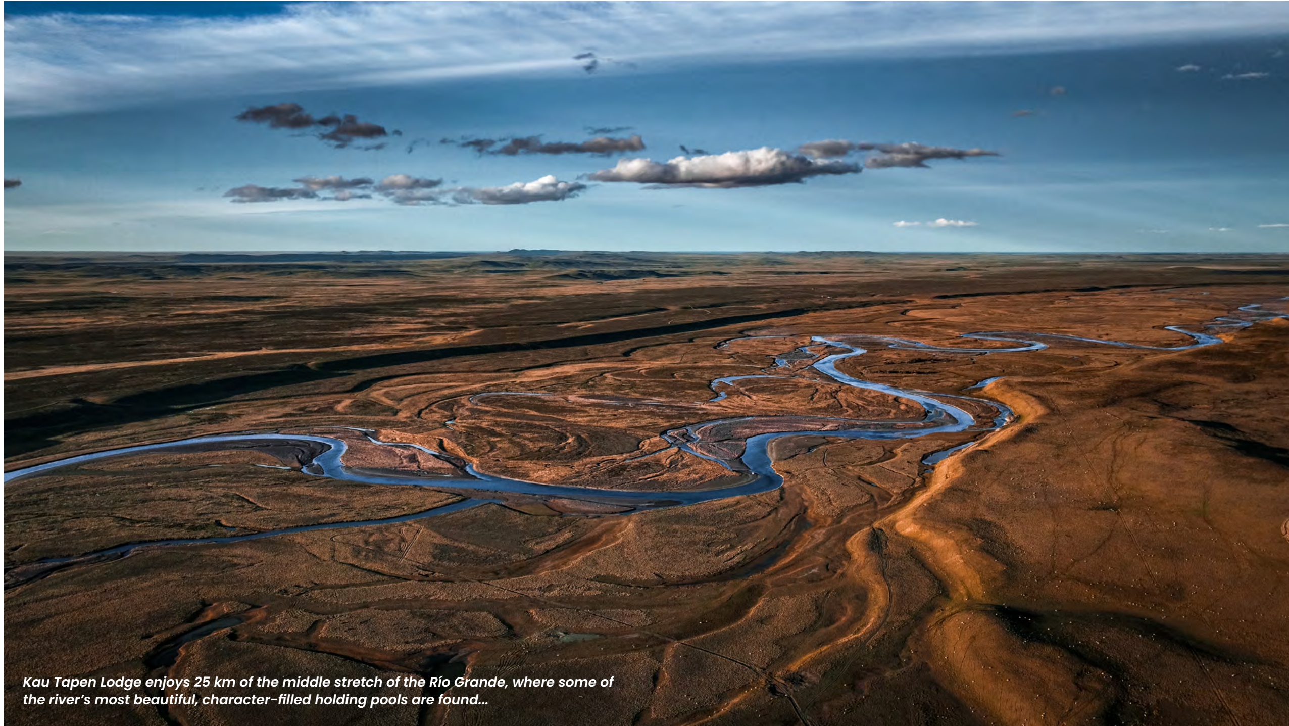
Kau Tapen Lodge enjoys 25 km of the middle stretch of the Río Grande, where some of the river's most beautiful, character-filled holding pools are found...