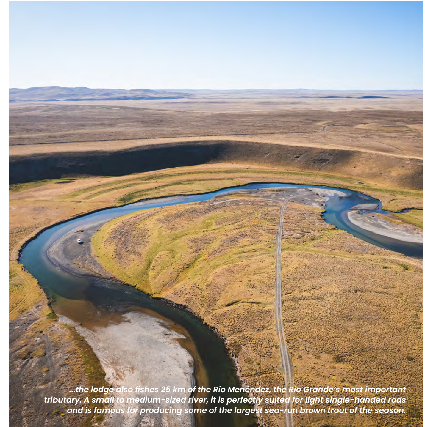
...the lodge also fishes 25 km of the Río Menéndez, the Río Grande's most important tributary. A small to medium-sized river, it is perfectly suited for light single-handed rods and is famous for producing some of the largest sea-run brown trout of the season.