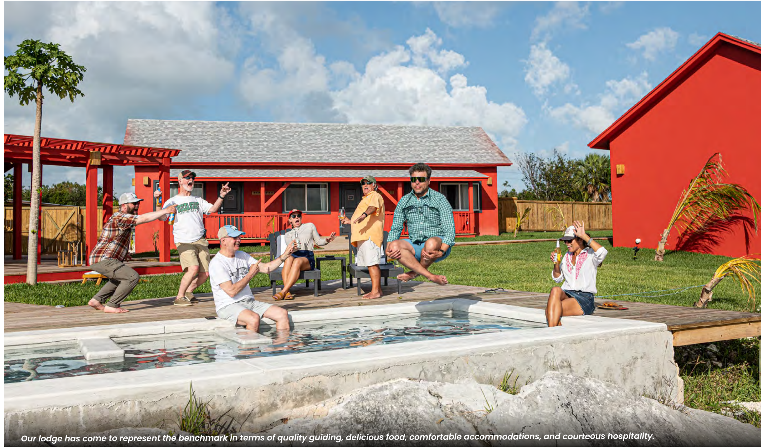
Our lodge has come to represent the benchmark in terms of quality guiding, delicious food, comfortable accommodations, and courteous hospitality.