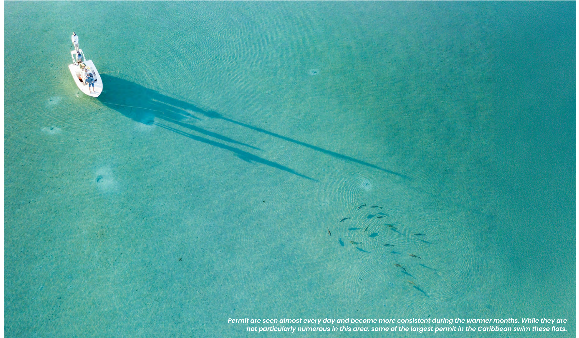
Permit are seen almost every day and become more consistent during the warmer months. While they are not particularly numerous in this area, some of the largest permit in the Caribbean swim these flats.