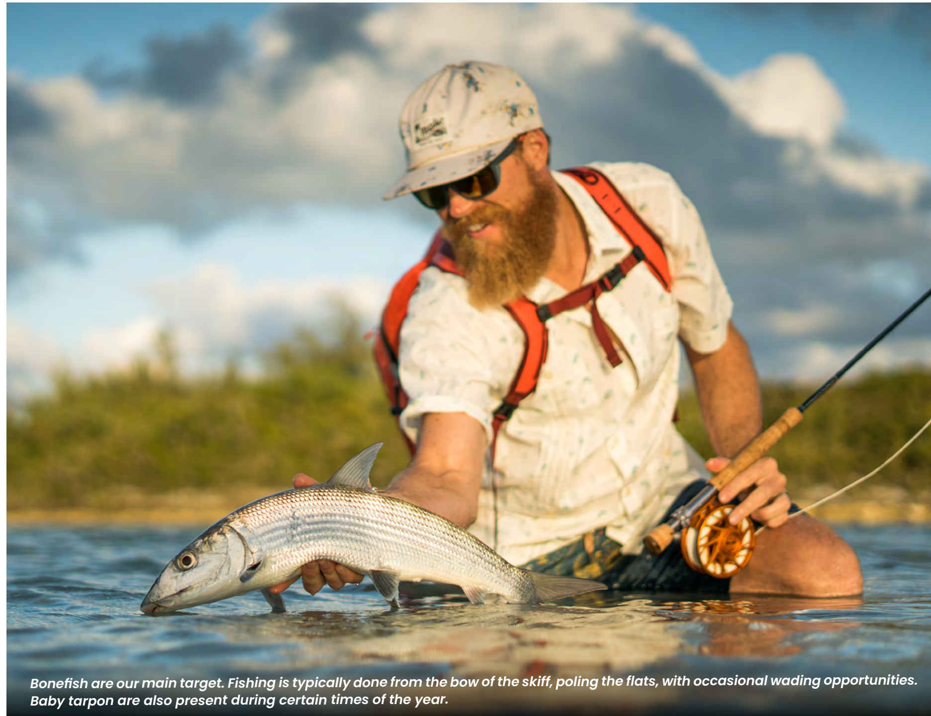
Bonefish are our main target. Fishing is typically done from the bow of the skiff, poling the flats, with occasional wading opportunities. Baby tarpon are also present during certain times of the year.