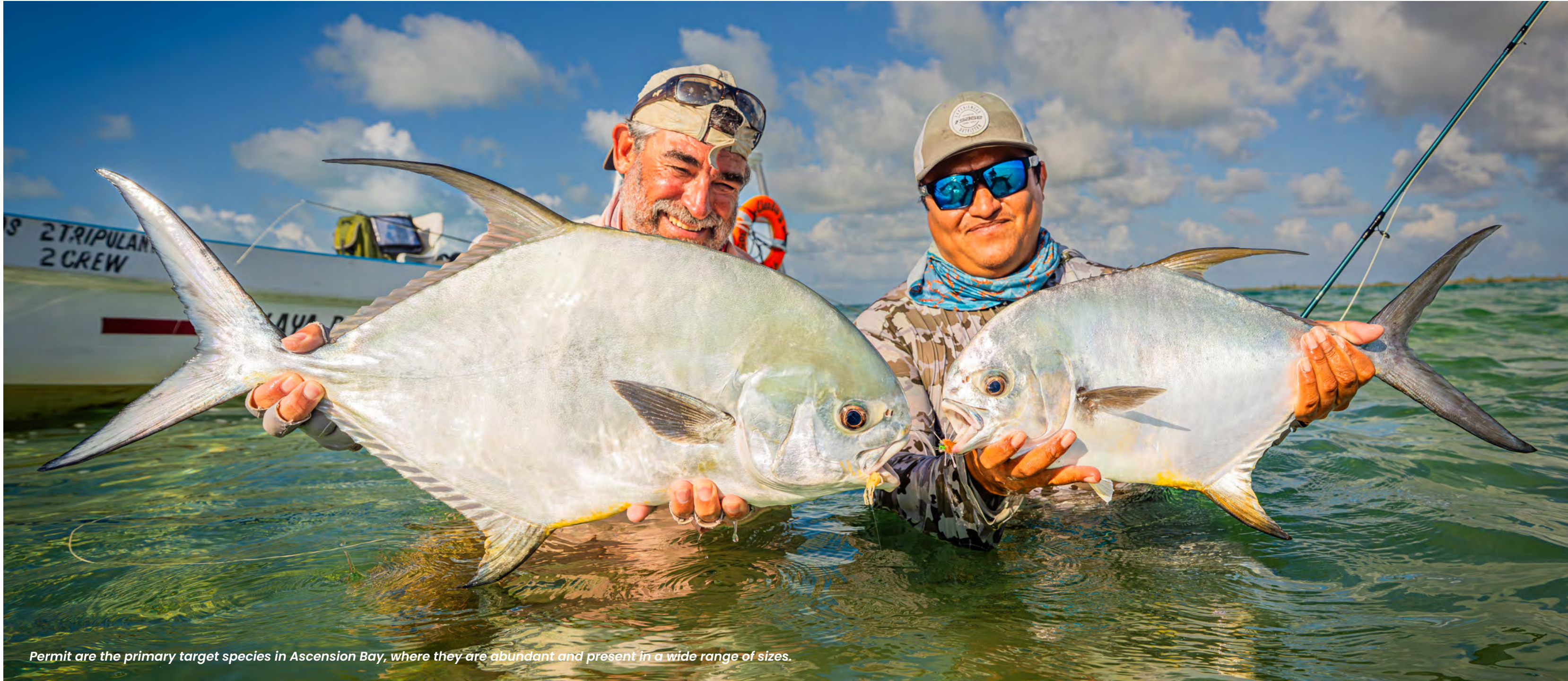
Permit are the primary target species in Ascension Bay, where they are abundant and present in a wide range of sizes.