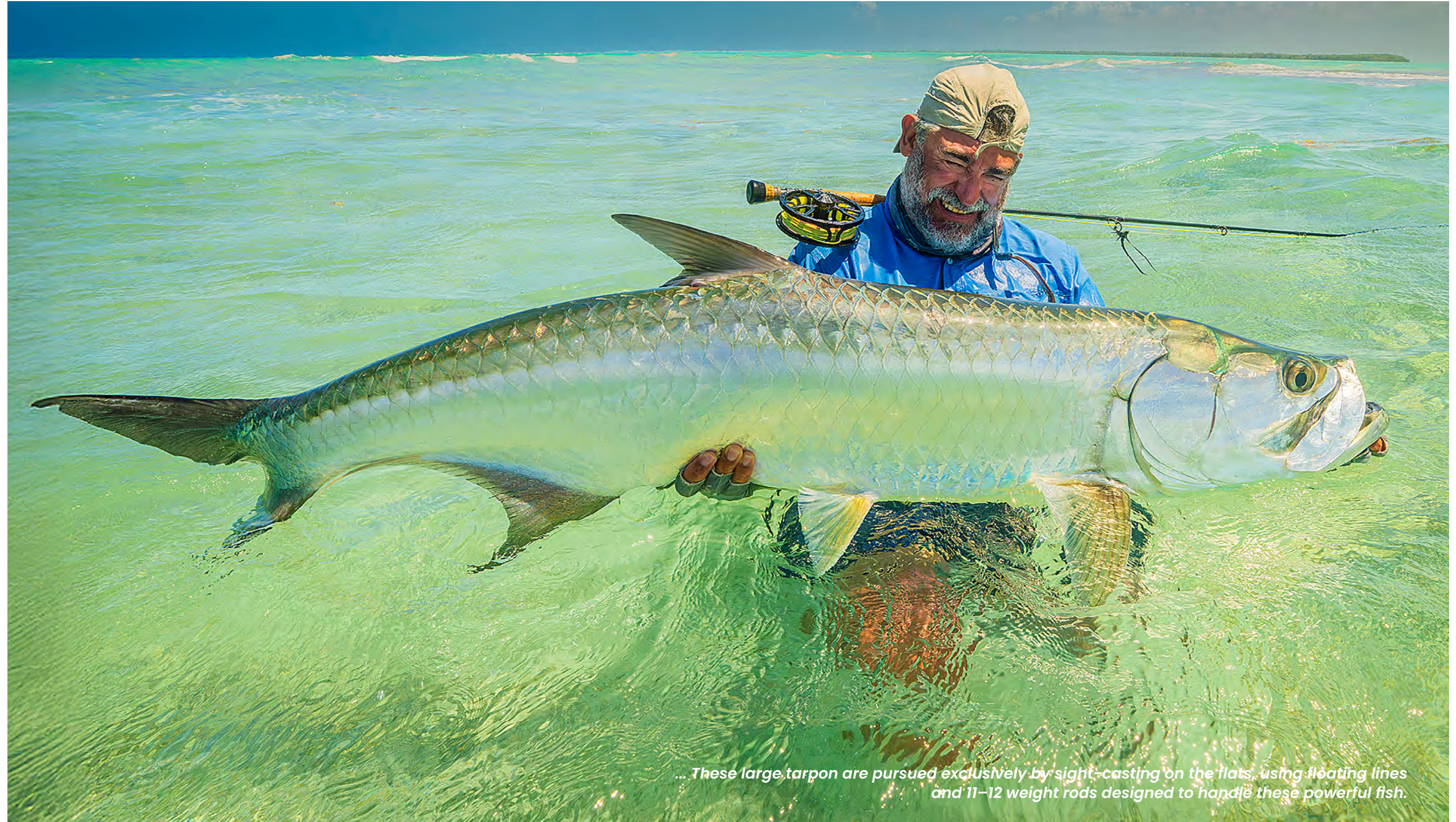
... These large tarpon are pursued exclusively by sight-casting on the flats, using floating lines and 11-12 weight rods designed to handle these powerful fish.

While the big four flats species are often at the top of saltwater fly fisherman's list, Ascension Bay is home to many other species of sport fish such as triggerfish, jack crevalle, and barracuda, as well as many types of snappers and groupers. If anglers come with an open mind, they are sure to catch many species on the fly at Mayazul.