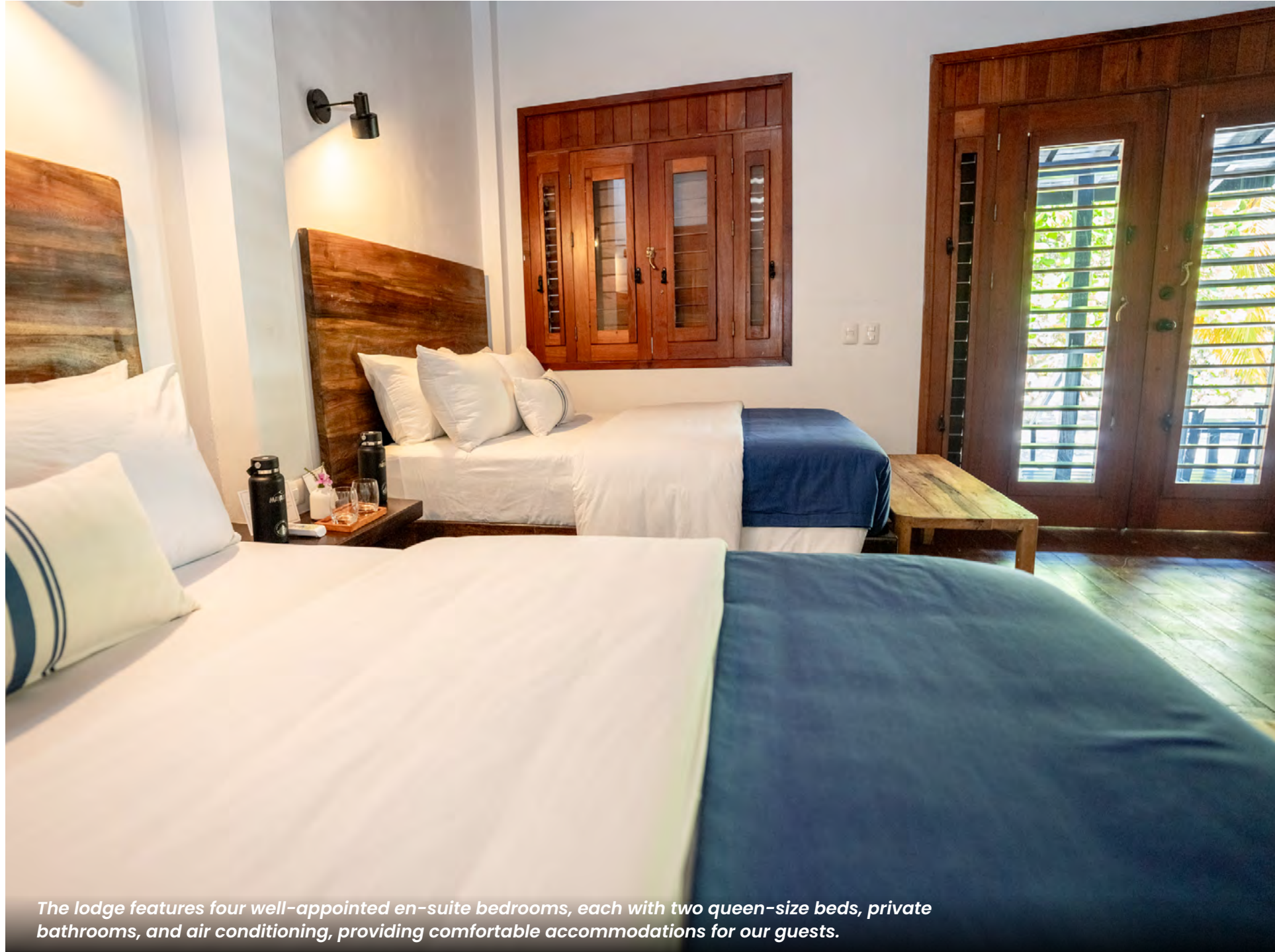
The lodge features four well-appointed en-suite bedrooms, each with two queen-size beds, private bathrooms, and air conditioning, providing comfortable accommodations for our guests.