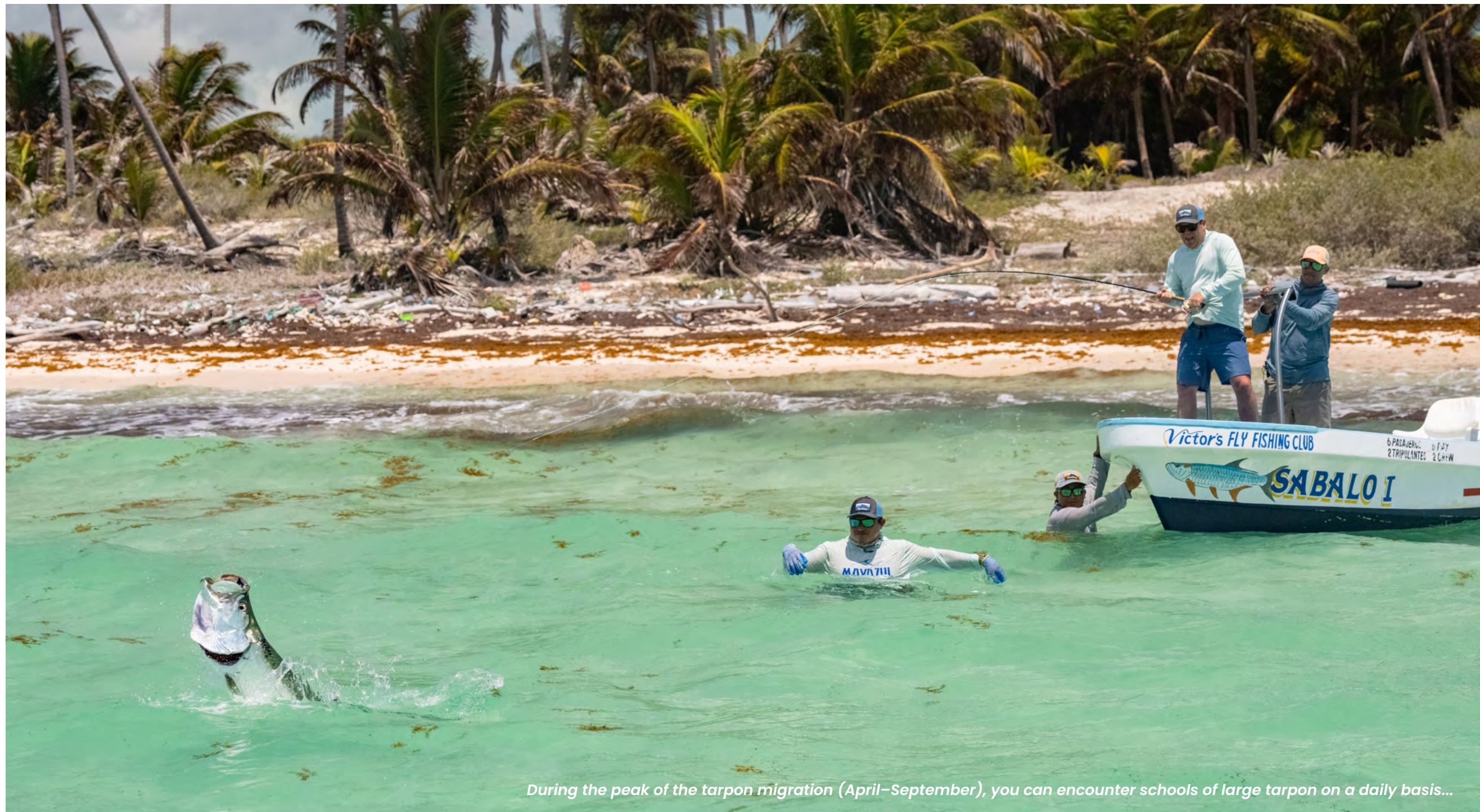
During the peak of the tarpon migration (April-September), you can encounter schools of large tarpon on a daily basis...

For a long time, the permit was only pursued by certain specialists. There was not much information about permit fishing, and there were even fewer dedicated guides. Successfully pursuing and catching a permit therefore seemed unattainable for the majority of anglers. Nowadays, the angling world has poured resources and created the demand for an increased understanding of these special fish. We now know more about their behavior and habits than ever before, and every day there are more guides who have dedicated their lives to stalking and learning about permit. Specialized equipment and flies have been designed with the sole purpose of maximizing permit fishing odds. Our promise at Mayazul is to bring all these years of development into your hands and at your disposal when you arrive at the lodge.