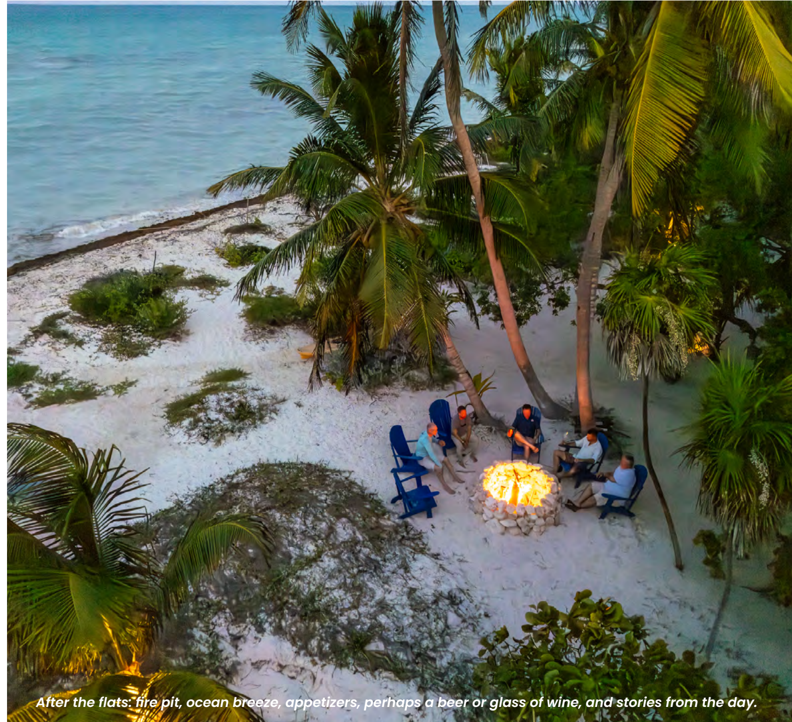
After the flats: fire pit, ocean breeze, appetizers, perhaps a beer or glass of wine, and stories from the day.