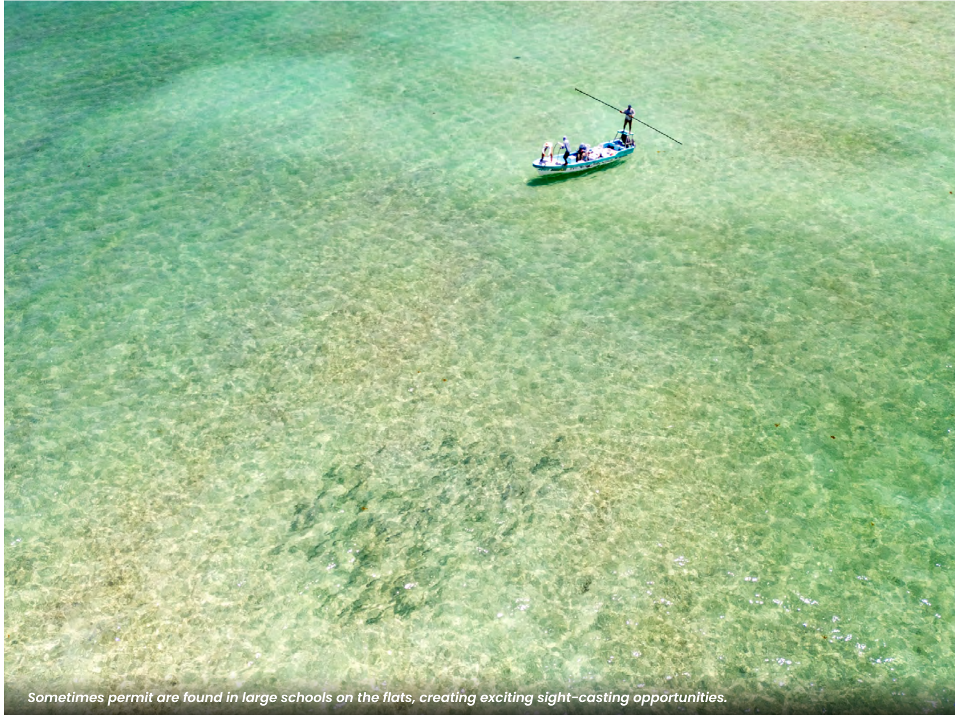
Sometimes permit are found in large schools on the flats, creating exciting sight-casting opportunities.