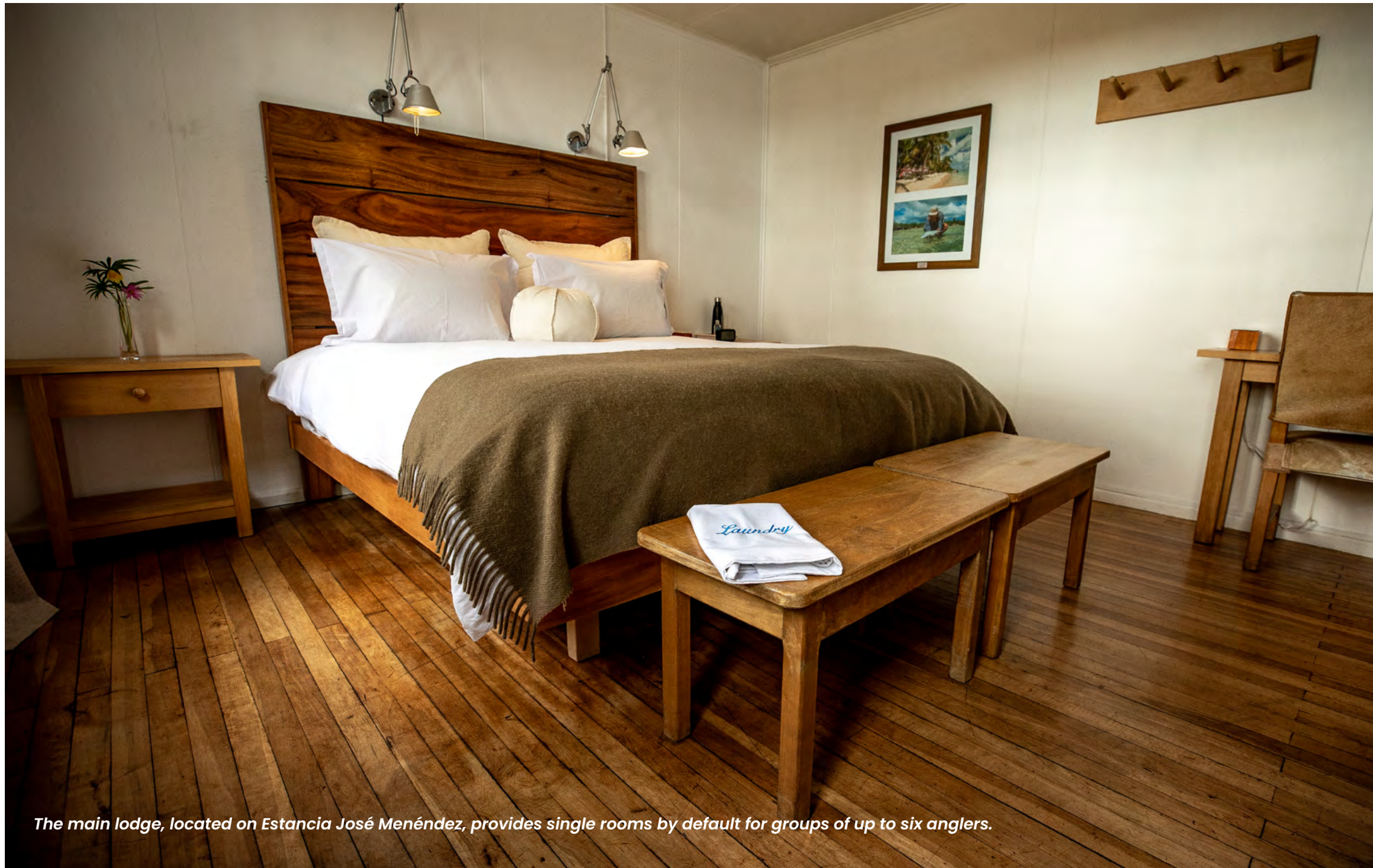
The main lodge, located on Estancia José Menéndez, provides single rooms by default for groups of up to six anglers.