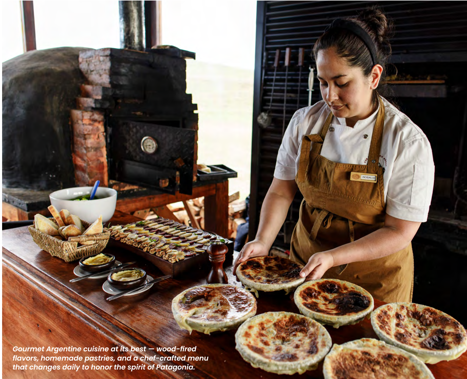
Gourmet Argentine cuisine at its best — wood-fired flavors, homemade pastries, and a chef-crafted menu that changes daily to honor the spirit of Patagonia.