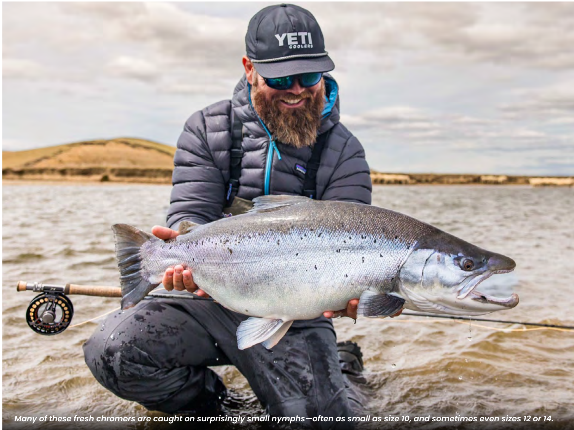
Many of these fresh chromers are caught on surprisingly small nymphs—often as small as size 10, and sometimes even sizes 12 or 14.