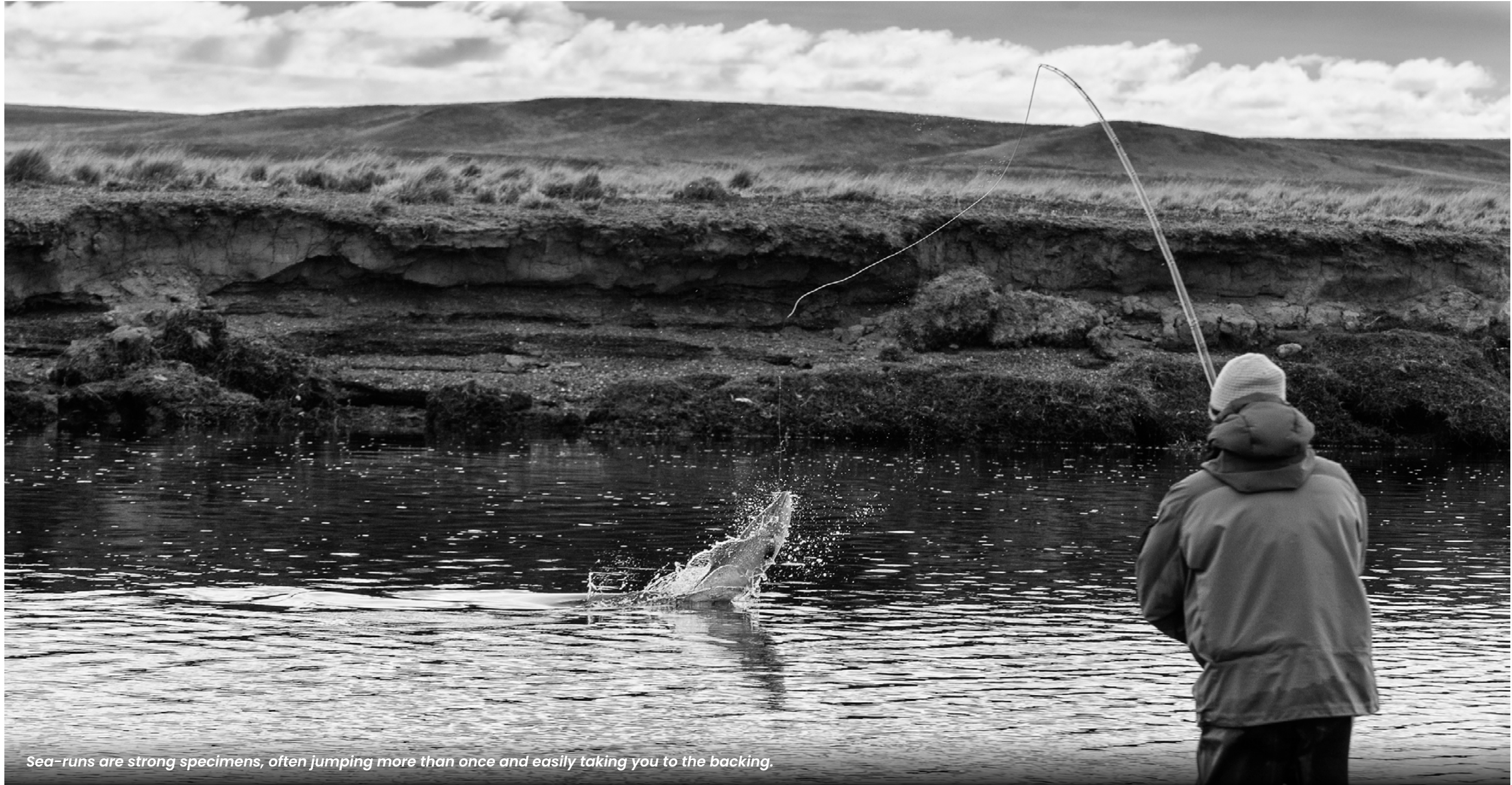
Sea-runs are strong specimens, often jumping more than once and easily taking you to the backing.