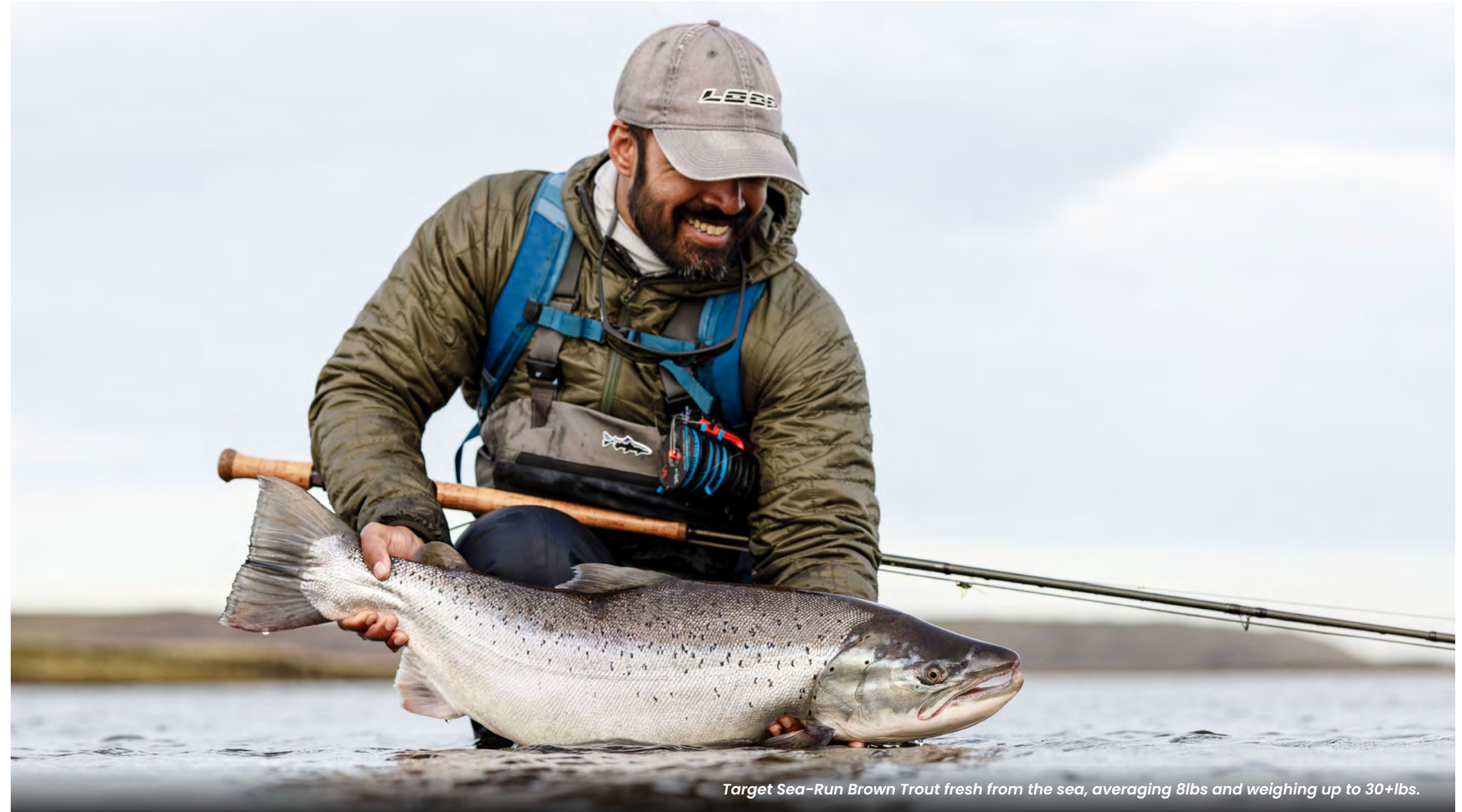
Target Sea-Run Brown Trout fresh from the sea, averaging 8lbs and weighing up to 30+lbs.

Villa María is a 100% catch-and-release fishery. Guides are equipped with landing nets and trained to assist with safe handling, weighing, and releasing of all fish to ensure their continued health and longevity in the river.