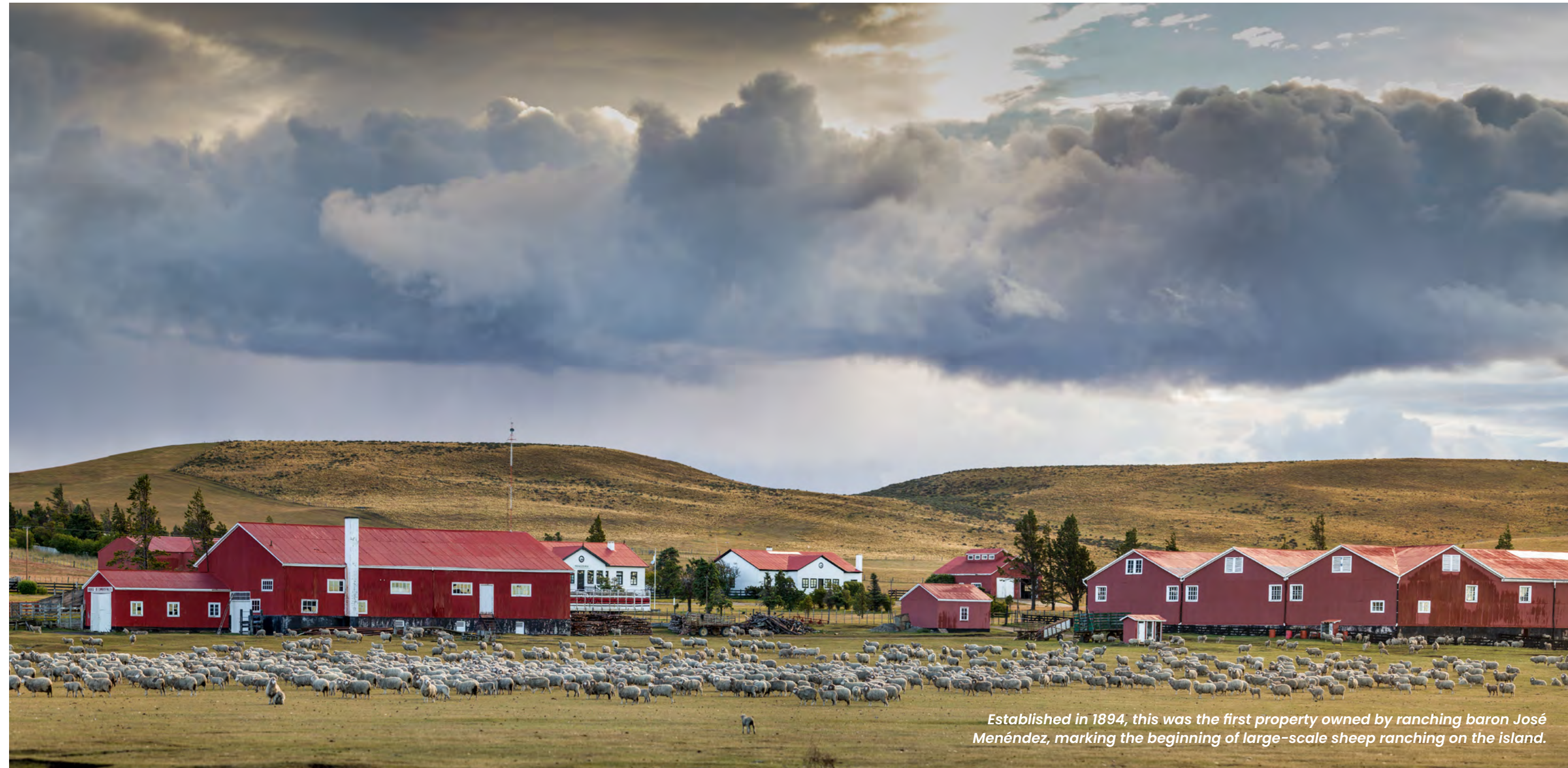
Established in 1894, this was the first property owned by ranching baron José Menéndez, marking the beginning of large-scale sheep ranching on the island.

The building that now houses Villa María Lodge was once the ranch manager's family home. It has been carefully restored and transformed into a modern fishing lodge, preserving its classic character while offering the comfort and warmth expected of a world-class sporting destination.