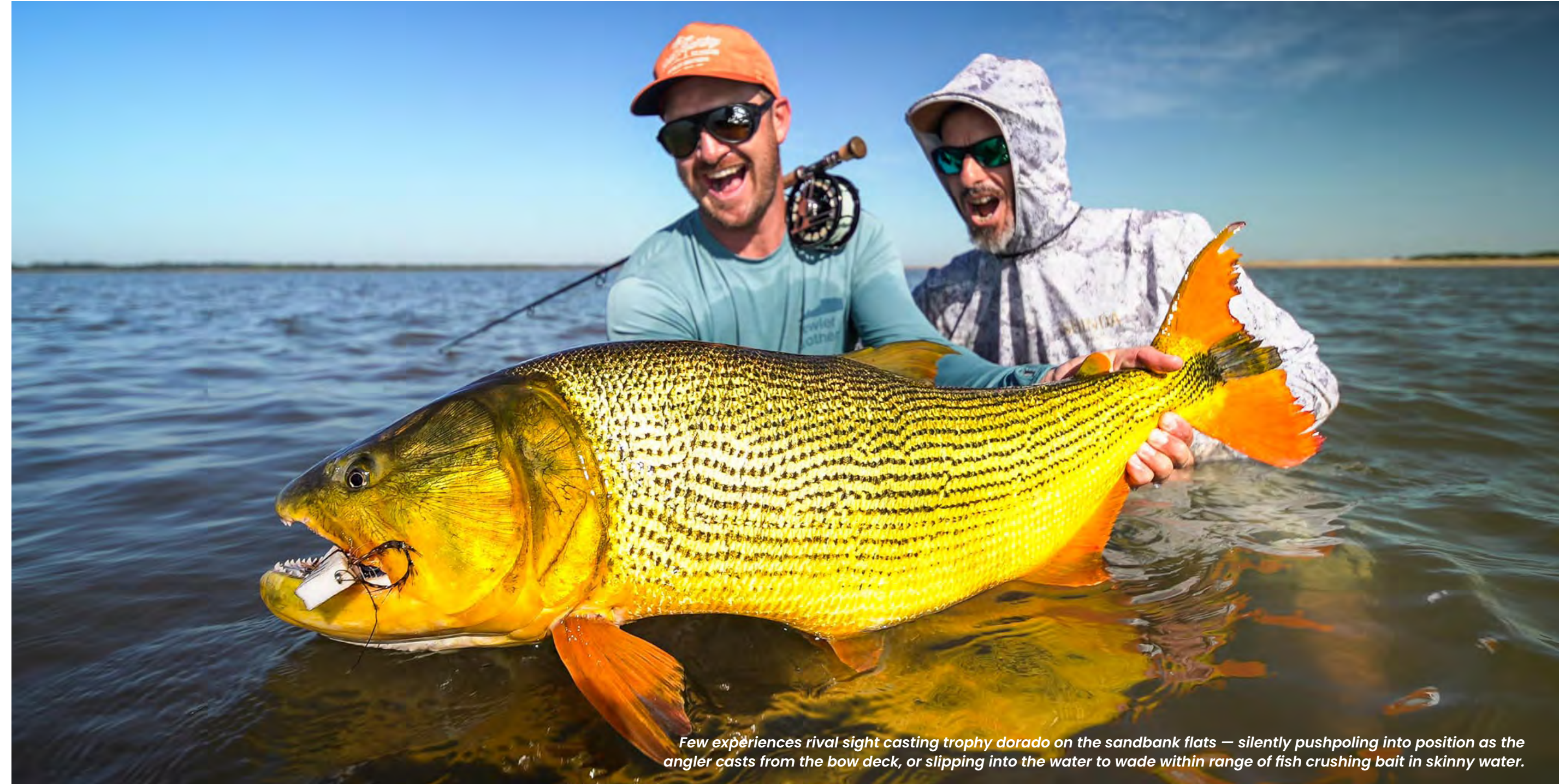
Few experiences rival sight casting trophy dorado on the sandbank flats — silently pushpoling into position as the angler casts from the bow deck, or slipping into the water to wade within range of fish crushing bait in skinny water.

At Suindá, boats are never trailered—they remain at the dock each evening, gassed up and ready to go every morning.