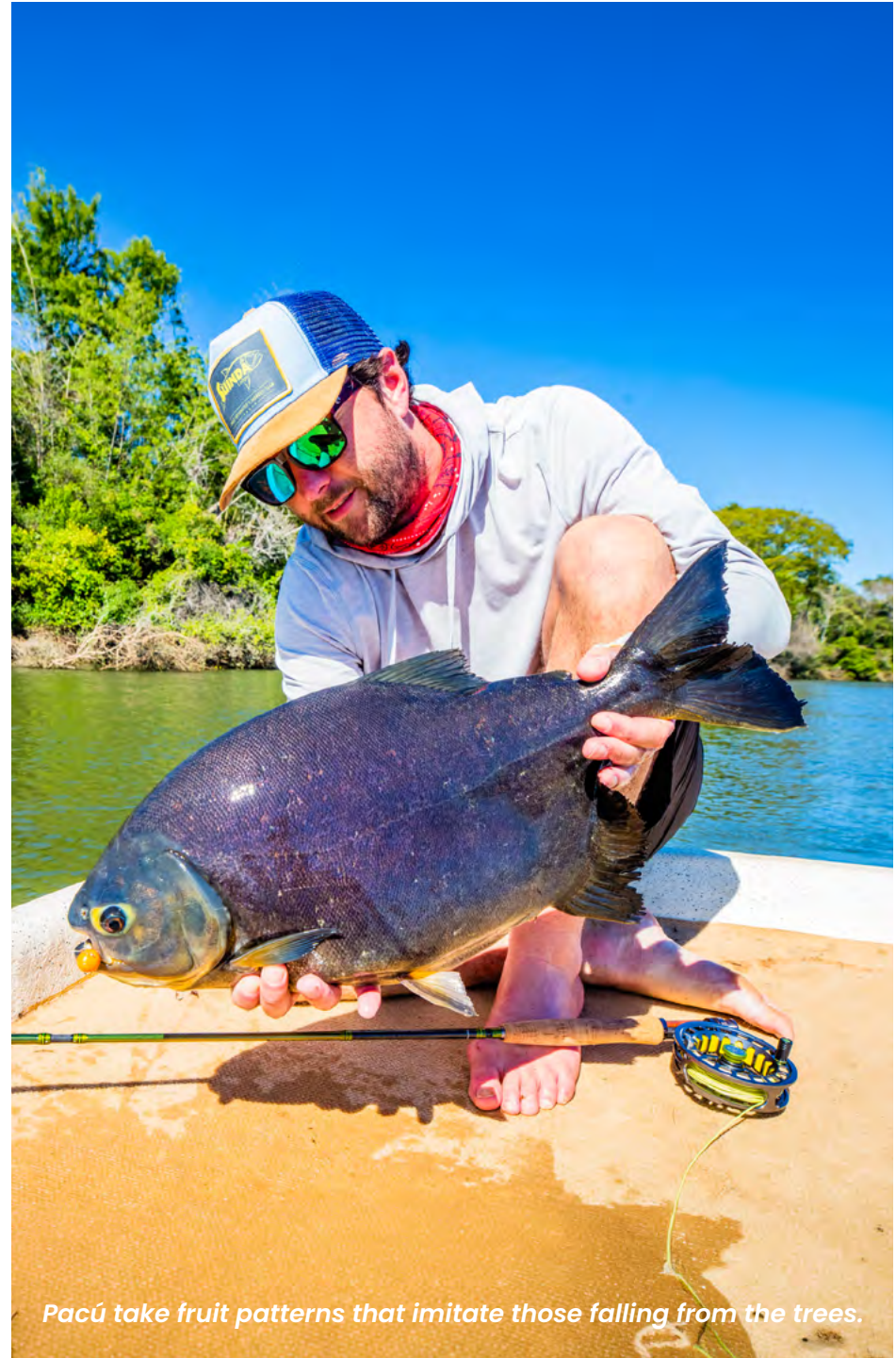
Pacú take fruit patterns that imitate those falling from the trees.