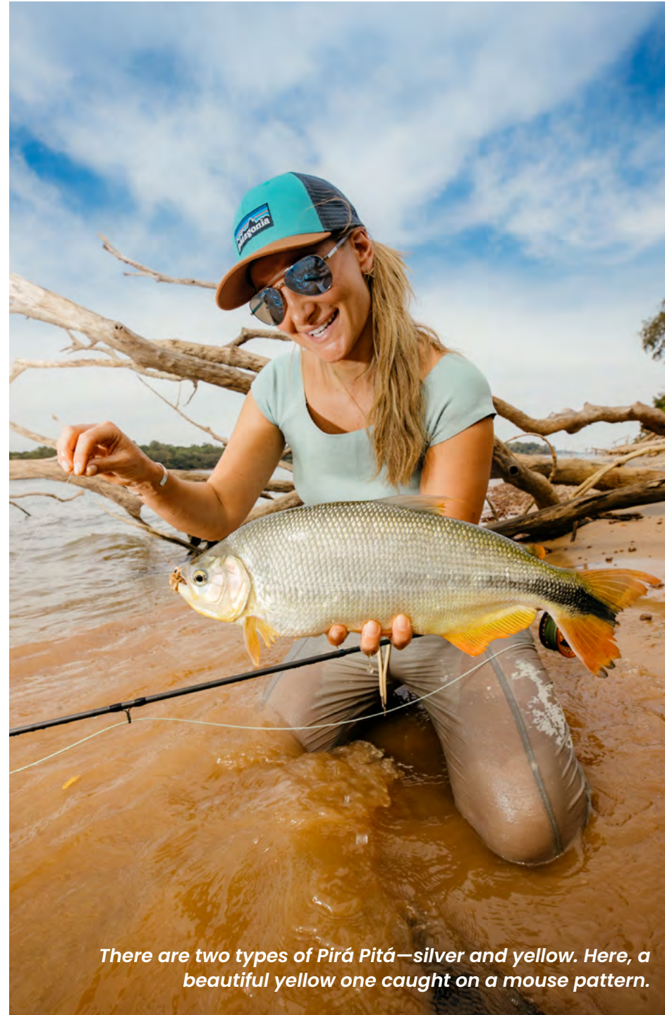
There are two types of Pirá Pitá—silver and yellow. Here, a beautiful yellow one caught on a mouse pattern.