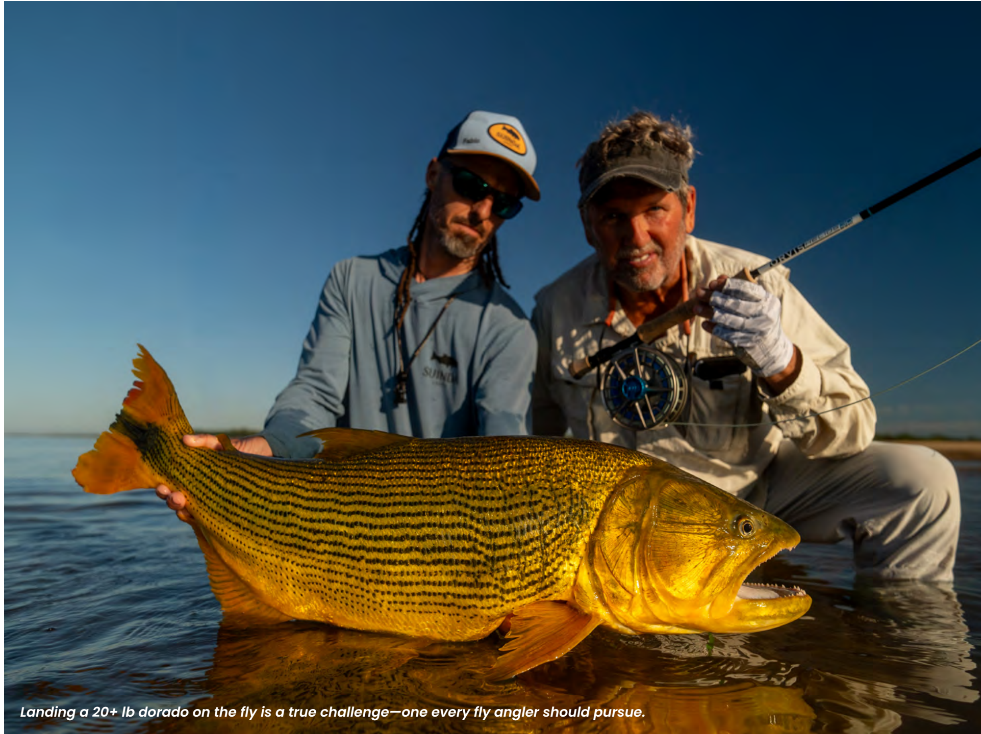
Landing a 20+ lb dorado on the fly is a true challenge—one every fly angler should pursue.