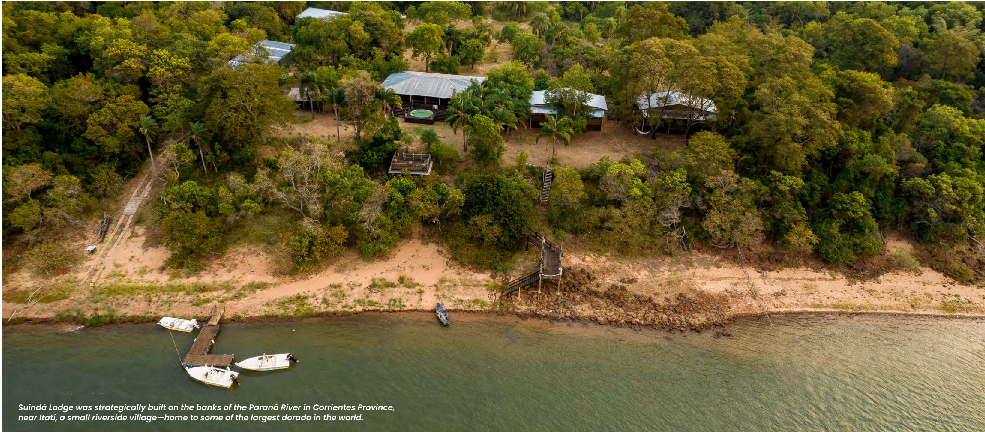
Suindá Lodge was strategically built on the banks of the Paraná River in Corrientes Province, near Itatí, a small riverside village—home to some of the largest dorado in the world.