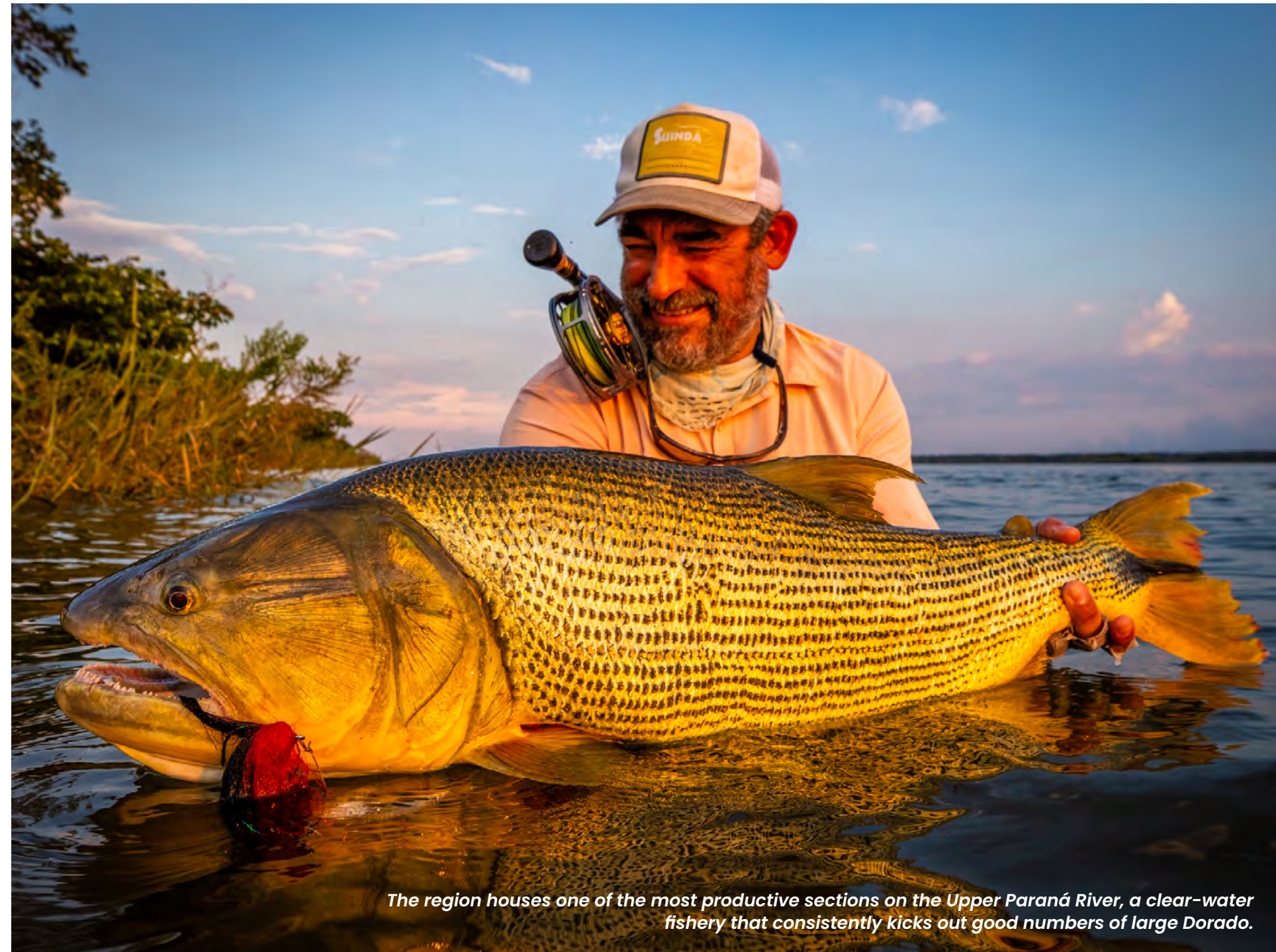
The region houses one of the most productive sections on the Upper Paraná River, a clear-water fishery that consistently kicks out good numbers of large Dorado.