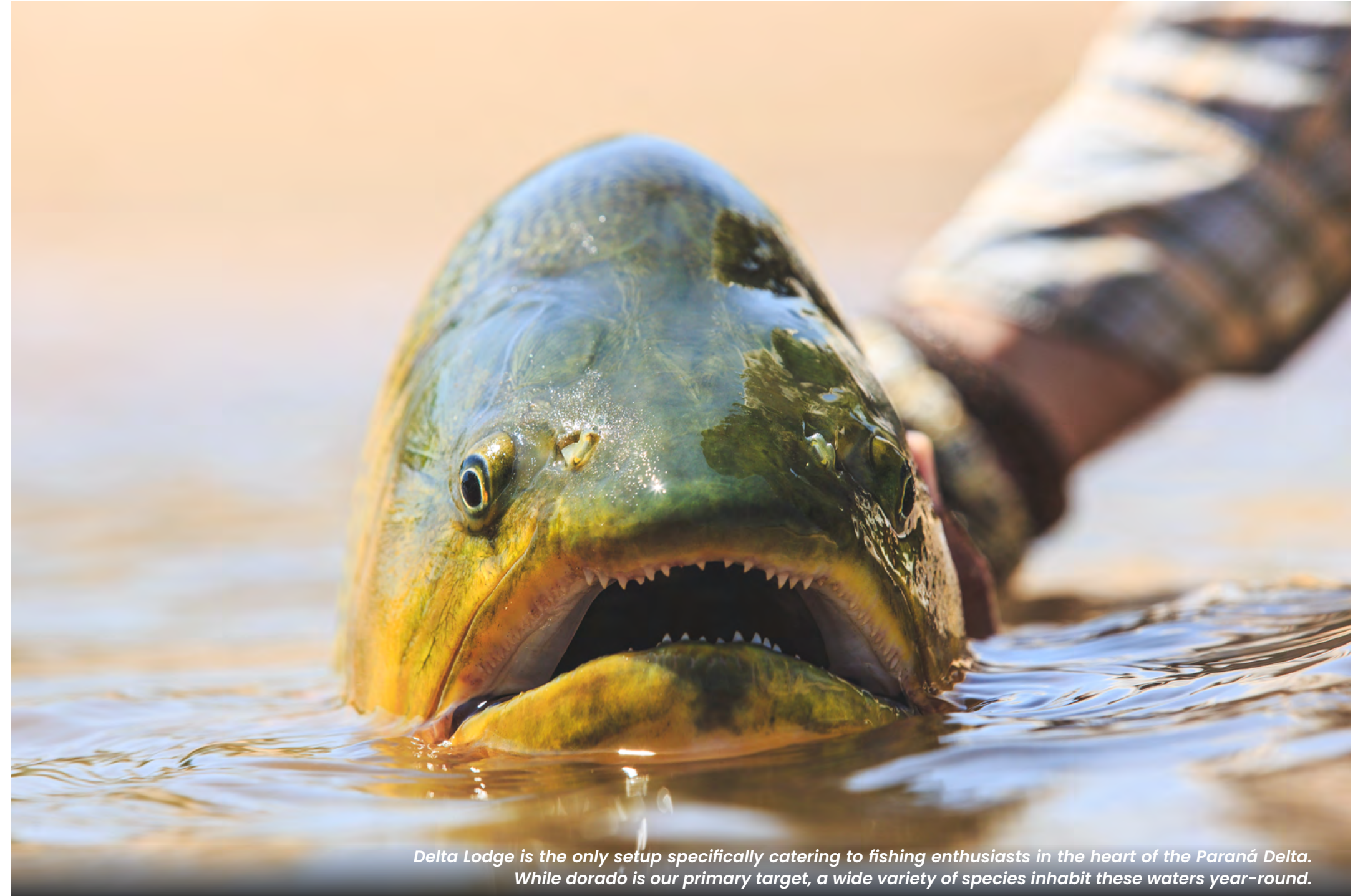
Delta Lodge is the only setup specifically catering to fishing enthusiasts in the heart of the Paraná Delta. While dorado is our primary target, a wide variety of species inhabit these waters year-round.

Many of our guests enjoy fishing for them right at the lodge, after the daily sessions. Our home pool and docks are literally a few meters away from the rooms and dining room, so at any time anybody can grab a rod and do some fishing while having a drink, smoking a cigar, or even having dinner right there in case the bite is on. Our favorite approach at night is fishing with floats. With the dock lights on, you can see all-around easily. It's really cool. For those who love coarse fishing, it can be quite amazing.