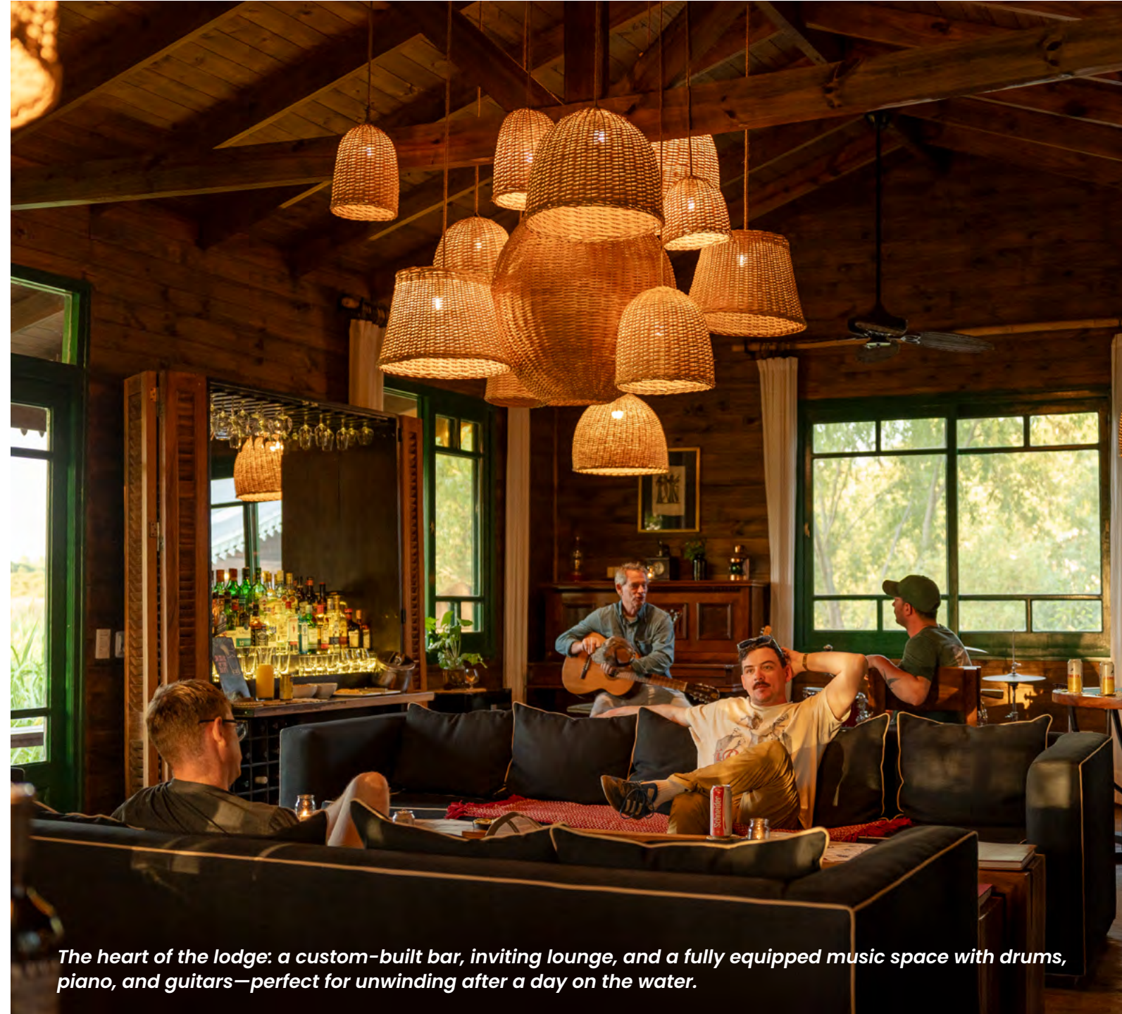
The heart of the lodge: a custom-built bar, inviting lounge, and a fully equipped music space with drums, piano, and guitars—perfect for unwinding after a day on the water.