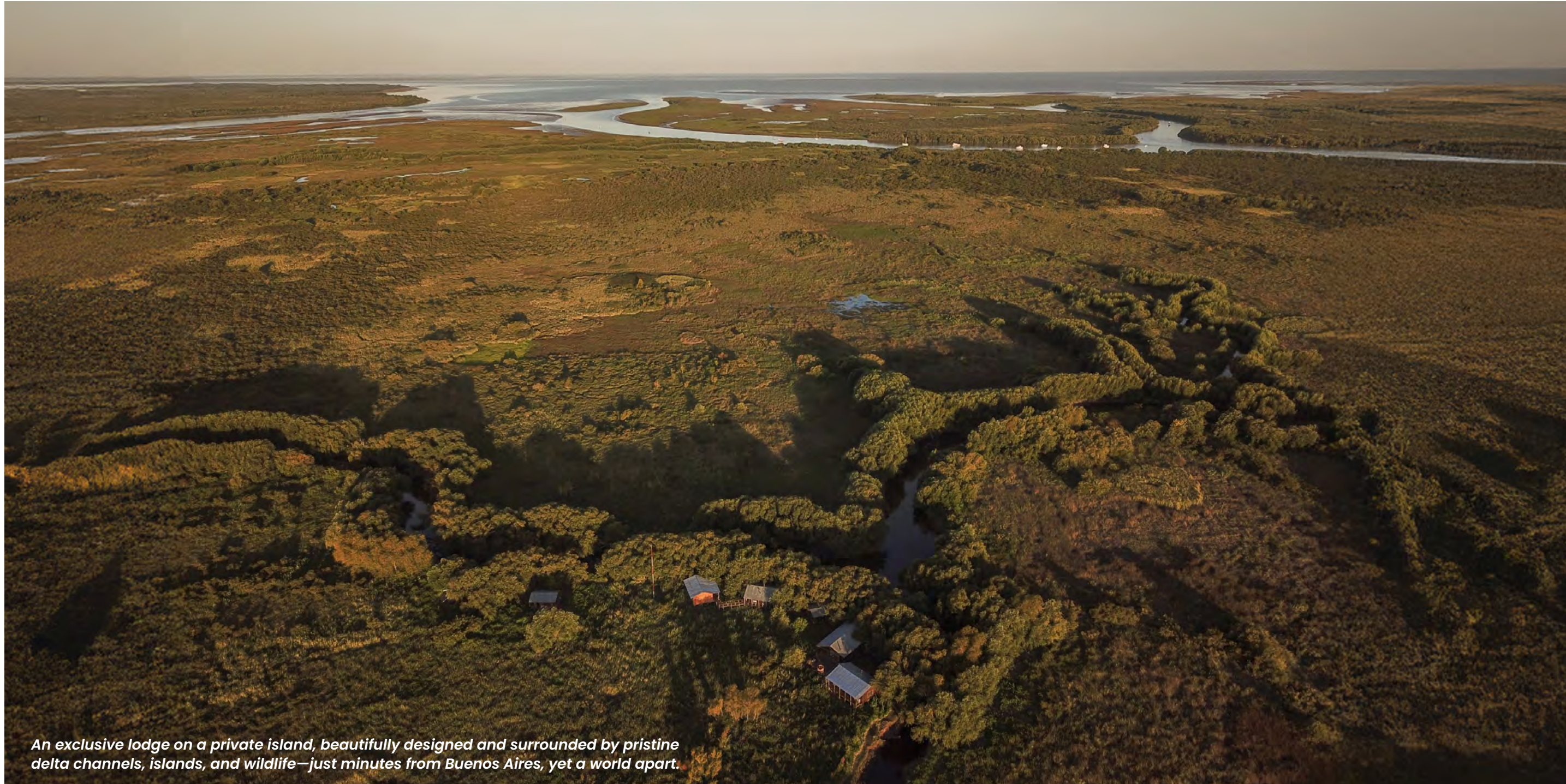
An exclusive lodge on a private island, beautifully designed and surrounded by pristine delta channels, islands, and wildlife—just minutes from Buenos Aires, yet a world apart.