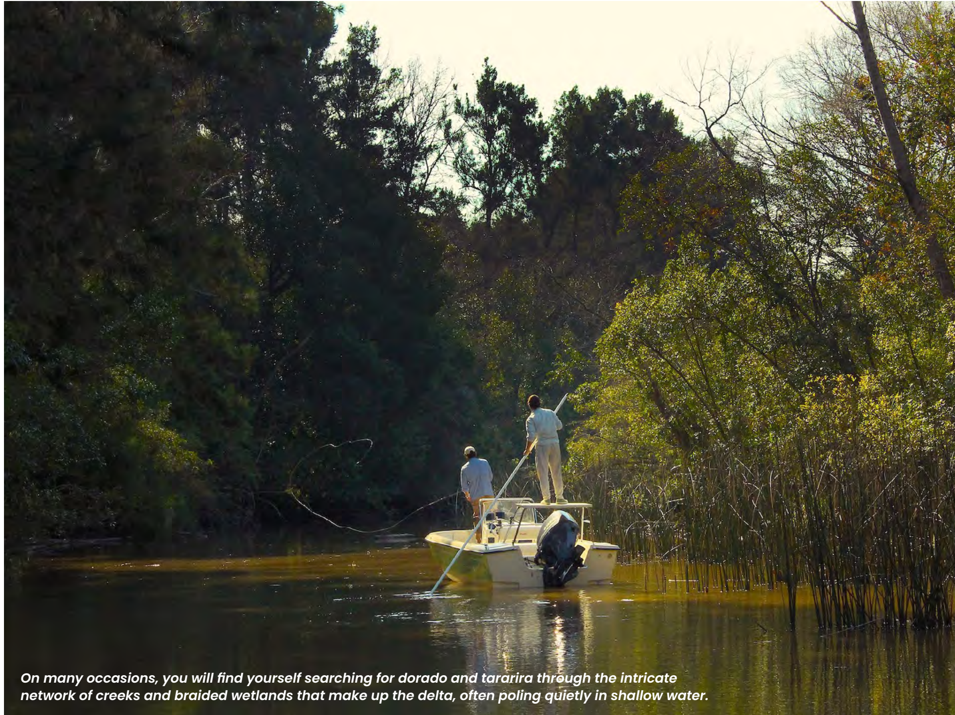
On many occasions, you will find yourself searching for dorado and tararira through the intricate network of creeks and braided wetlands that make up the delta, often poling quietly in shallow water.