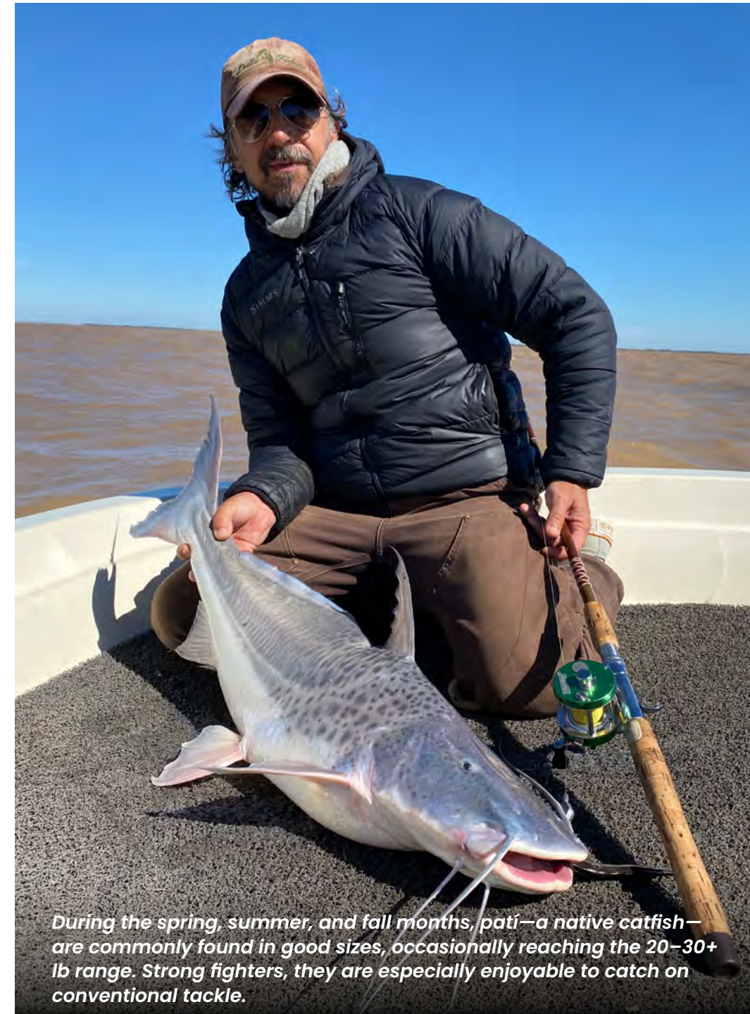
During the spring, summer, and fall months, pati—a native catfish—are commonly found in good sizes, occasionally reaching the 20–30+ lb range. Strong fighters, they are especially enjoyable to catch on conventional tackle.