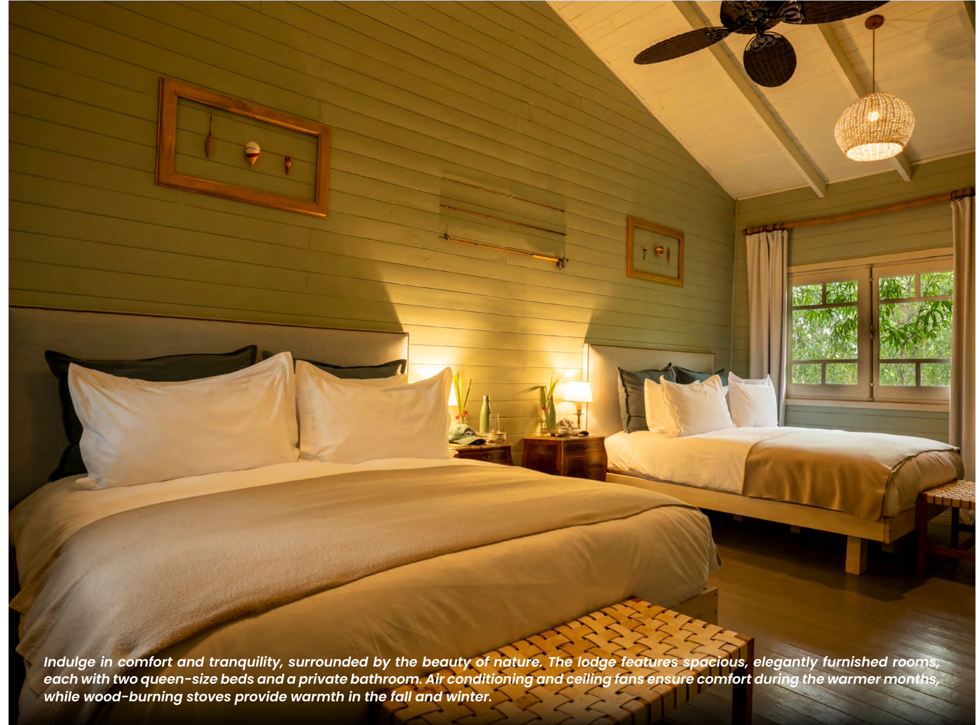
Indulge in comfort and tranquility, surrounded by the beauty of nature. The lodge features spacious, elegantly furnished rooms, each with two queen-size beds and a private bathroom. Air conditioning and ceiling fans ensure comfort during the warmer months, while wood-burning stoves provide warmth in the fall and winter.