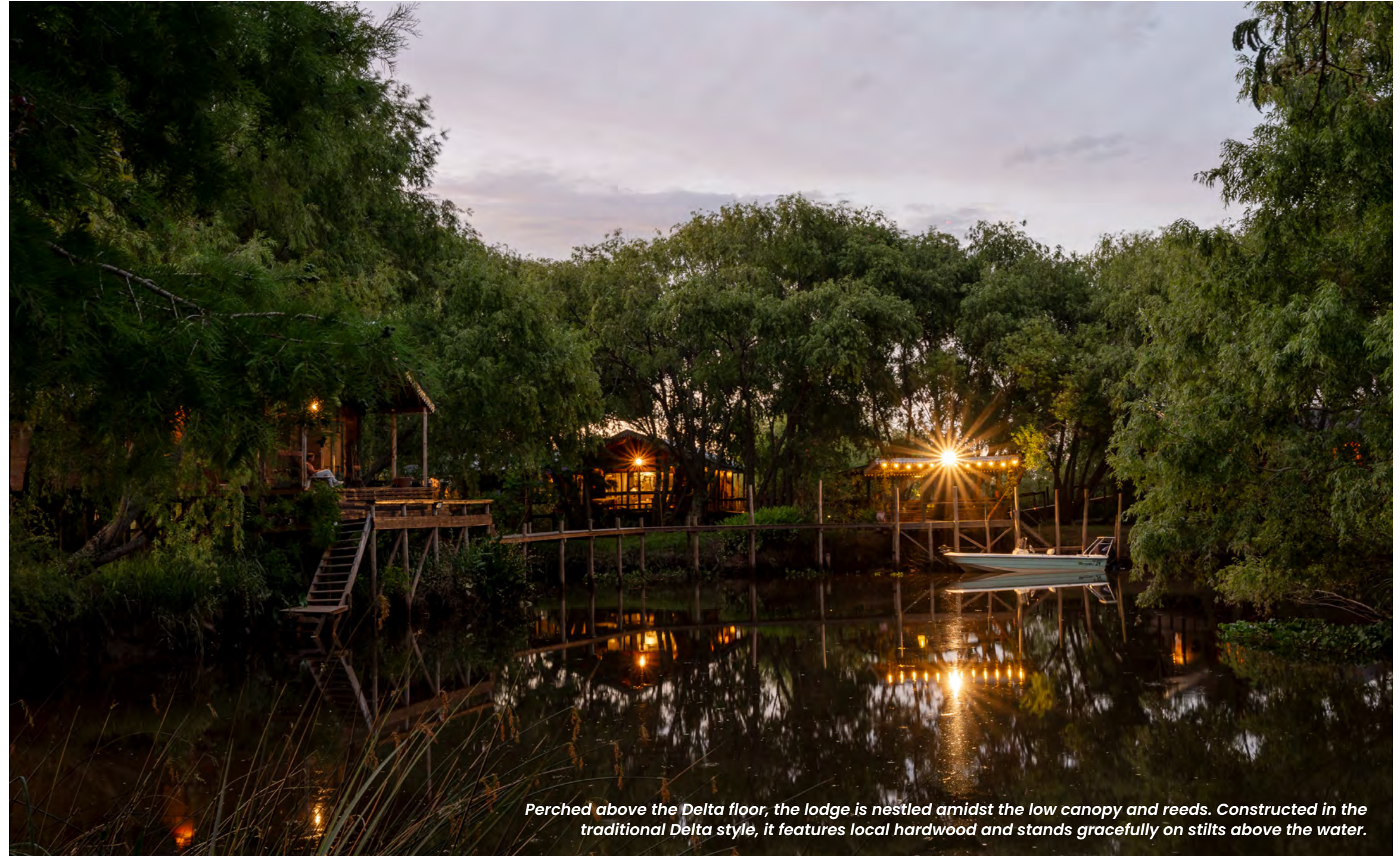
Perched above the Delta floor, the lodge is nestled amidst the low canopy and reeds. Constructed in the traditional Delta style, it features local hardwood and stands gracefully on stilts above the water.