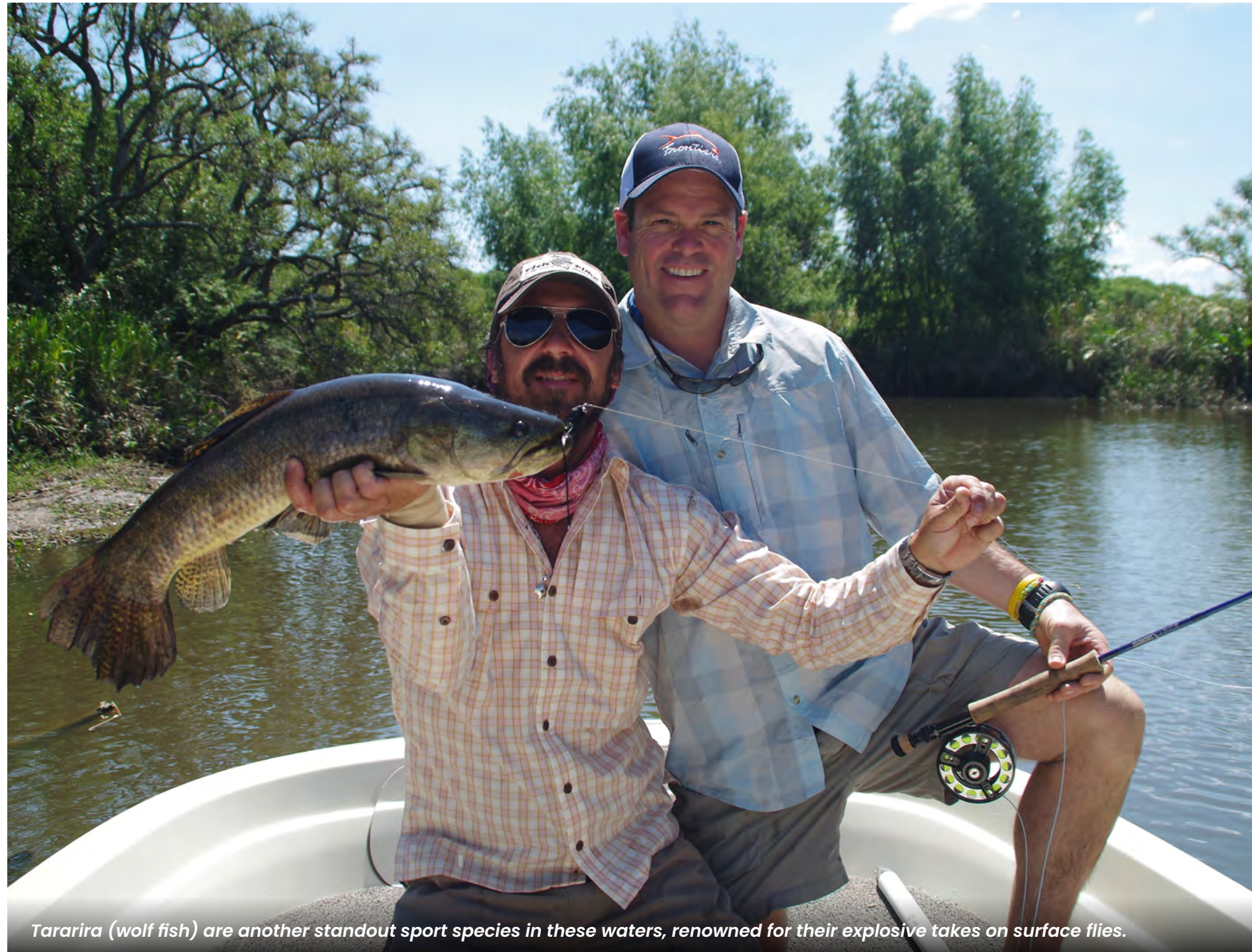
Tararira (wolf fish) are another standout sport species in these waters, renowned for their explosive takes on surface flies.