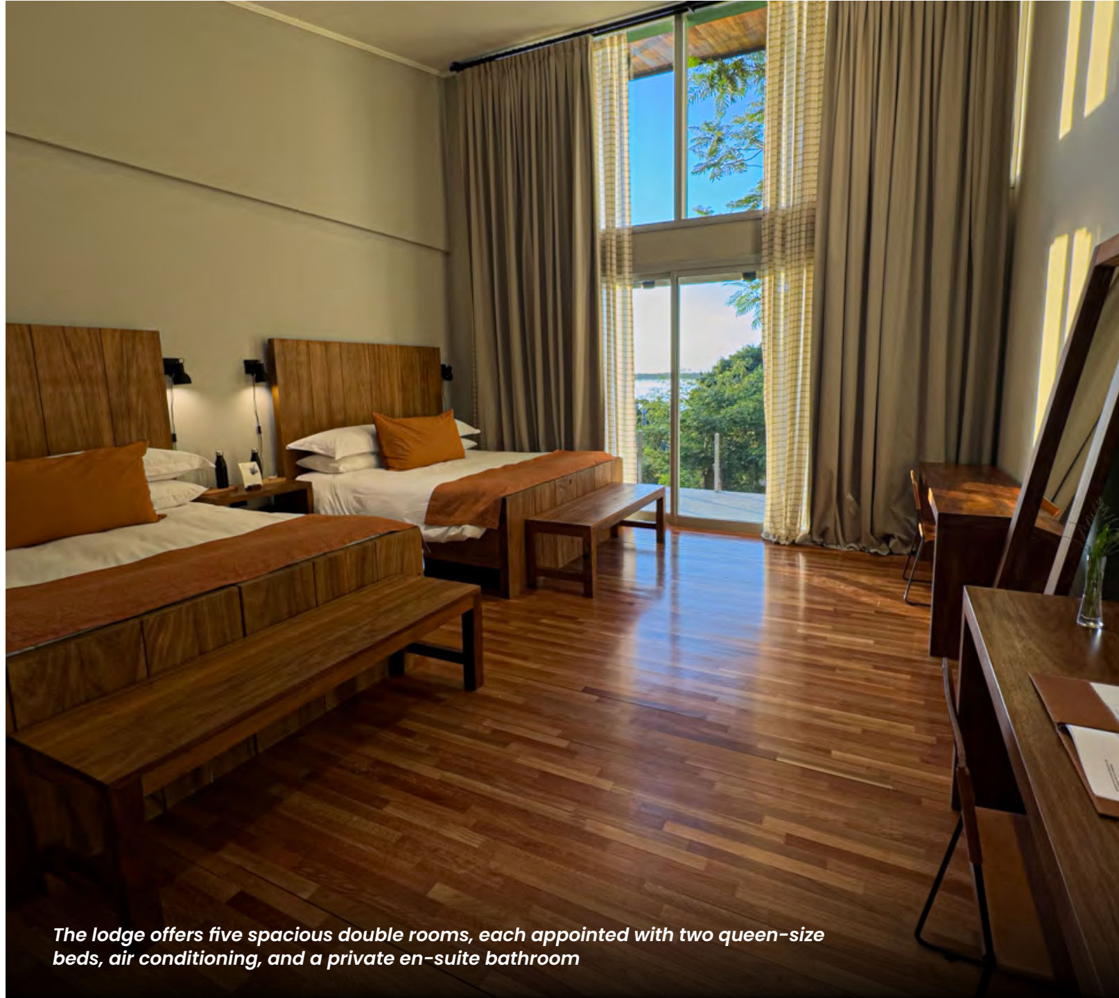
The lodge offers five spacious double rooms, each appointed with two queen-size beds, air conditioning, and a private en-suite bathroom