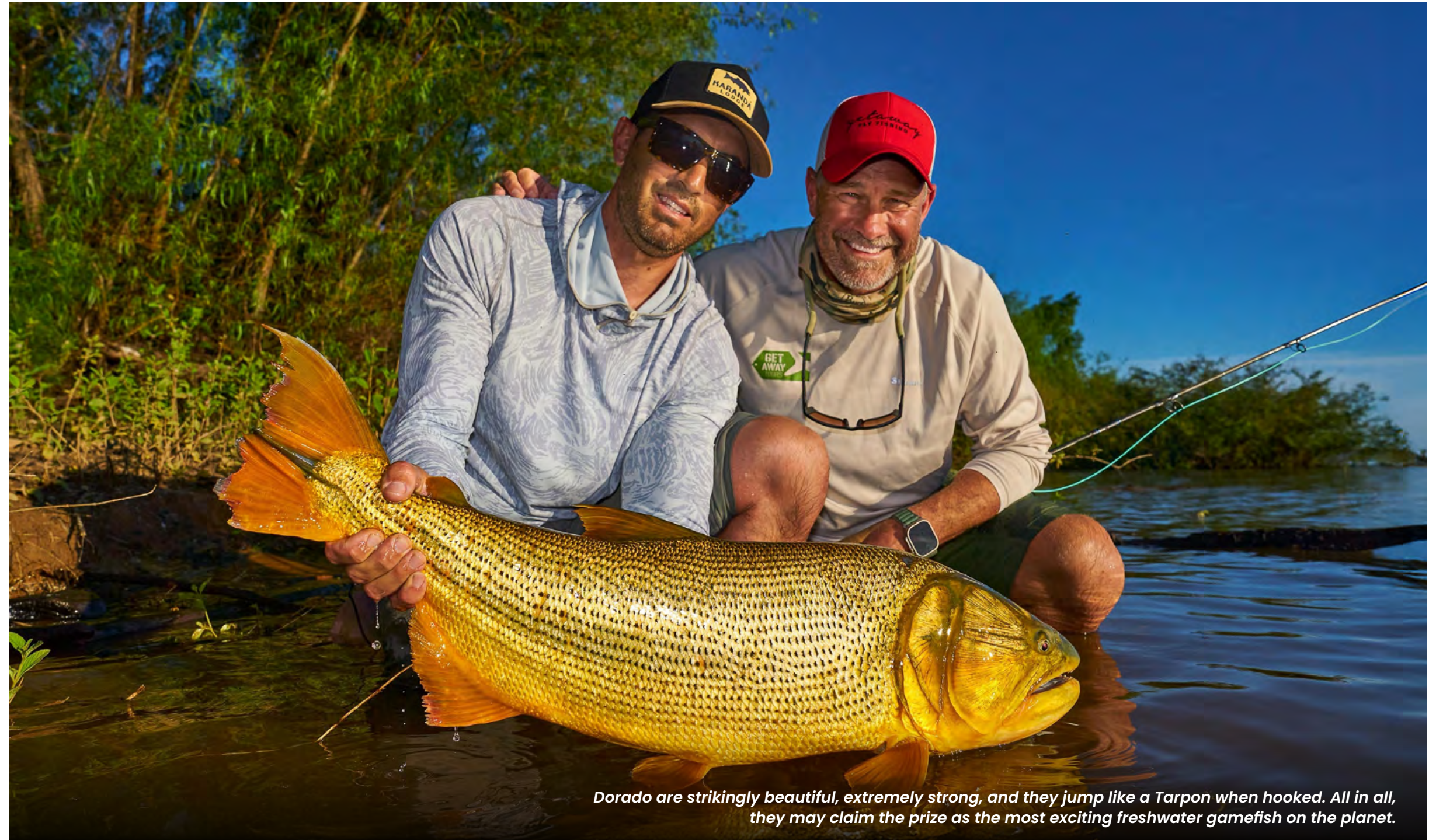
Dorado are strikingly beautiful, extremely strong, and they jump like a Tarpon when hooked. All in all, they may claim the prize as the most exciting freshwater gamefish on the planet.