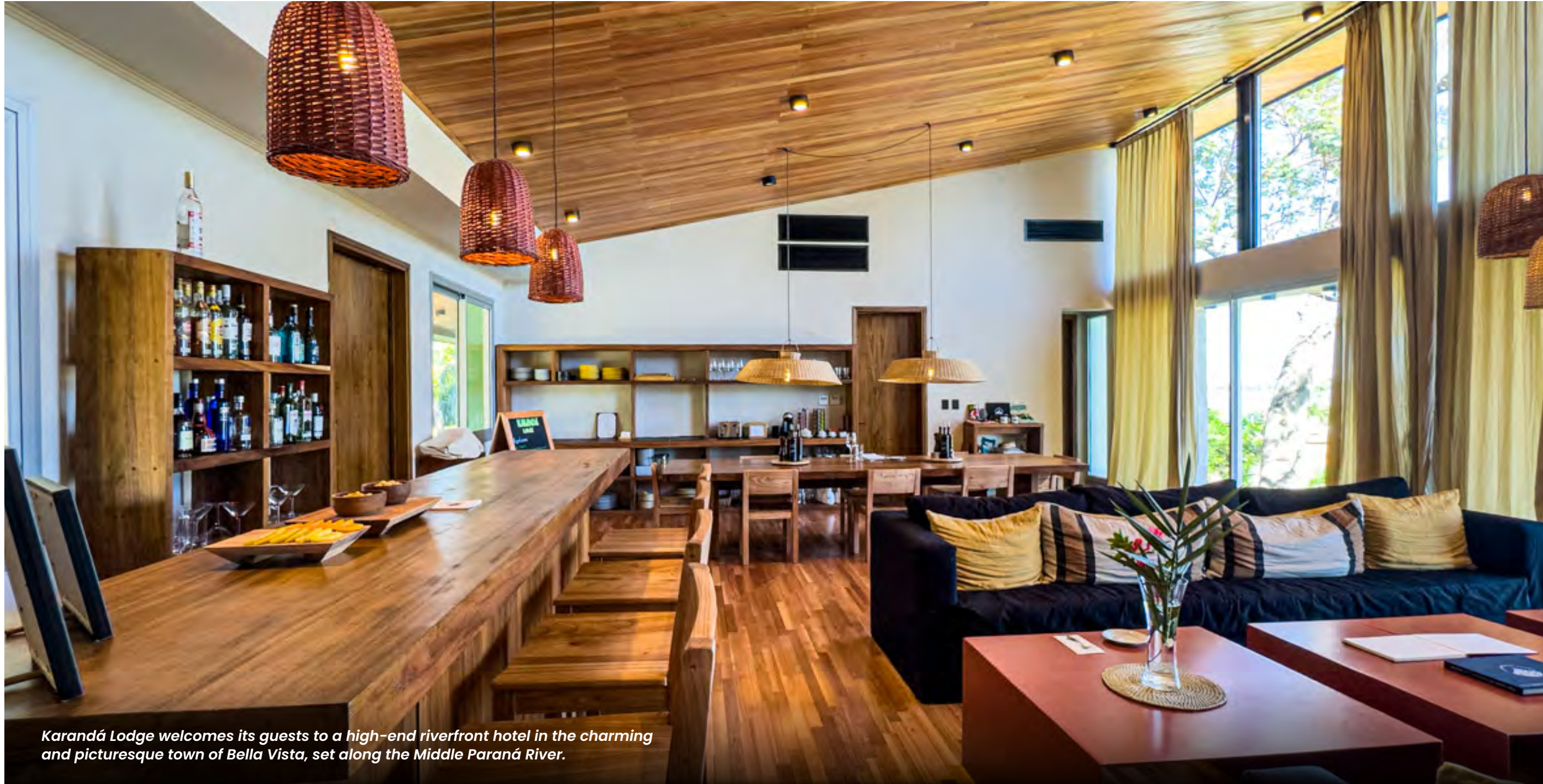
Karandá Lodge welcomes its guests to a high-end riverfront hotel in the charming and picturesque town of Bella Vista, set along the Middle Paraná River.