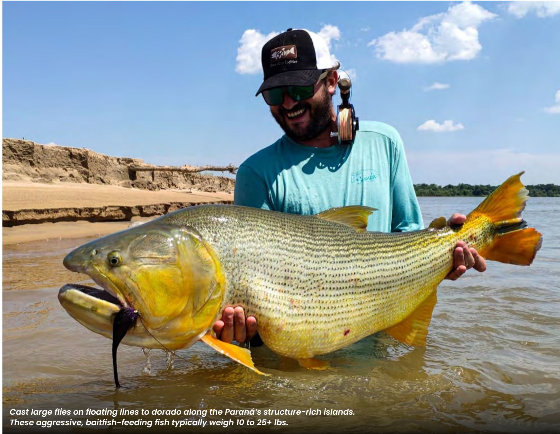
Cast large flies on floating lines to dorado along the Paraná's structure-rich islands. These aggressive, baitfish-feeding fish typically weigh 10 to 25+ lbs.