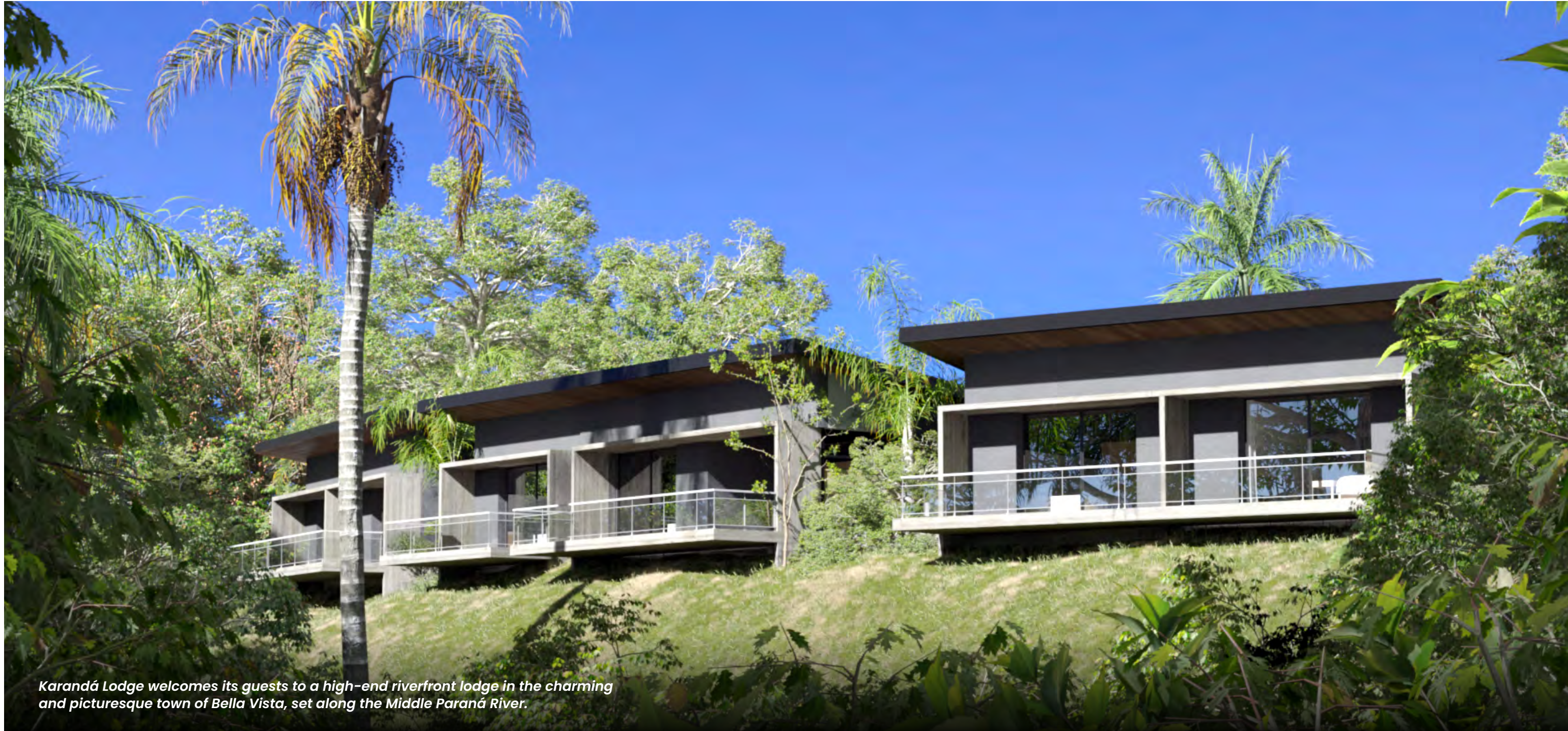
Karandá Lodge welcomes its guests to a high-end riverfront lodge in the charming and picturesque town of Bella Vista, set along the Middle Paraná River.