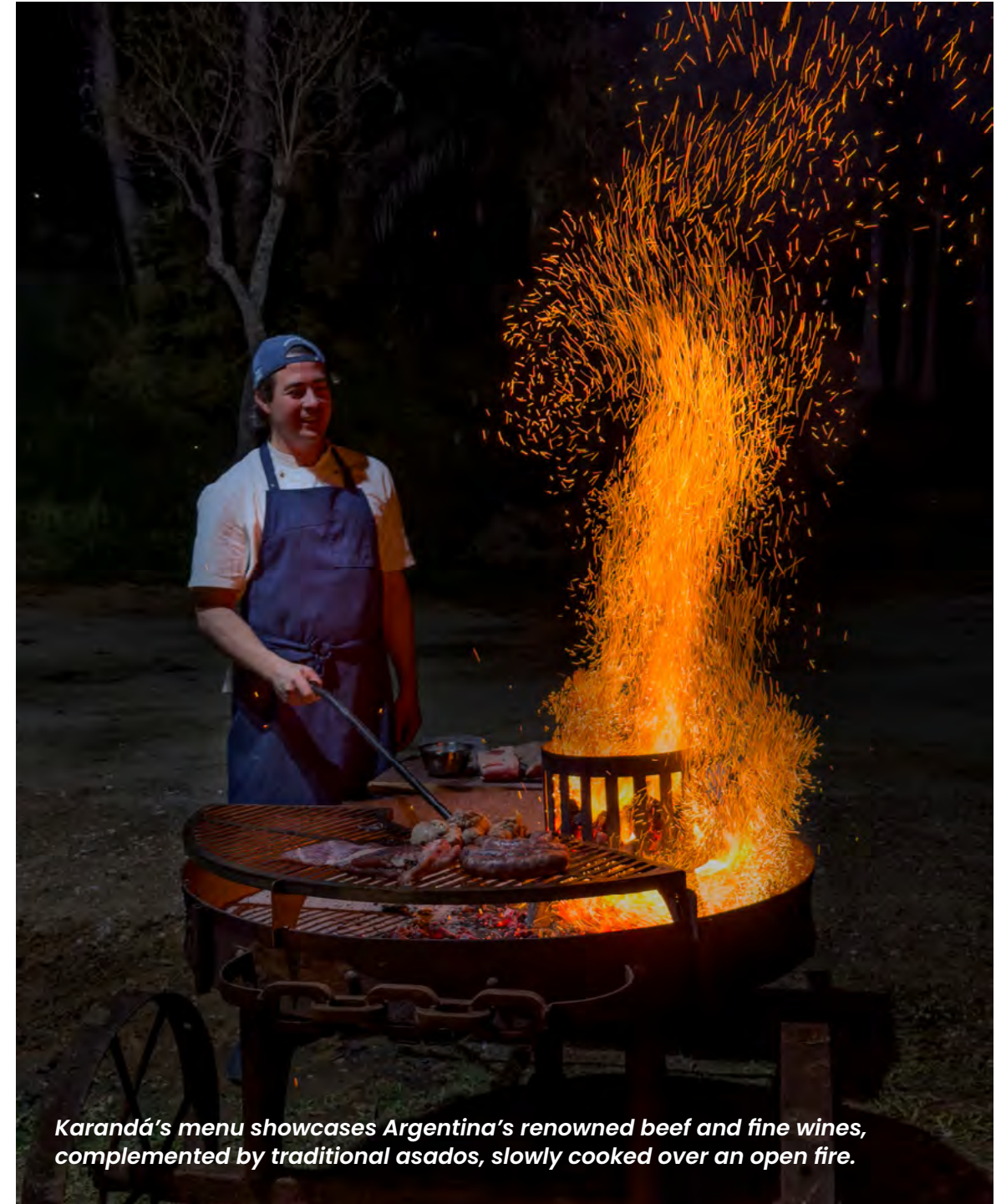
Karandá's menu showcases Argentina's renowned beef and fine wines, complemented by traditional asados, slowly cooked over an open fire.