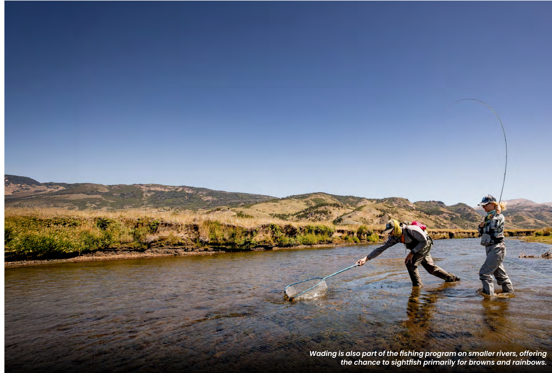
Wading is also part of the fishing program on smaller rivers, offering the chance to sightfish primarily for browns and rainbows.

Chime Lodge offers fully customized programs ranging from as short as two full days to trips of up to ten days. Unlike many lodges in the region, there are no fixed arrival and departure dates, allowing for a truly personalized experience tailored to each angler. For those looking to explore more remote waters, Chime also offers a two-night “Unplugged” glamping float program (see next pages for more details).