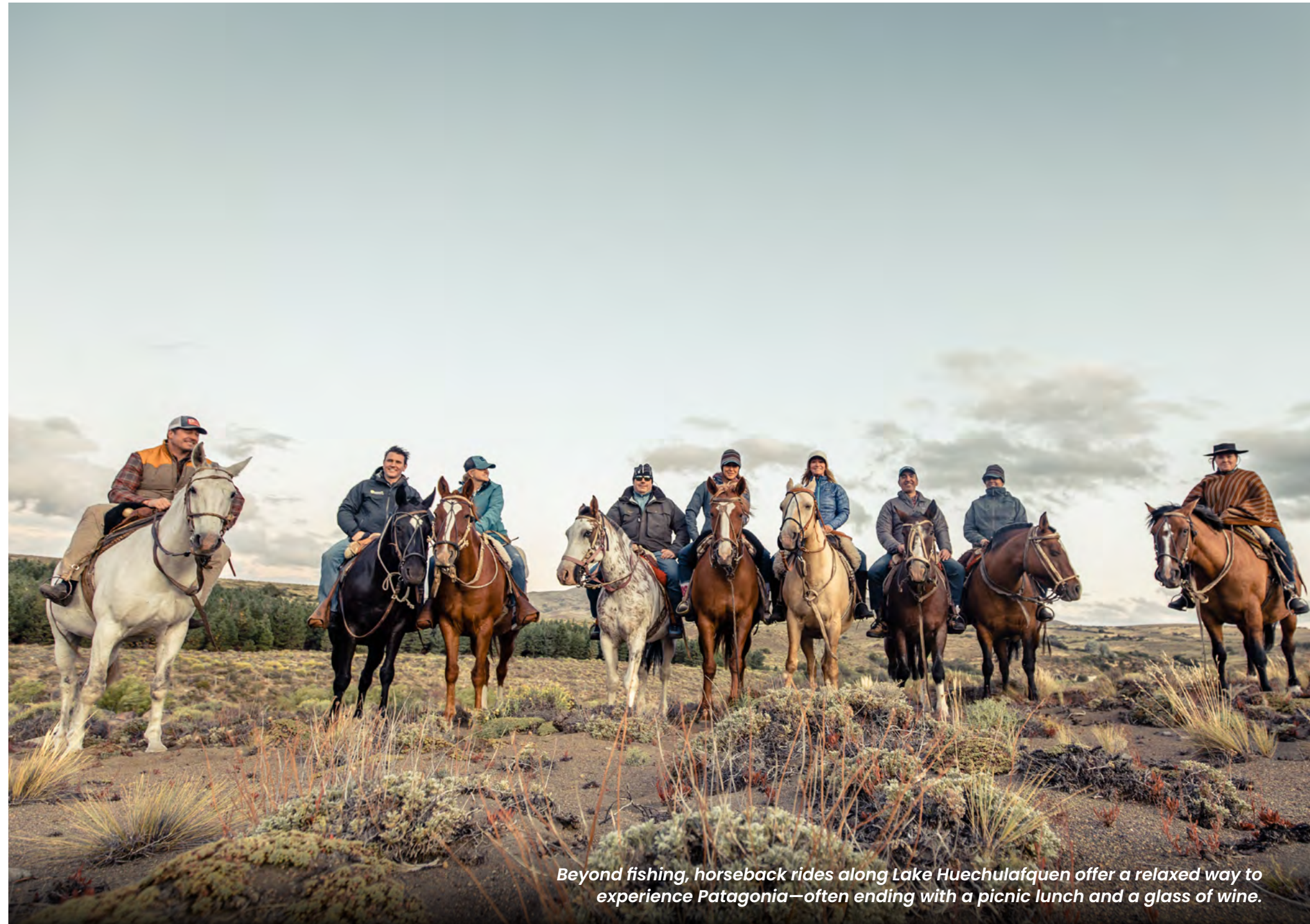
Beyond fishing, horseback rides along Lake Huechulafquen offer a relaxed way to experience Patagonia—often ending with a picnic lunch and a glass of wine.