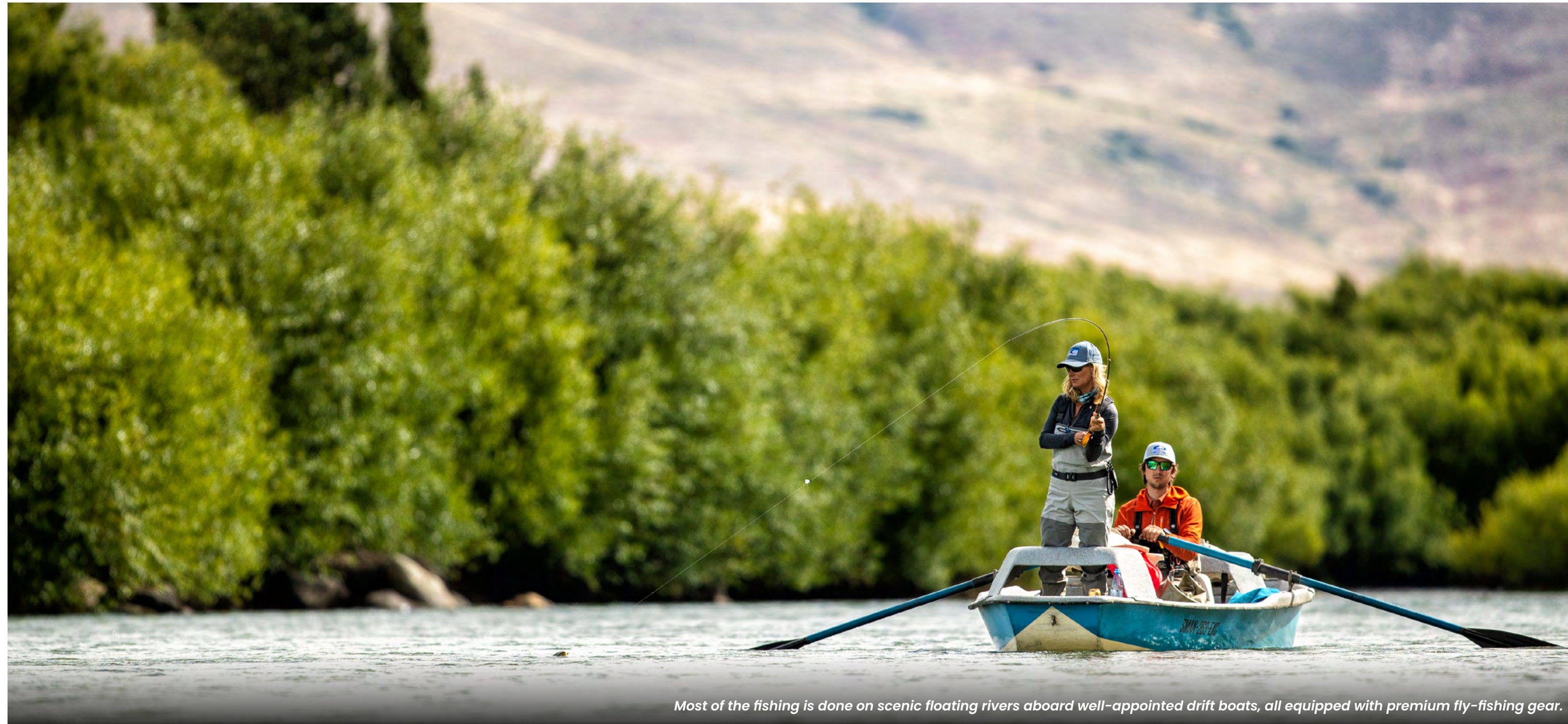
Most of the fishing is done on scenic floating rivers aboard well-appointed drift boats, all equipped with premium fly-fishing gear.

Most fishing is done from drift boats, though wade fishing is also readily available. The picturesque Chimehuín River is both wade- and float-friendly, flowing for 25 miles before joining the Collón Curá River—one of Patagonia’s most iconic fisheries. Nearby, smaller technical streams offer excellent opportunities for dry-fly, streamer, and nymph fishing, depending on the season.