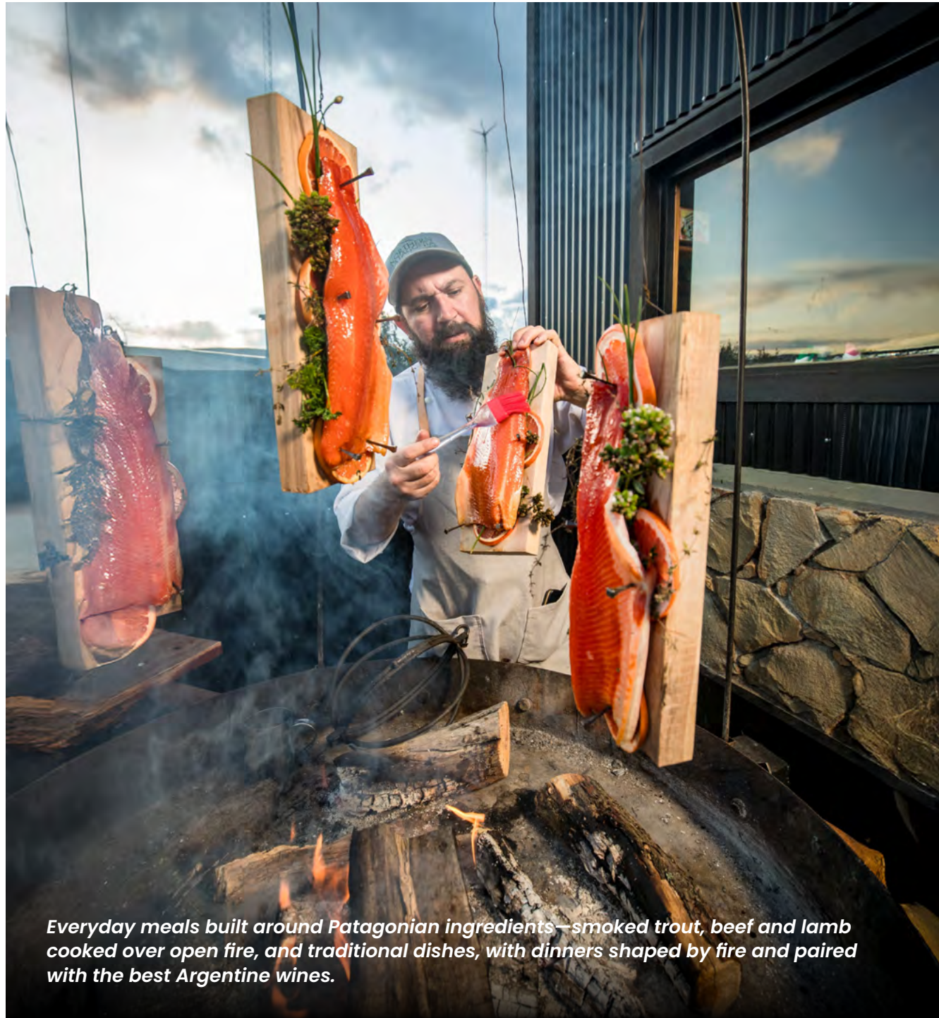
Everyday meals built around Patagonian ingredients—smoked trout, beef and lamb cooked over open fire, and traditional dishes, with dinners shaped by fire and paired with the best Argentine wines.