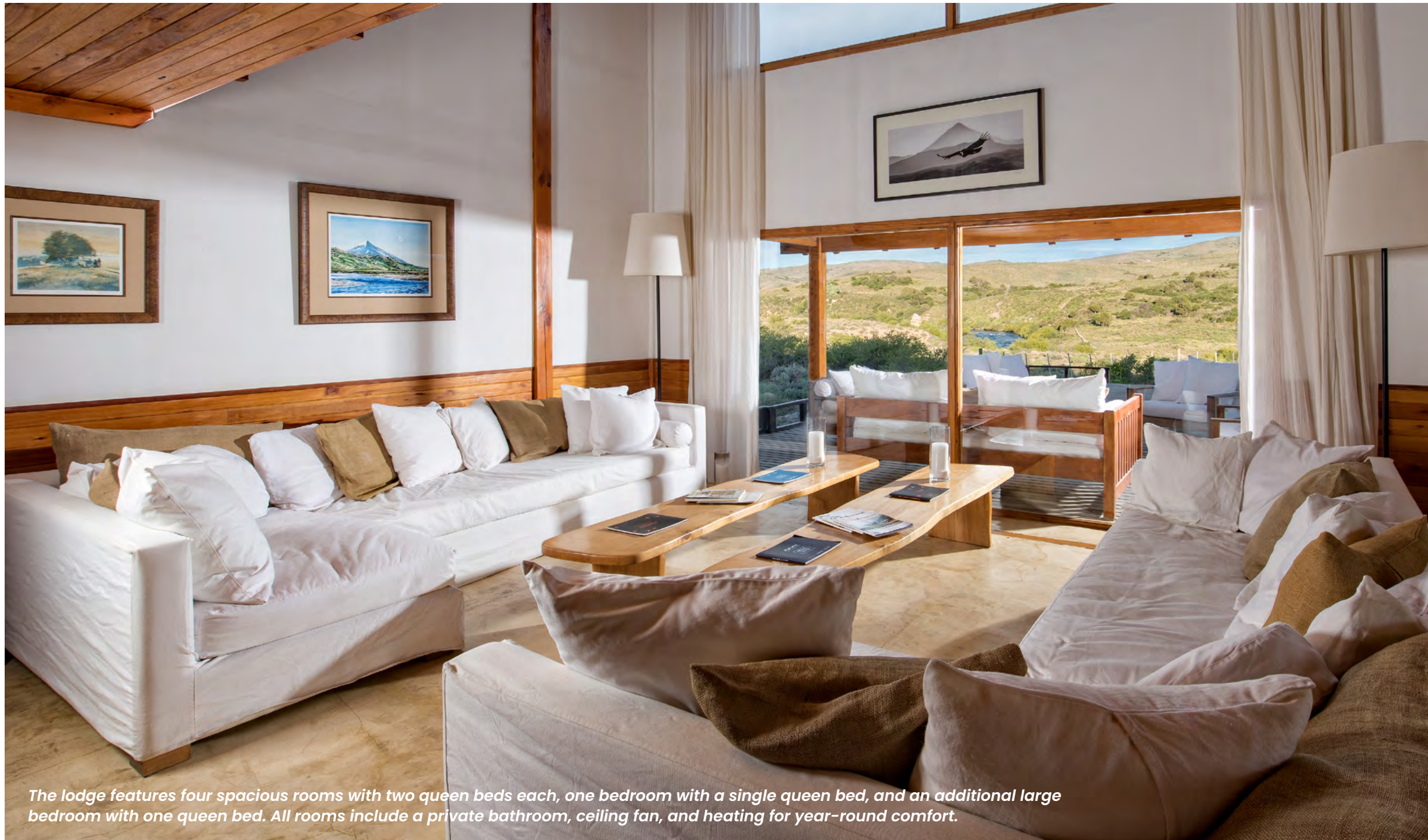
The lodge features four spacious rooms with two queen beds each, one bedroom with a single queen bed, and an additional large bedroom with one queen bed. All rooms include a private bathroom, ceiling fan, and heating for year-round comfort.