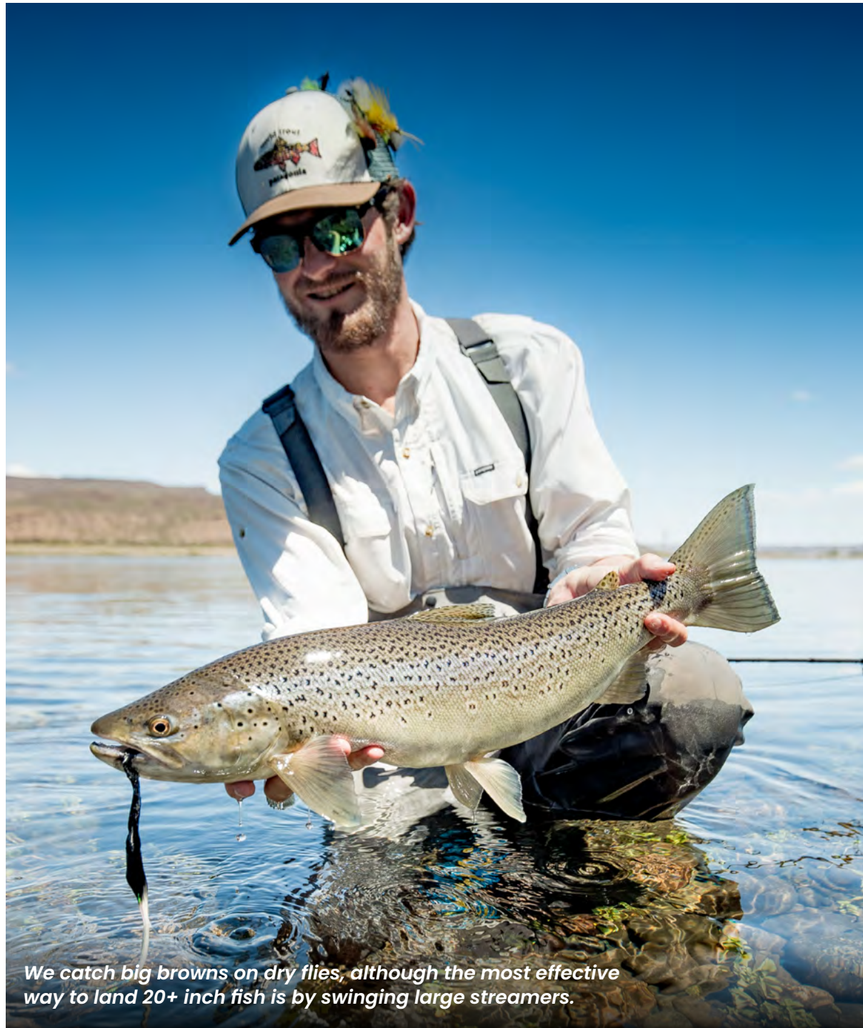
We catch big browns on dry flies, although the most effective way to land 20+ inch fish is by swinging large streamers.