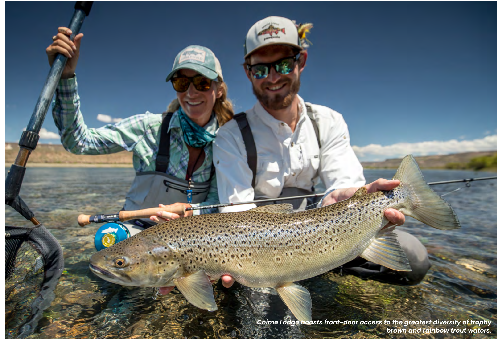
Chime Lodge boasts front-door access to the greatest diversity of trophy brown and rainbow trout waters.