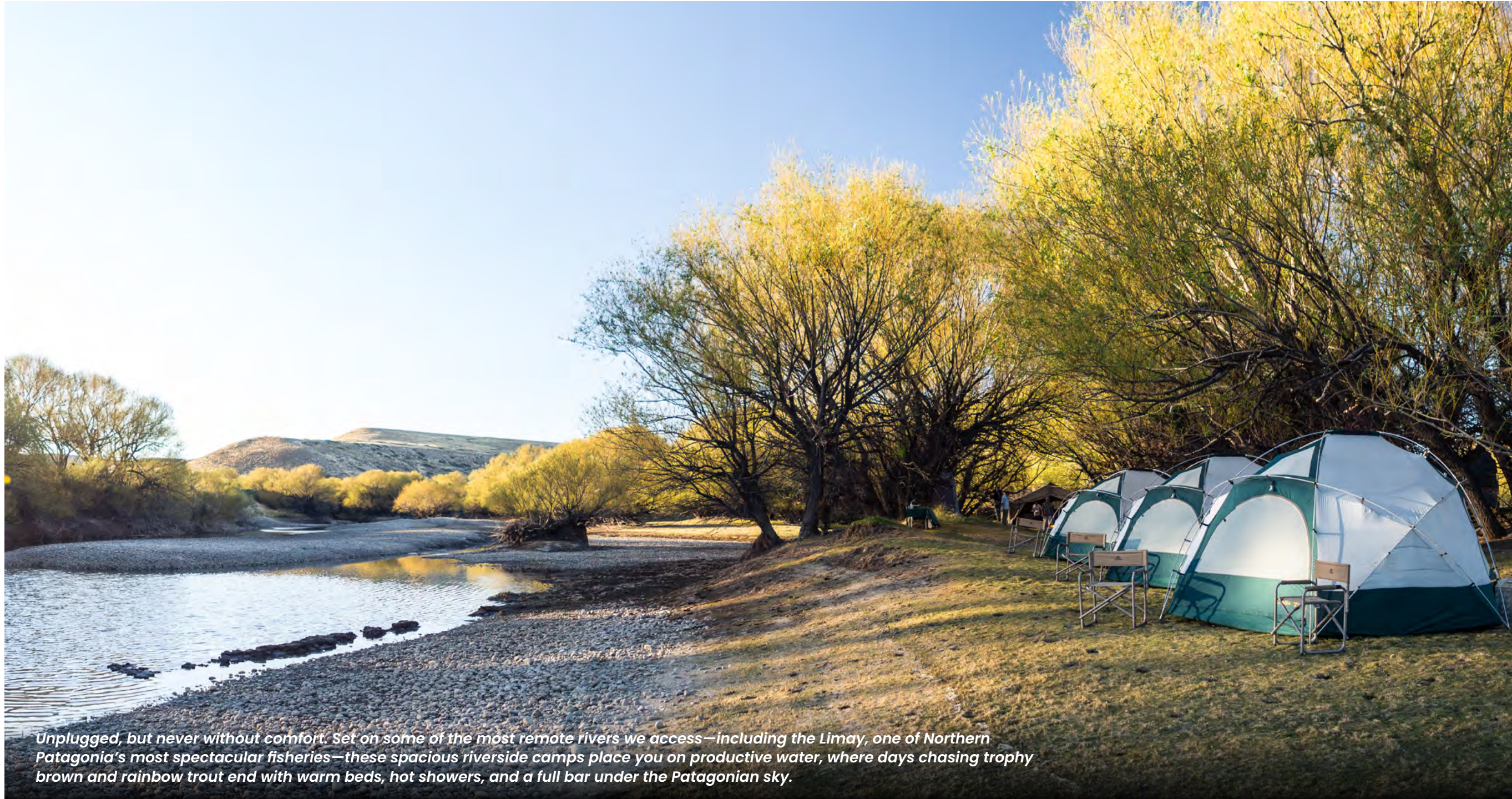
Unplugged, but never without comfort. Set on some of the most remote rivers we access—including the Limay, one of Northern Patagonia's most spectacular fisheries—these spacious riverside camps place you on productive water, where days chasing trophy brown and rainbow trout end with warm beds, hot showers, and a full bar under the Patagonian sky.