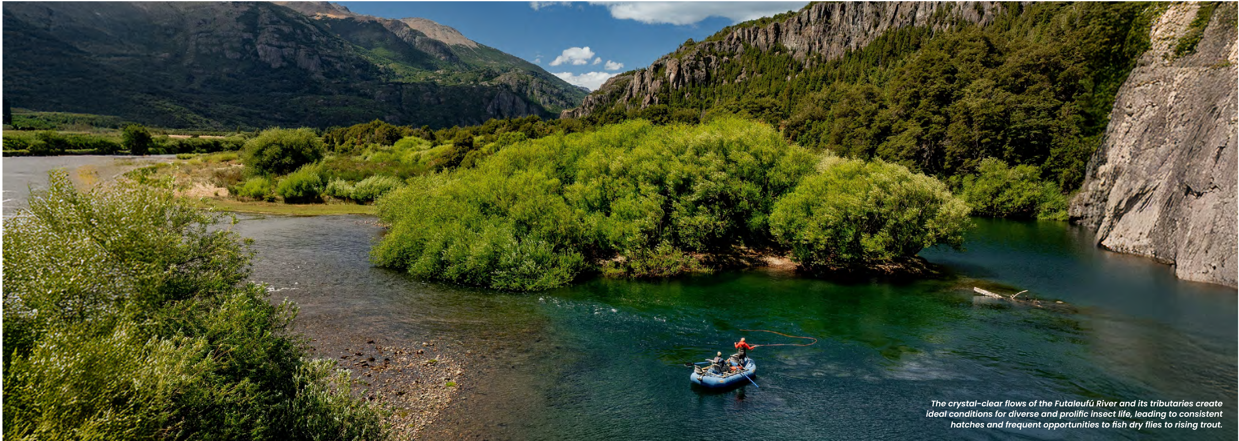
The crystal-clear flows of the Futaleufú River and its tributaries create ideal conditions for diverse and prolific insect life, leading to consistent hatches and frequent opportunities to fish dry flies to rising trout.