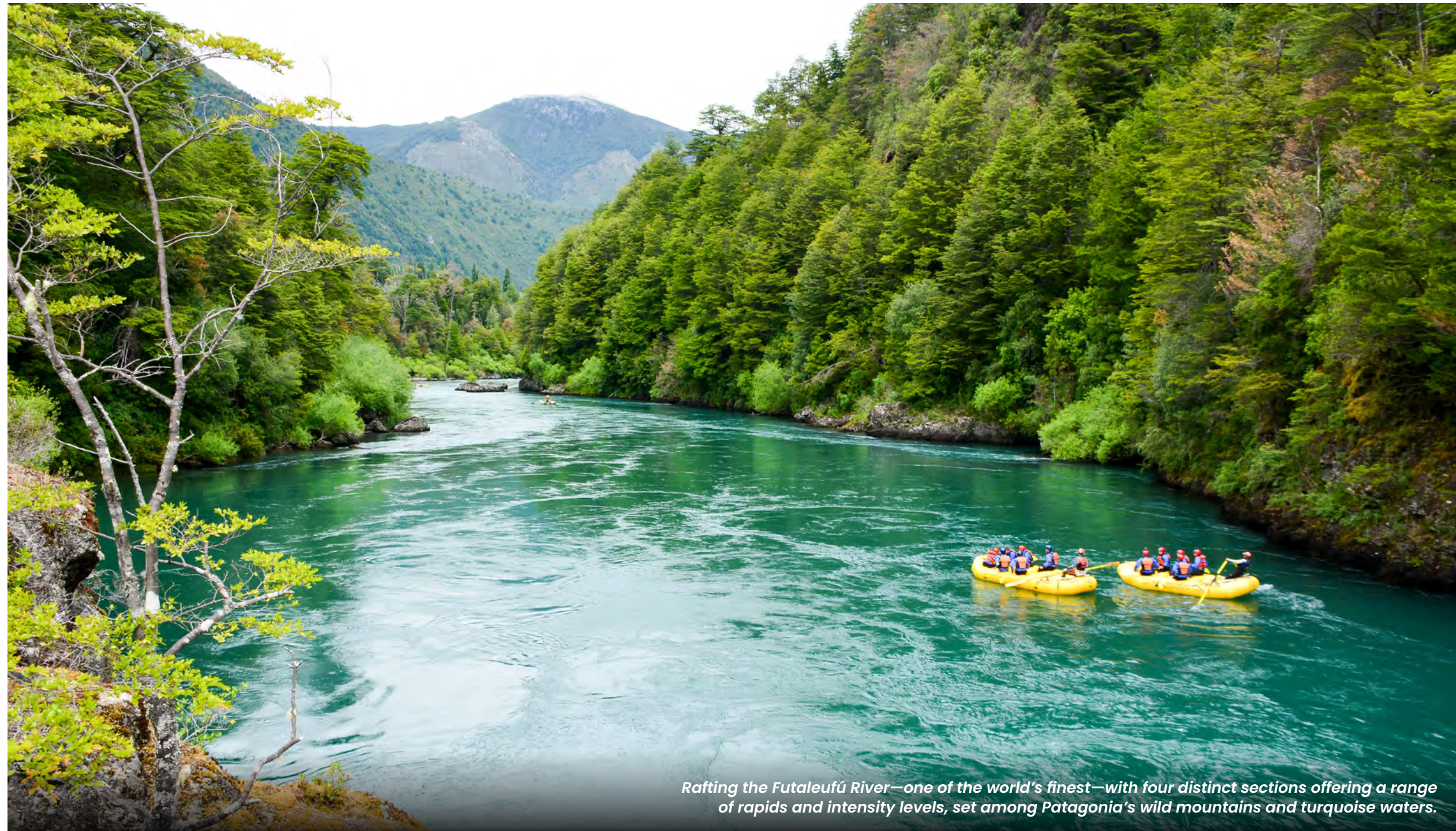
Rafting the Futaleufú River—one of the world's finest—with four distinct sections offering a range of rapids and intensity levels, set among Patagonia's wild mountains and turquoise waters.

A guided visit to the town of Futaleufú, nestled between mountains and rivers, offers insight into the region's culture, history, and daily life, along with access to iconic viewpoints and local highlights. Duration: approximately half day (4 hours).