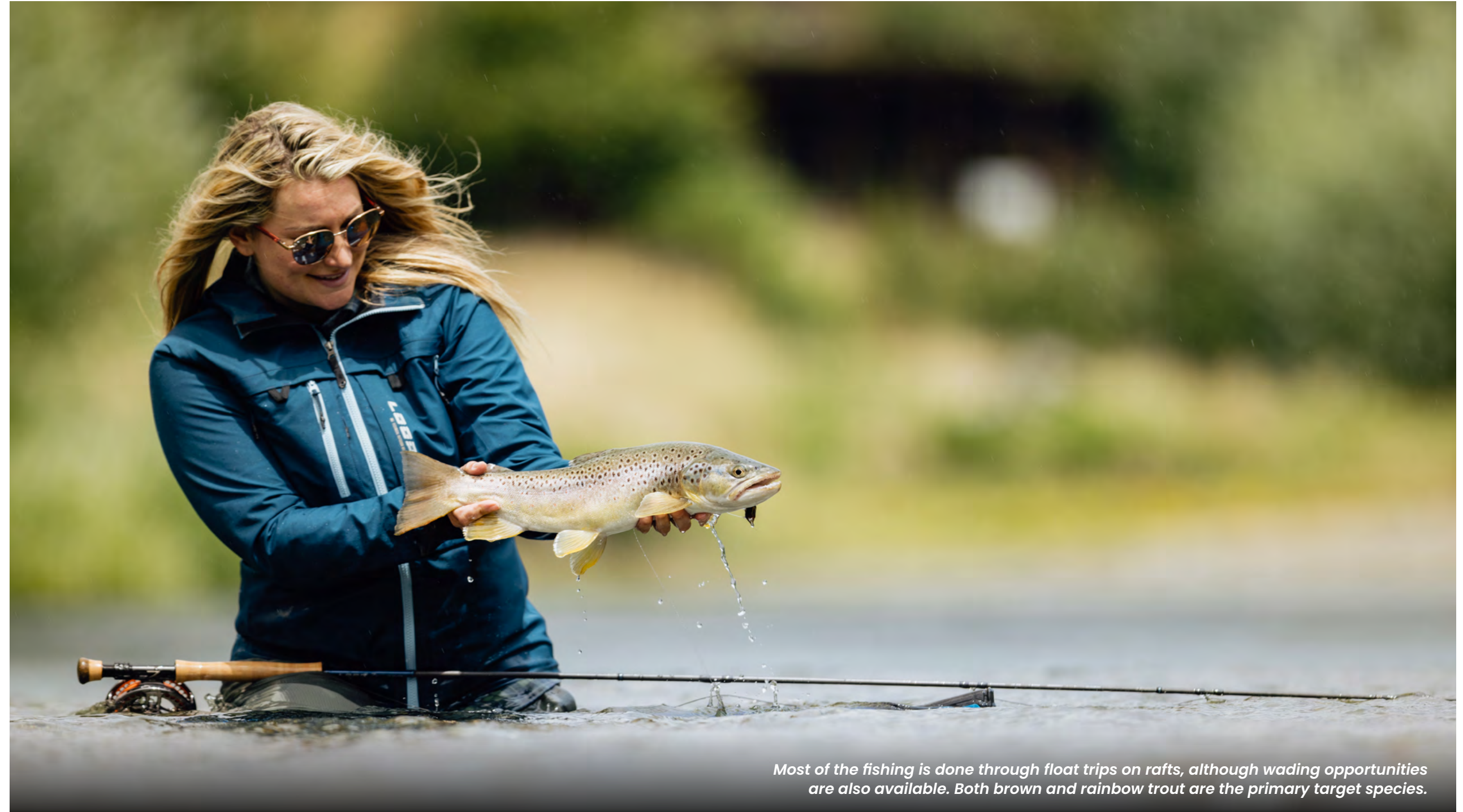
Most of the fishing is done through float trips on rafts, although wading opportunities are also available. Both brown and rainbow trout are the primary target species.

Beyond classic dry fly fishing, the range of techniques keeps each day dynamic. Terrestrial patterns—grasshoppers, beetles, and other land-based insects—become especially important in late summer, often drawing aggressive takes from larger fish. Subsurface methods also play a key role, with nymphs, streamers, and sinking lines used to probe deeper runs, structure, and seams where bigger trout tend to hold. On smaller streams, hopper-dropper rigs offer a productive and visual approach, while the main river rewards a more deliberate strategy, combining drifting and wading to cover prime water. Sight fishing is often part of the experience, with fish visible in the river’s remarkably clear currents.