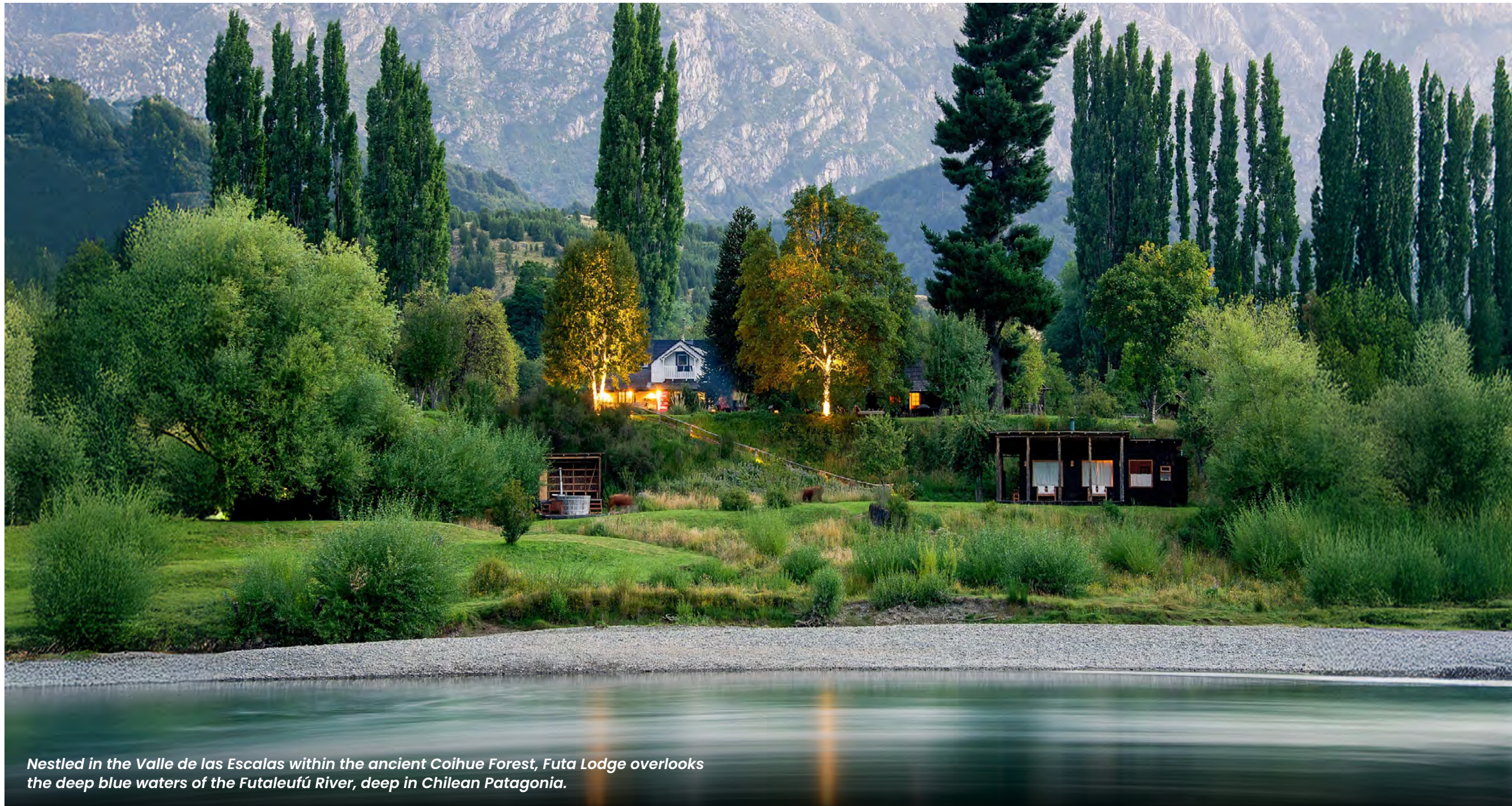
Nestled in the Valle de las Escalas within the ancient Coihue Forest, Futa Lodge overlooks the deep blue waters of the Futaleufú River, deep in Chilean Patagonia.