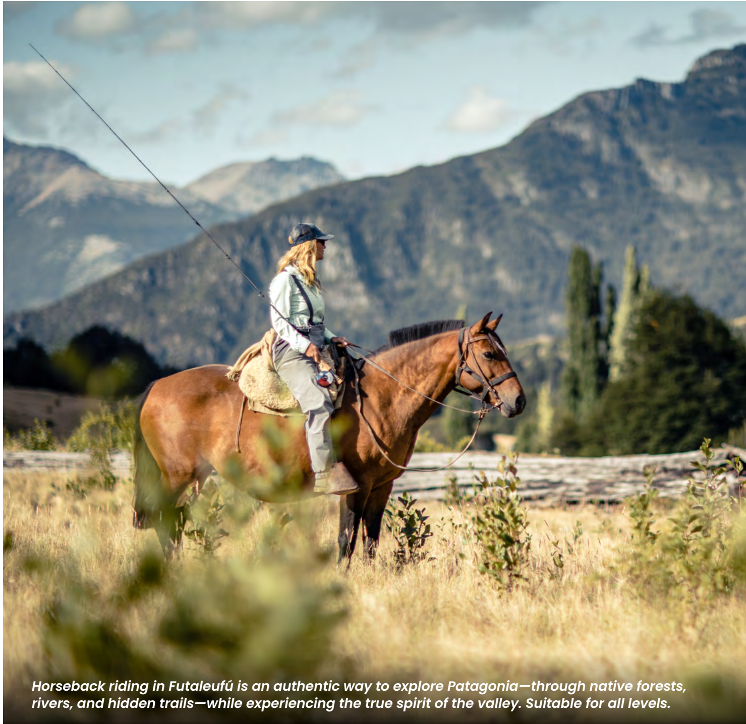
Horseback riding in Futaleufú is an authentic way to explore Patagonia—through native forests, rivers, and hidden trails—while experiencing the true spirit of the valley. Suitable for all levels.

These experiences are designed to complement your fishing program, creating a well-rounded and unforgettable stay in Patagonia.