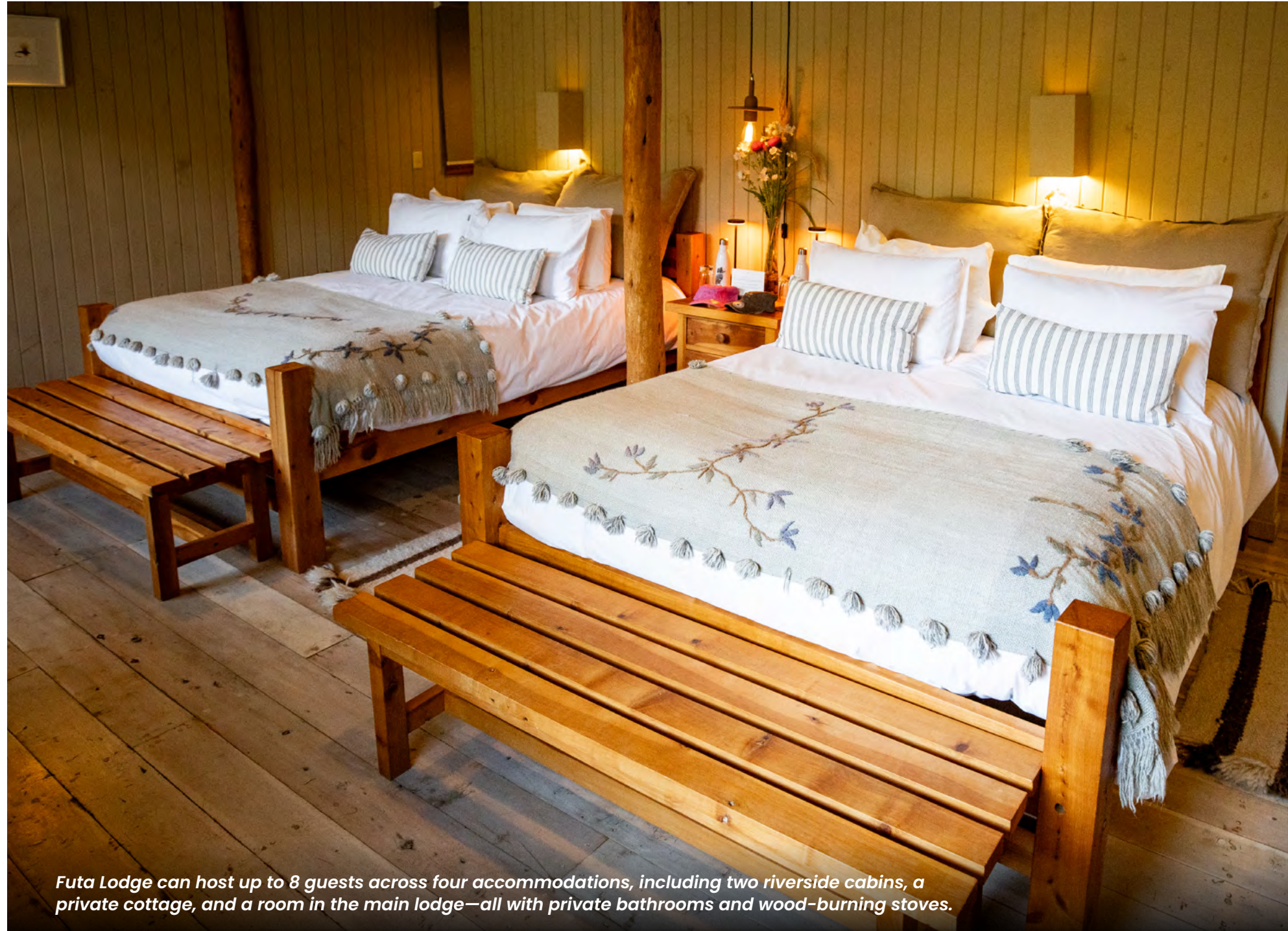
Futa Lodge can host up to 8 guests across four accommodations, including two riverside cabins, a private cottage, and a room in the main lodge—all with private bathrooms and wood-burning stoves.