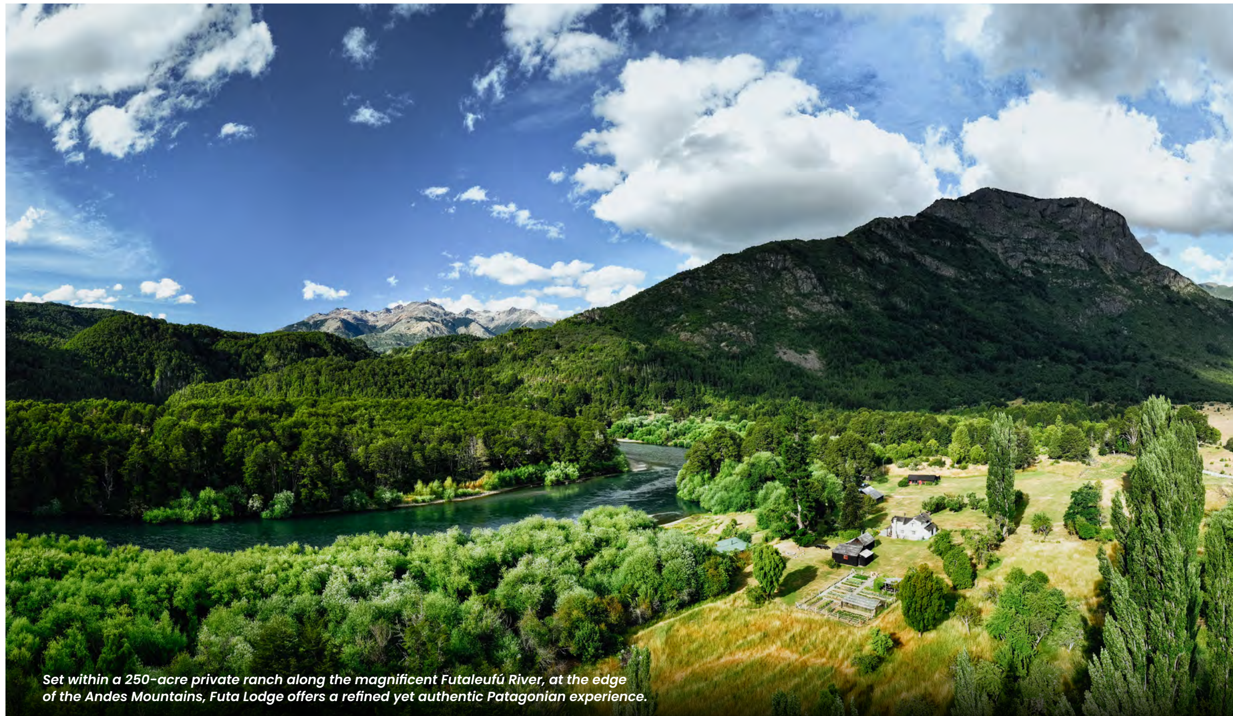
Set within a 250-acre private ranch along the magnificent Futaleufú River, at the edge of the Andes Mountains, Futa Lodge offers a refined yet authentic Patagonian experience.