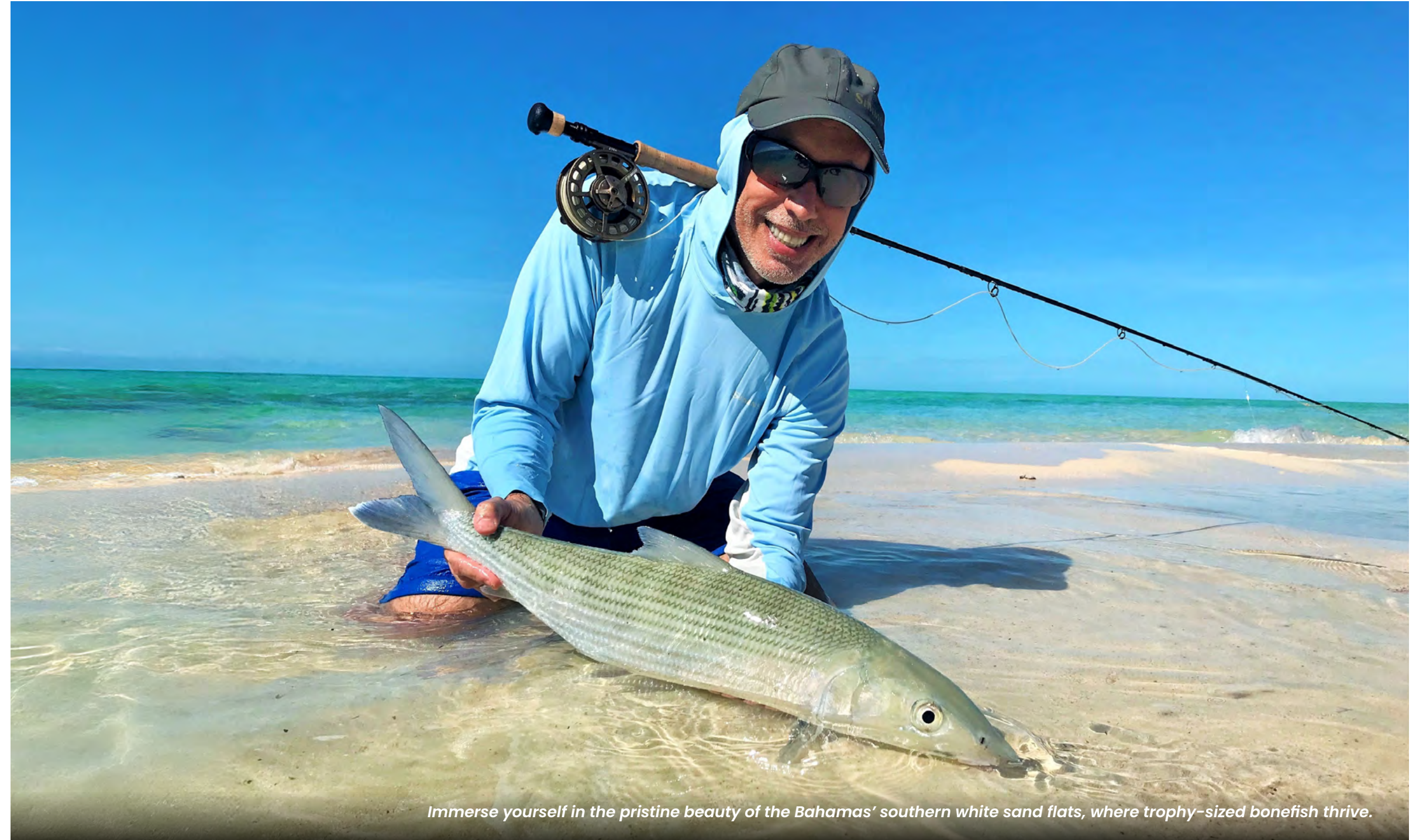
Immerse yourself in the pristine beauty of the Bahamas' southern white sand flats, where trophy-sized bonefish thrive.