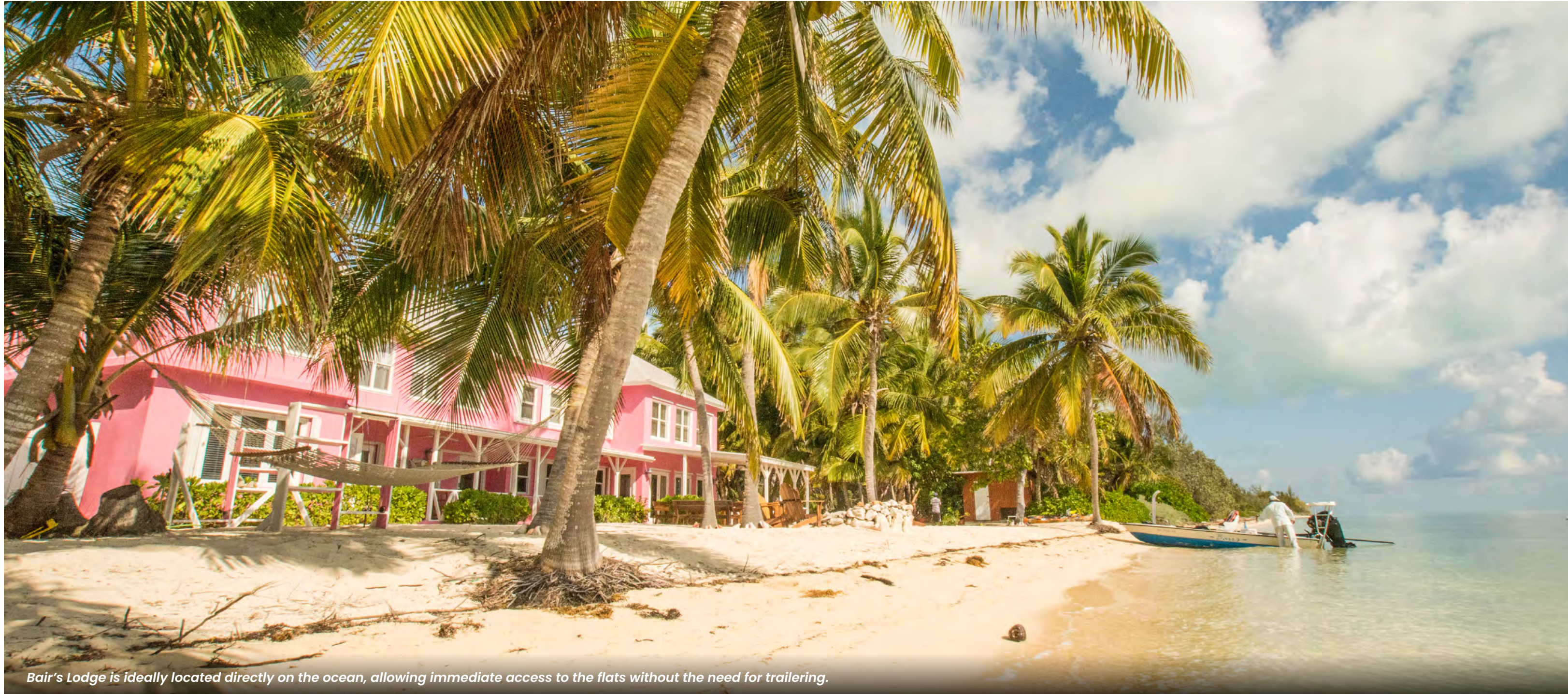
Bair's Lodge is ideally located directly on the ocean, allowing immediate access to the flats without the need for trailering.