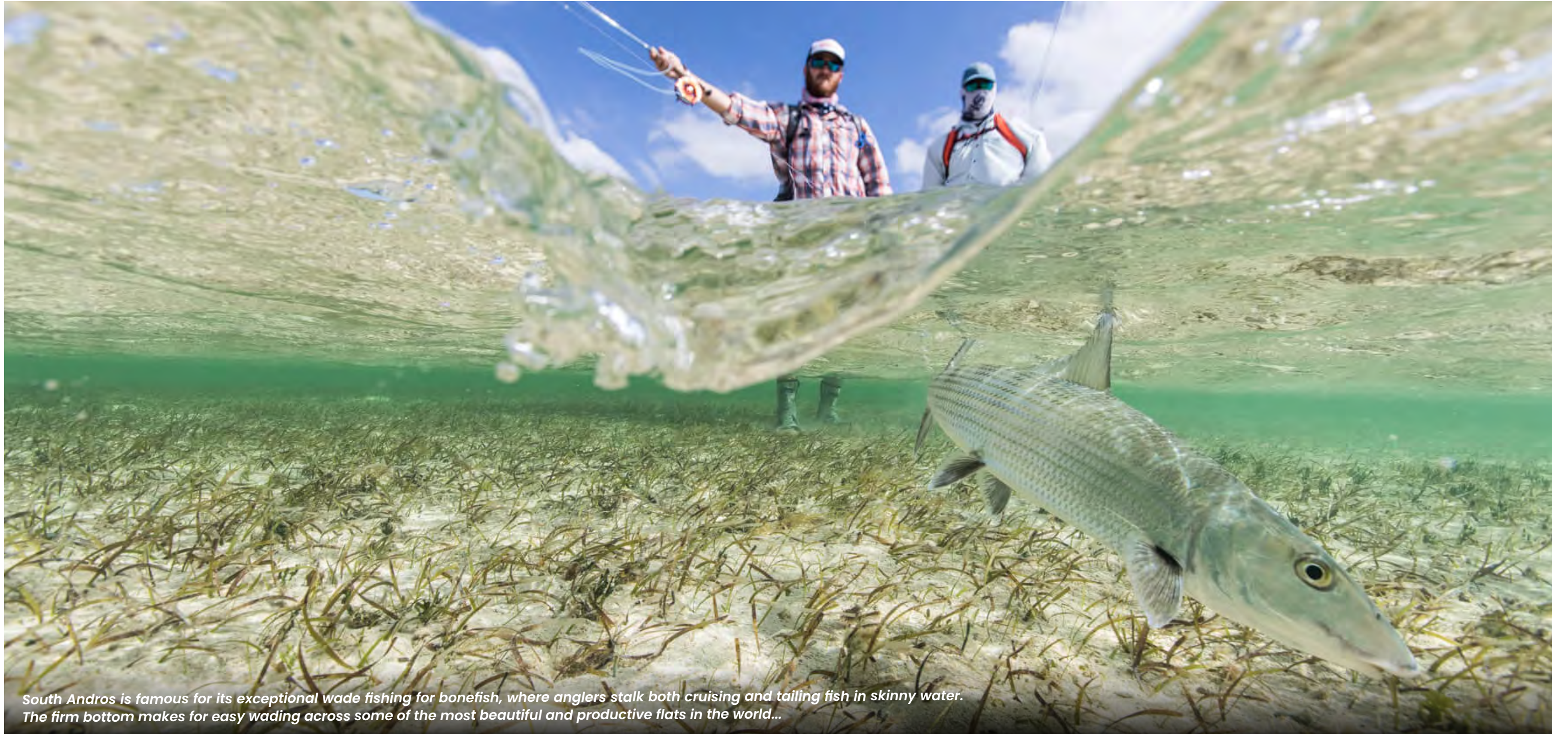
South Andros is famous for its exceptional wade fishing for bonefish, where anglers stalk both cruising and tailing fish in skinny water. The firm bottom makes for easy wading across some of the most beautiful and productive flats in the world...