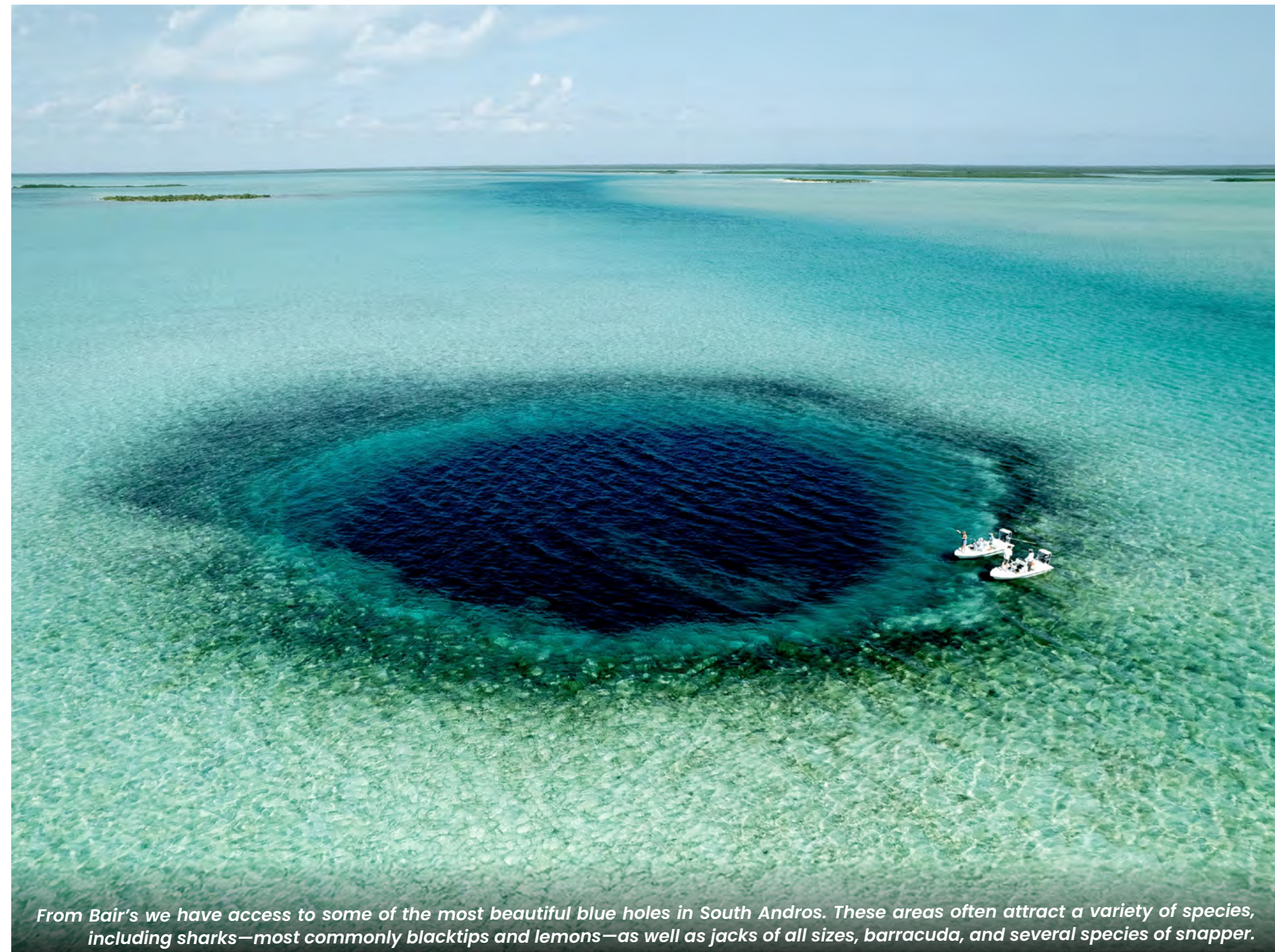
From Bair's we have access to some of the most beautiful blue holes in South Andros. These areas often attract a variety of species, including sharks—most commonly blacktips and lemons—as well as jacks of all sizes, barracuda, and several species of snapper.