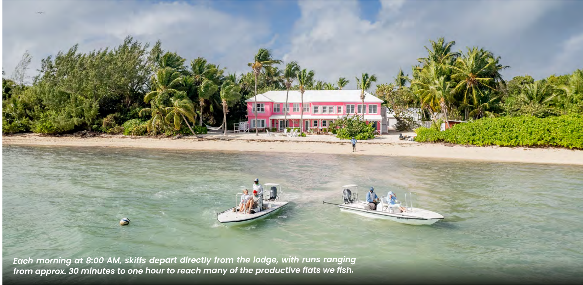
Each morning at 8:00 AM, skiffs depart directly from the lodge, with runs ranging from approx. 30 minutes to one hour to reach many of the productive flats we fish.