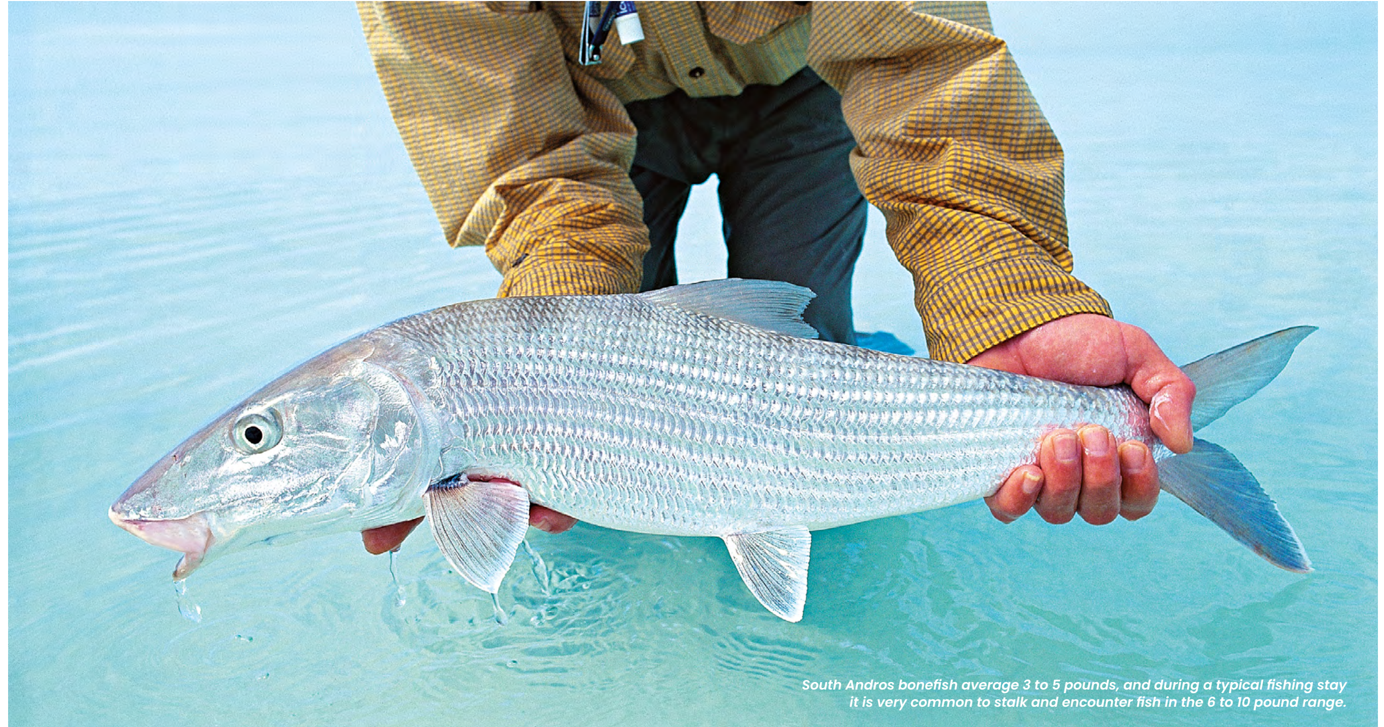
South Andros bonefish average 3 to 5 pounds, and during a typical fishing stay it is very common to stalk and encounter fish in the 6 to 10 pound range.

For safety, our guides carry satellite phones, SPOT GPS units, EPIRBs, emergency flares, first aid kits, and life jackets.