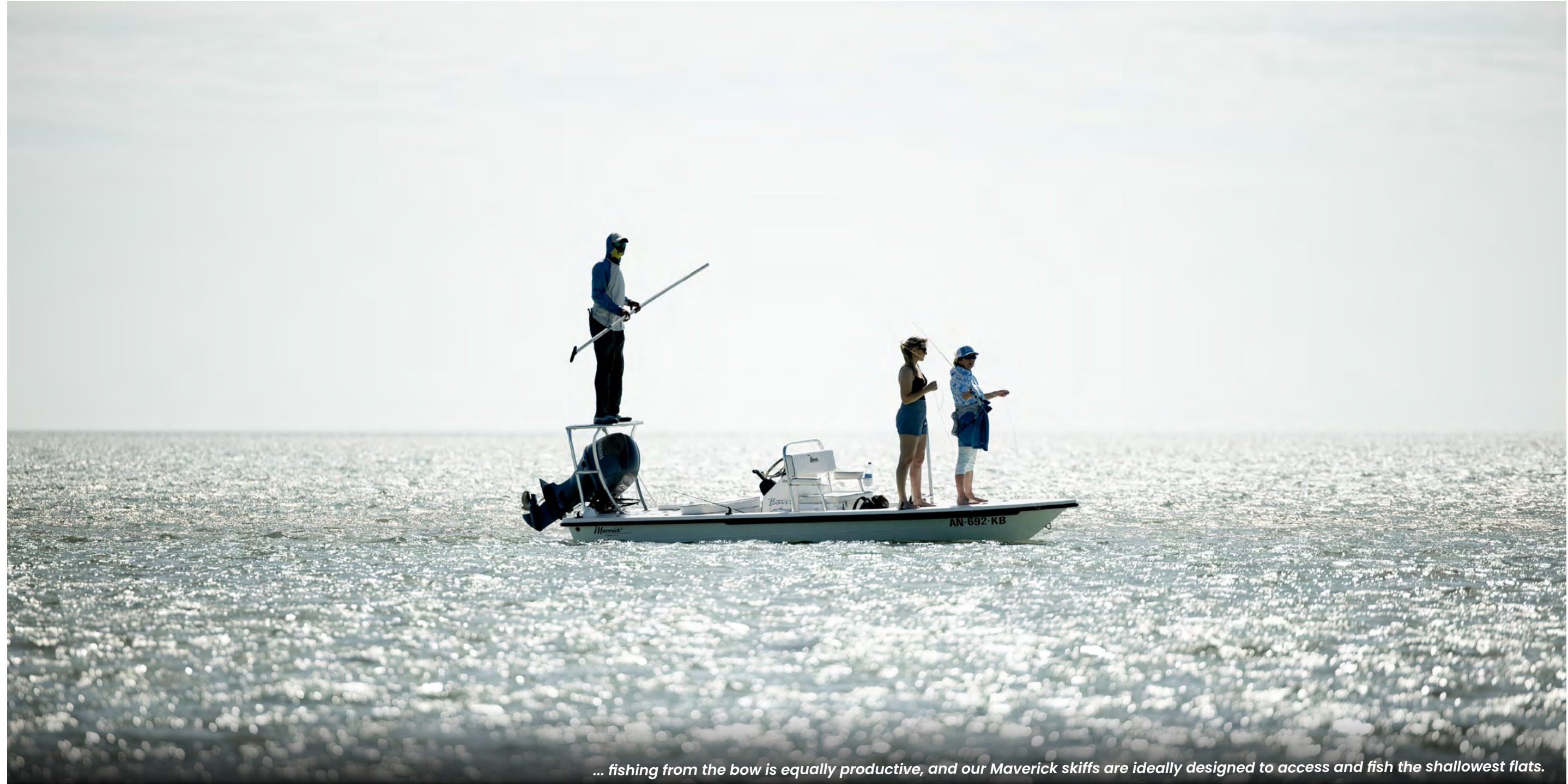
... fishing from the bow is equally productive, and our Maverick skiffs are ideally designed to access and fish the shallowest flats.