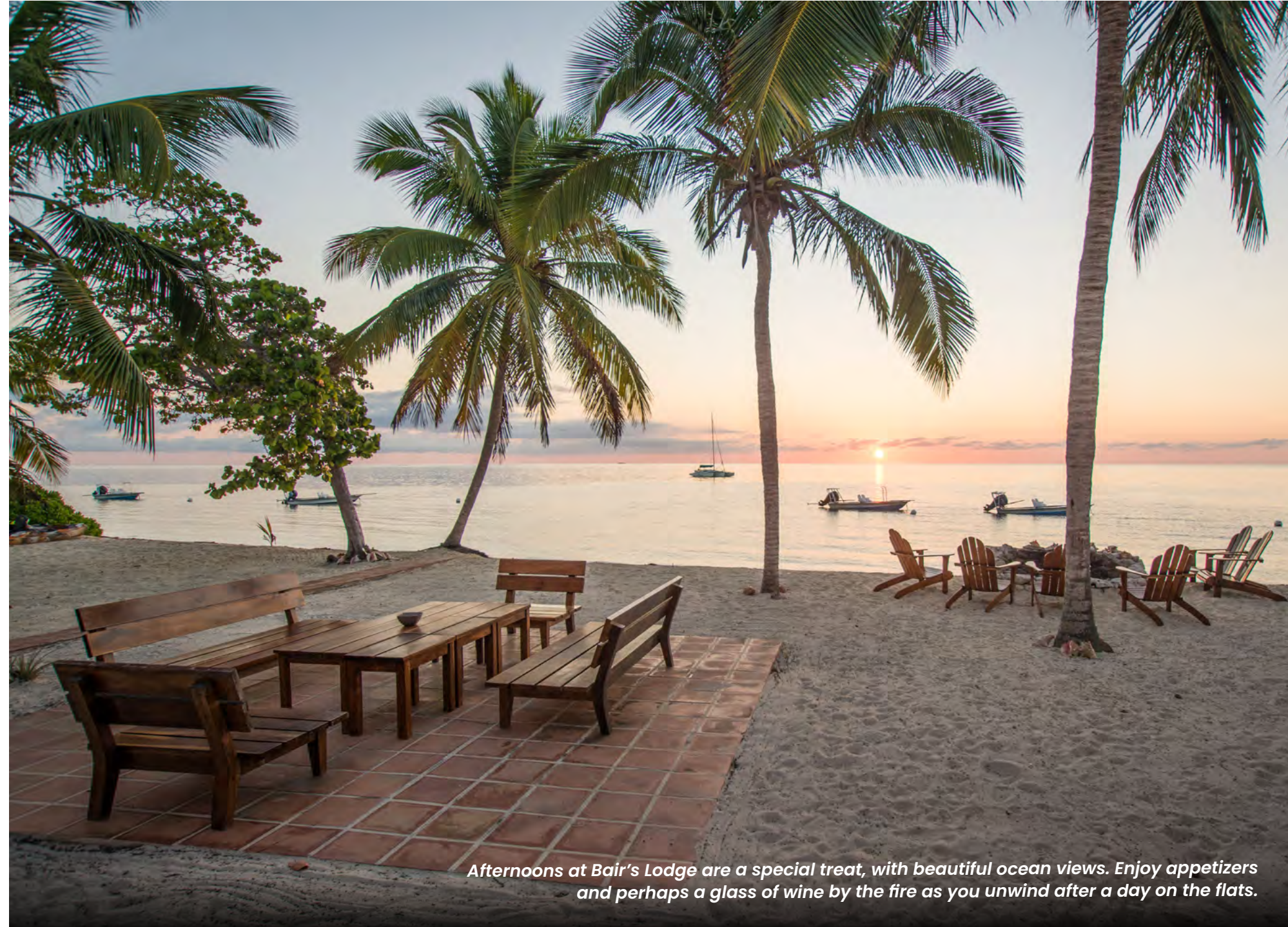
Afternoons at Bair's Lodge are a special treat, with beautiful ocean views. Enjoy appetizers and perhaps a glass of wine by the fire as you unwind after a day on the flats.