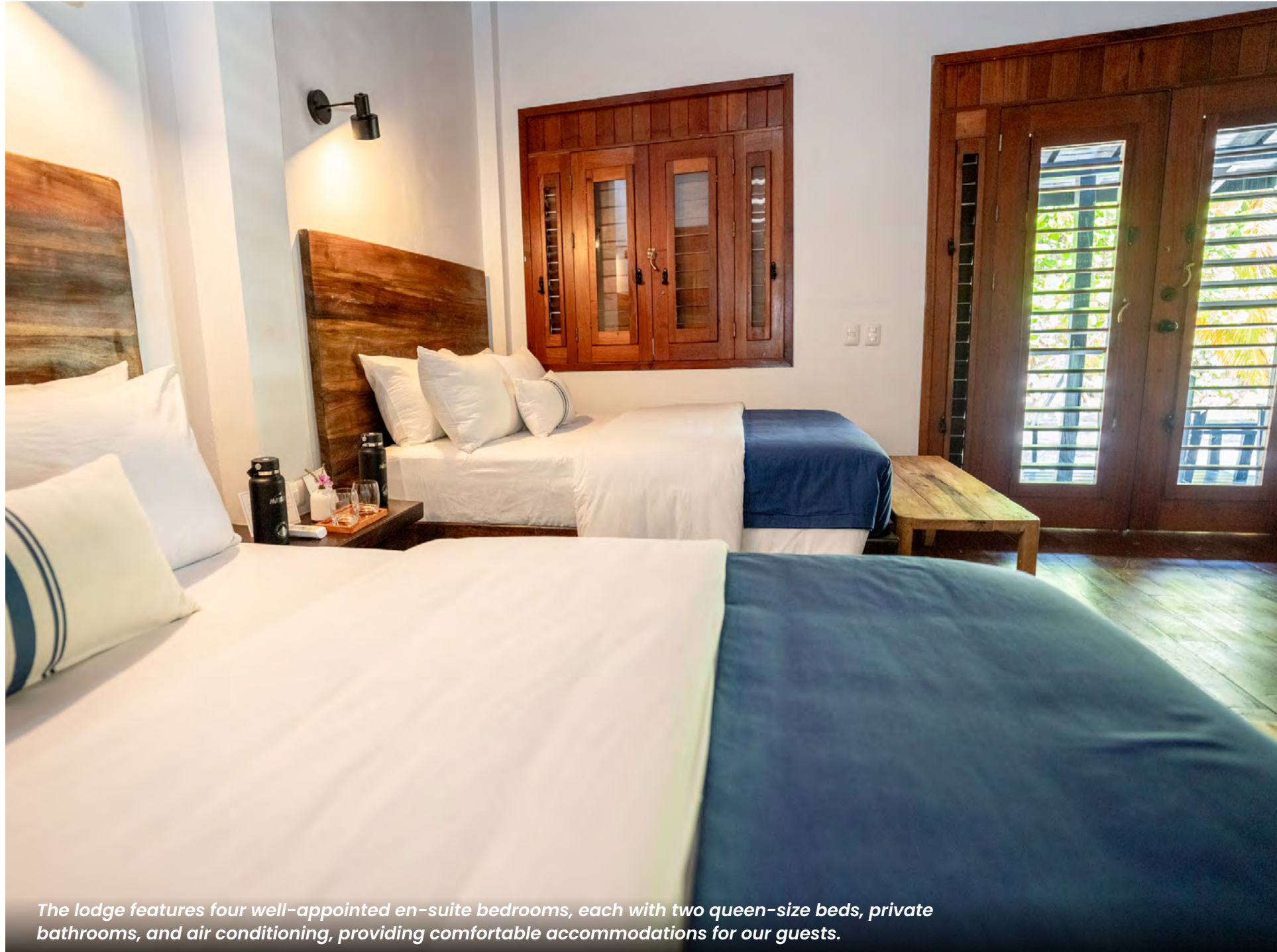
The lodge features four well-appointed en-suite bedrooms, each with two queen-size beds, private bathrooms, and air conditioning, providing comfortable accommodations for our guests.