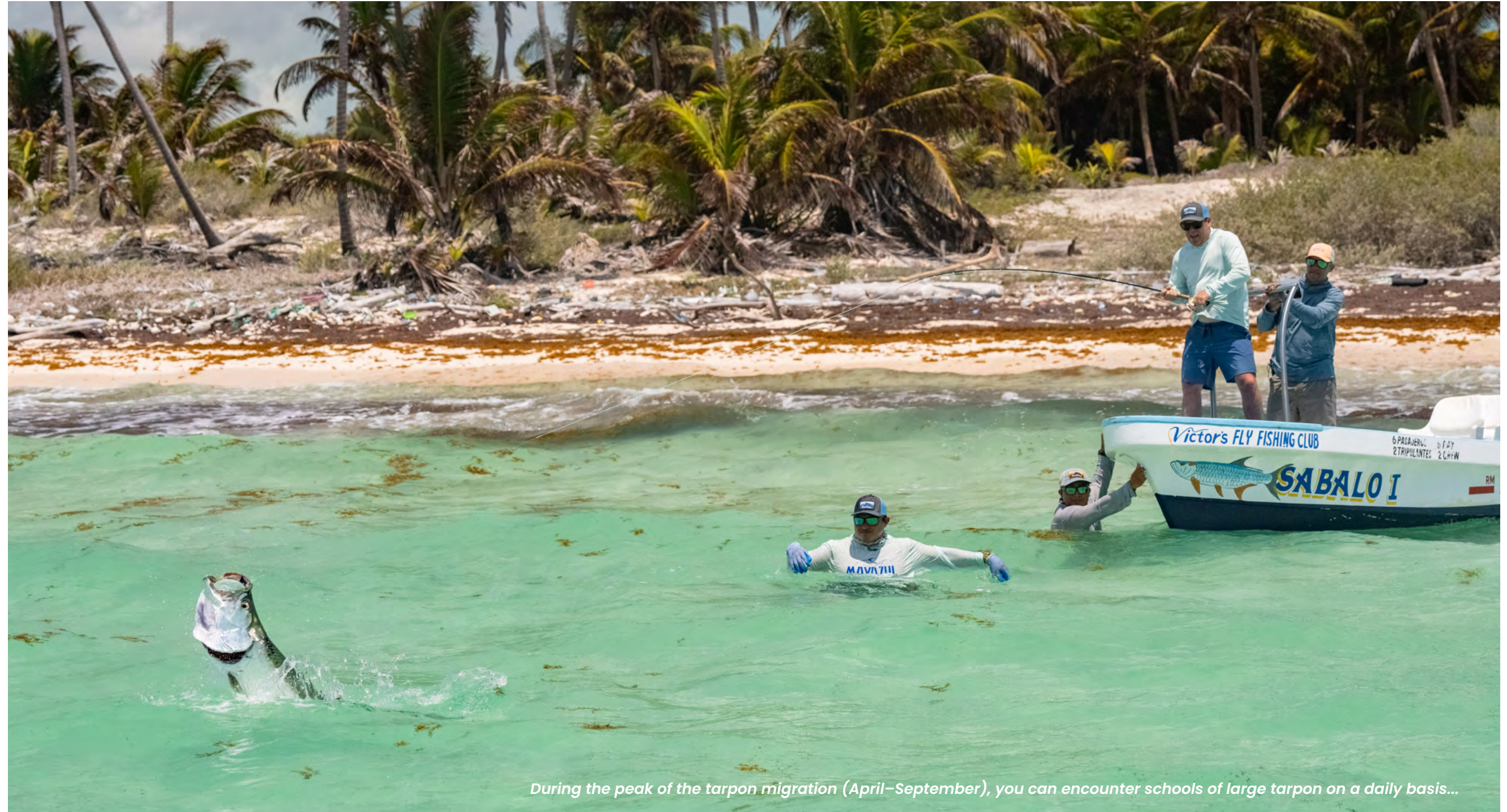
During the peak of the tarpon migration (April–September), you can encounter schools of large tarpon on a daily basis...

For a long time, the permit was only pursued by certain specialists. There was not much information about permit fishing, and there were even fewer dedicated guides. Successfully pursuing and catching a permit therefore seemed unattainable for the majority of anglers. Nowadays, the angling world has poured resources and created the demand for an increased understanding of these special fish. We now know more about their behavior and habits than ever before, and every day there are more guides who have dedicated their lives to stalking and learning about permit. Specialized equipment and flies have been designed with the sole purpose of maximizing permit fishing odds. Our promise at Mayazul is to bring all these years of development into your hands and at your disposal when you arrive at the lodge.