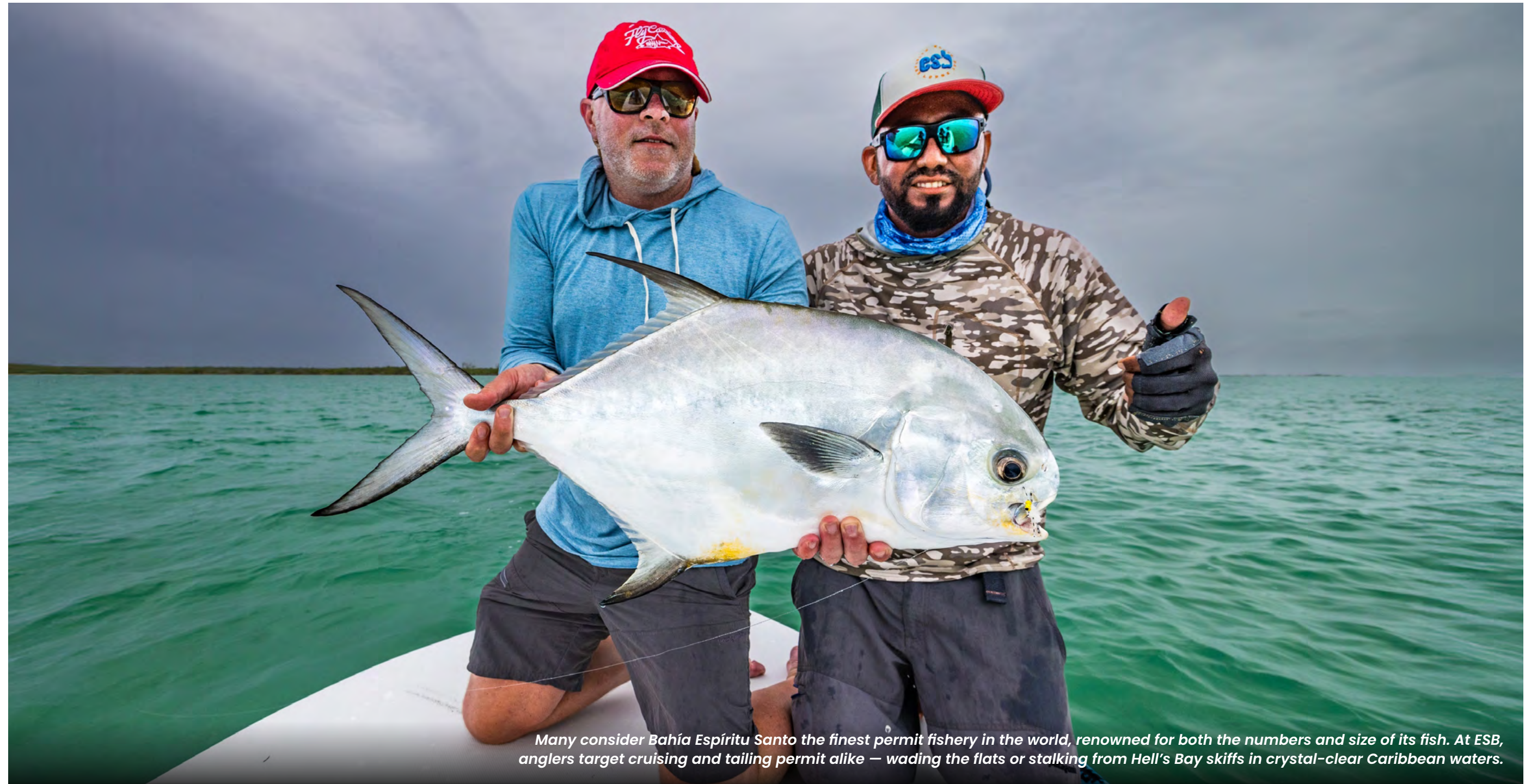
Many consider Bahía Espíritu Santo the finest permit fishery in the world, renowned for both the numbers and size of its fish. At ESB, anglers target cruising and tailing permit alike – wading the flats or stalking from Hell's Bay skiffs in crystal-clear Caribbean waters.