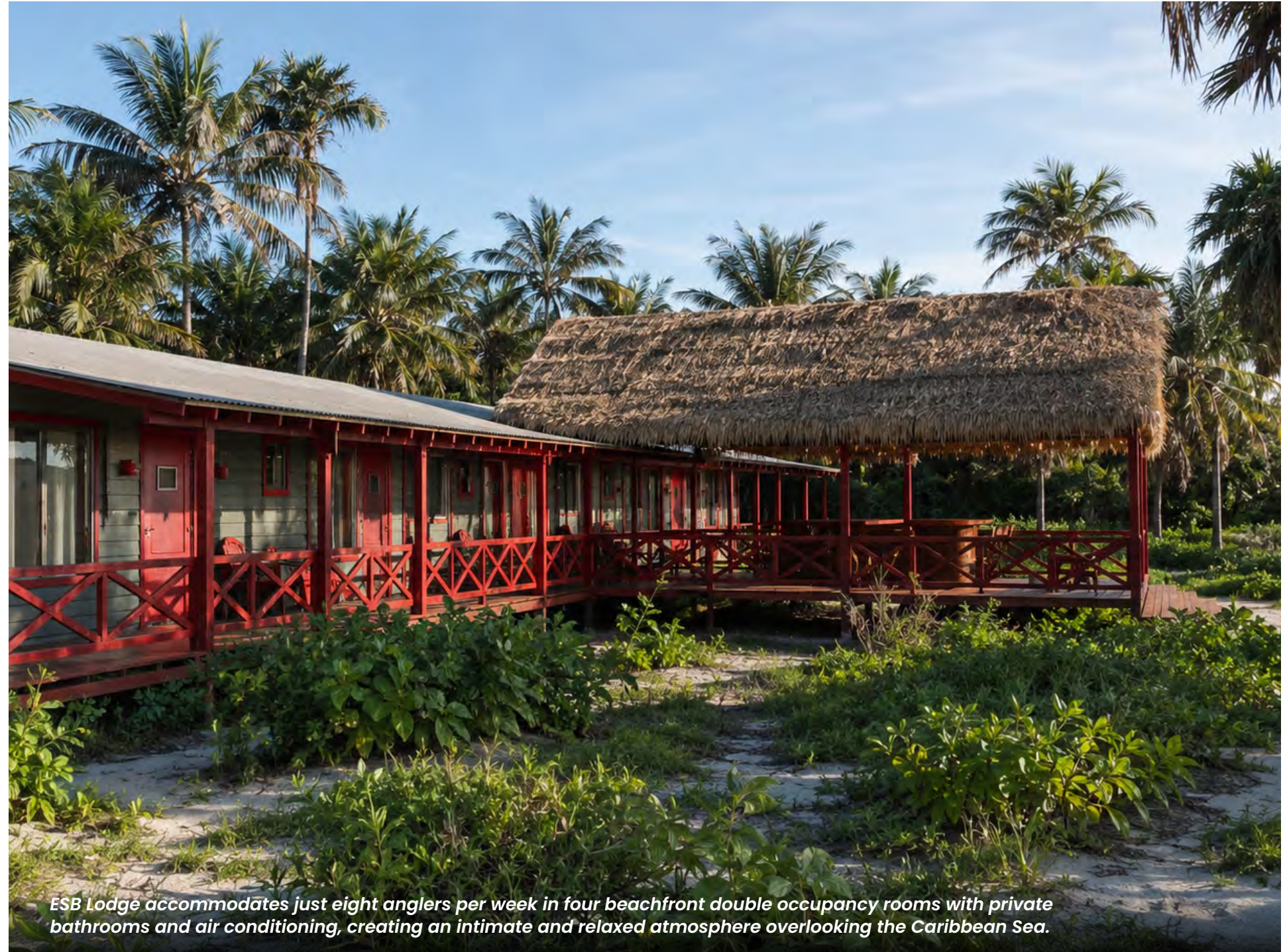
ESB Lodge accommodates just eight anglers per week in four beachfront double occupancy rooms with private bathrooms and air conditioning, creating an intimate and relaxed atmosphere overlooking the Caribbean Sea.