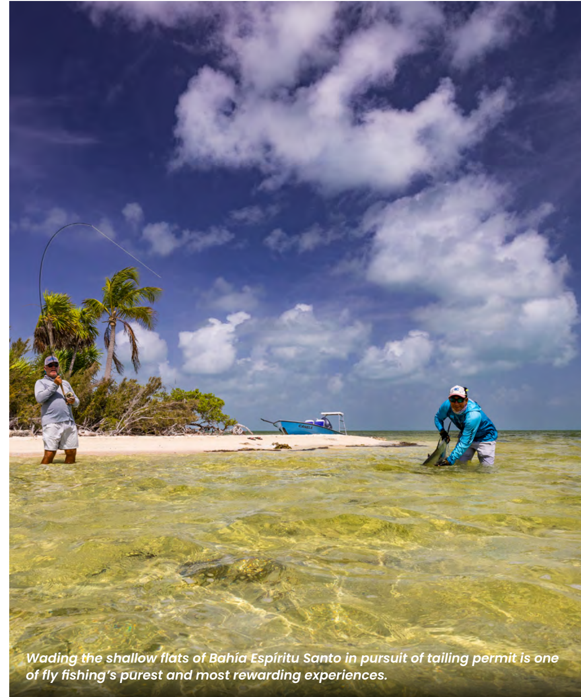
Wading the shallow flats of Bahía Espíritu Santo in pursuit of tailing permit is one of fly fishing's purest and most rewarding experiences.

Anglers target permit across a wide range of scenarios, from shallow tailing singles on white sand flats to large schools moving through deeper channels and turtle grass edges. Most fishing is done from technical shallow-water skiffs, though anglers occasionally stalk tailing fish on foot when conditions allow.