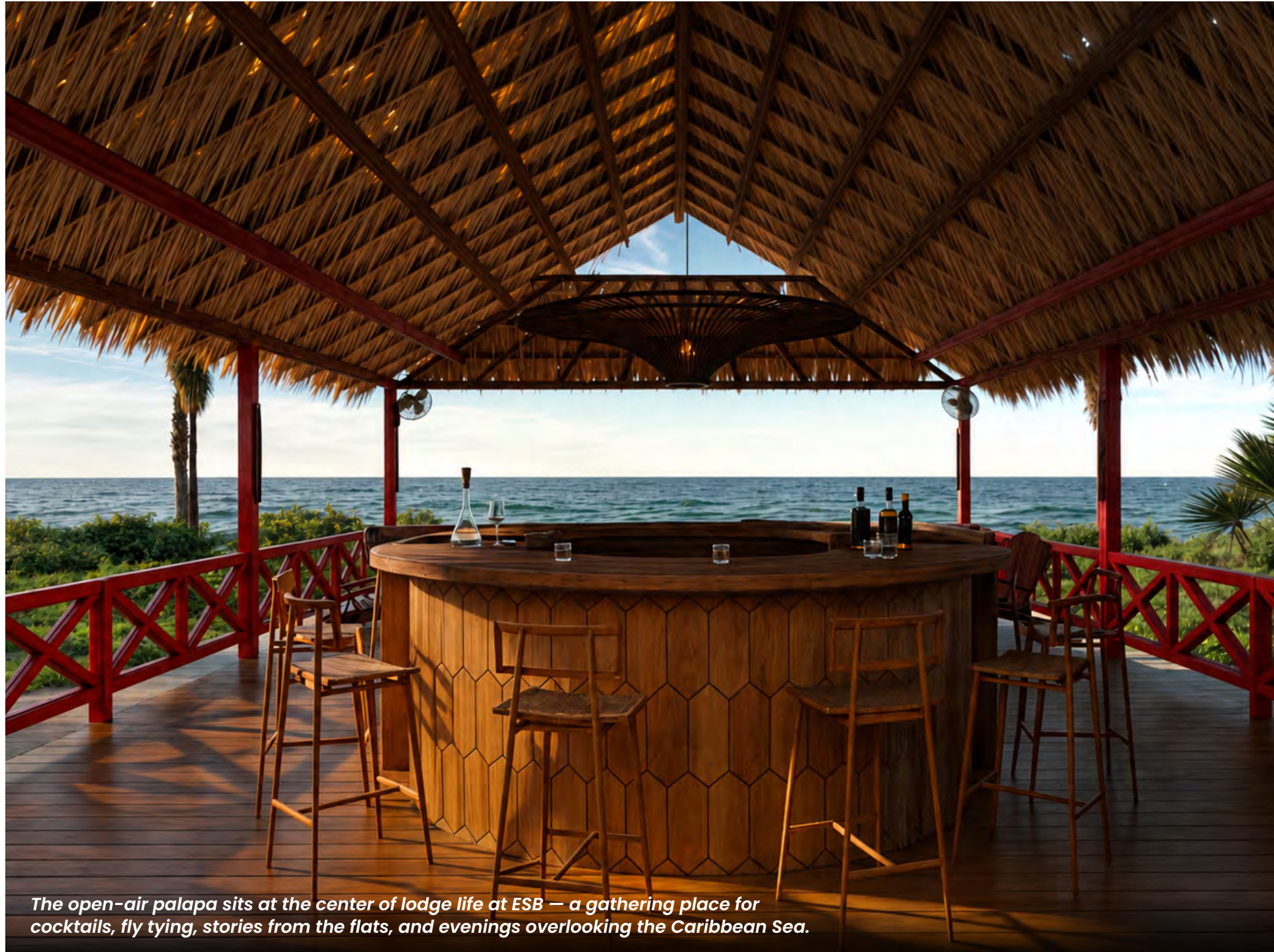
The open-air palapa sits at the center of lodge life at ESB — a gathering place for cocktails, fly tying, stories from the flats, and evenings overlooking the Caribbean Sea.