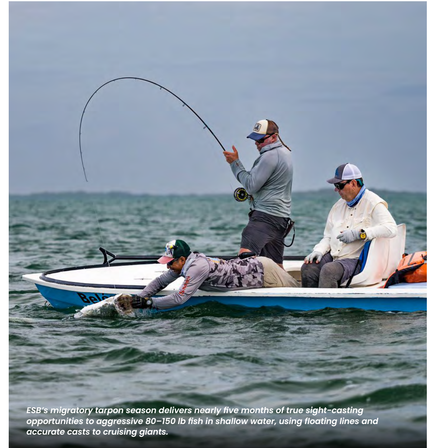
ESB's migratory tarpon season delivers nearly five months of true sight-casting opportunities to aggressive 80–150 lb fish in shallow water, using floating lines and accurate casts to cruising giants.