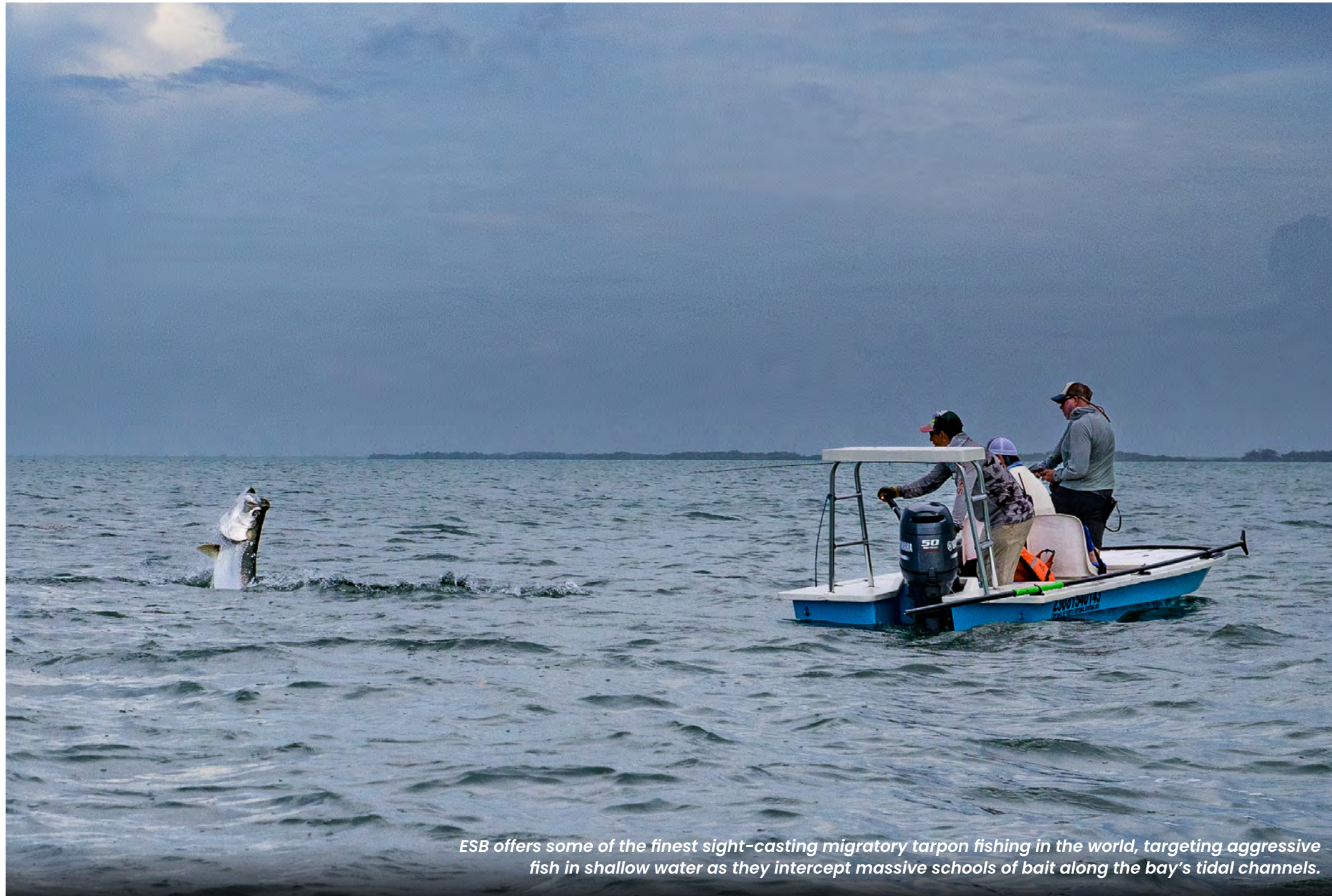
ESB offers some of the finest sight-casting migratory tarpon fishing in the world, targeting aggressive fish in shallow water as they intercept massive schools of bait along the bay's tidal channels.

Fishing is focused around deep channels and moving tides near the mouth of the bay, where tarpon stage and feed aggressively. Using 11 and 12-weight rods, anglers target rolling and cruising fish with large baitfish patterns and accurate presentations.