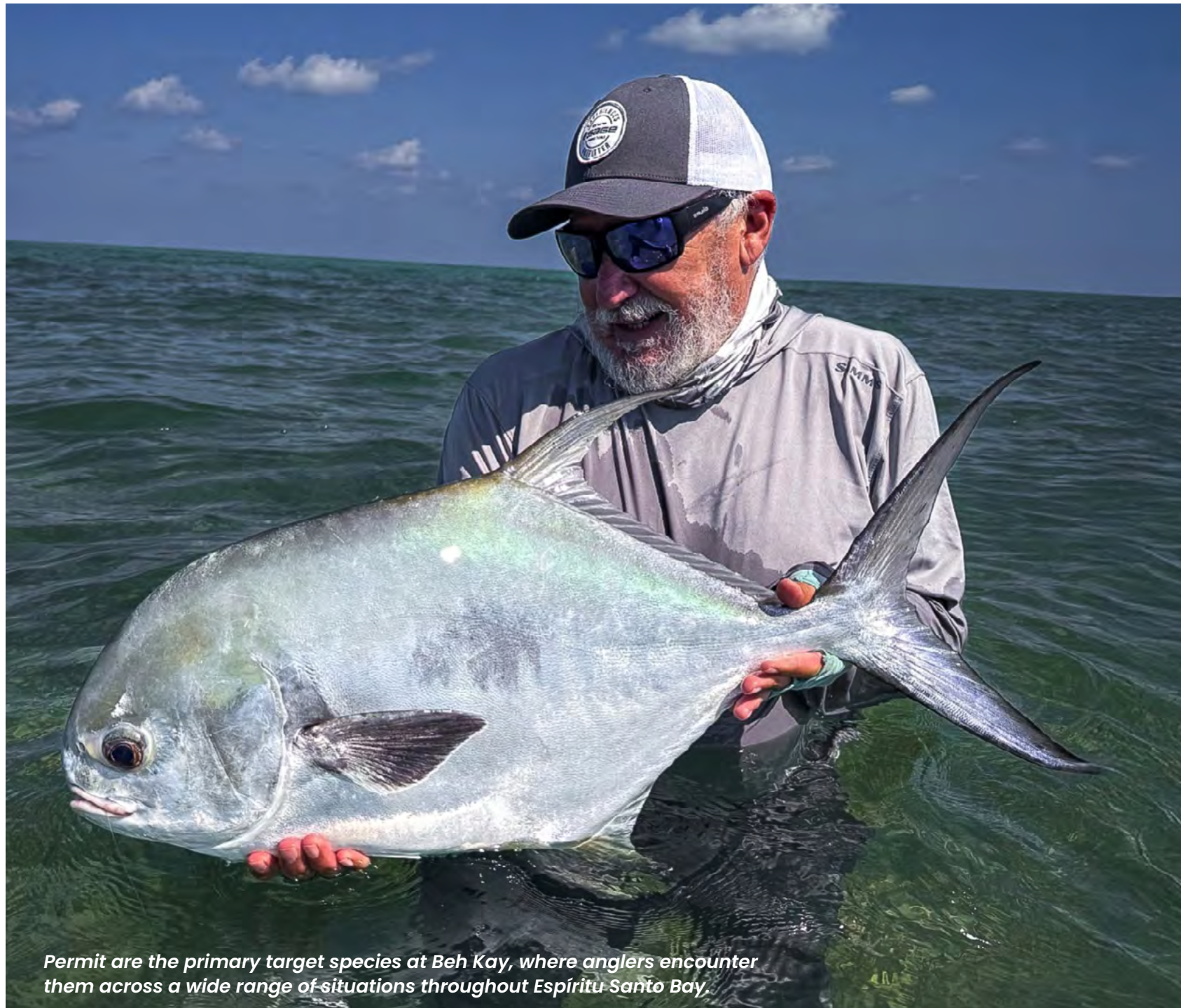
Permit are the primary target species at Beh Kay, where anglers encounter them across a wide range of situations throughout Espíritu Santo Bay.