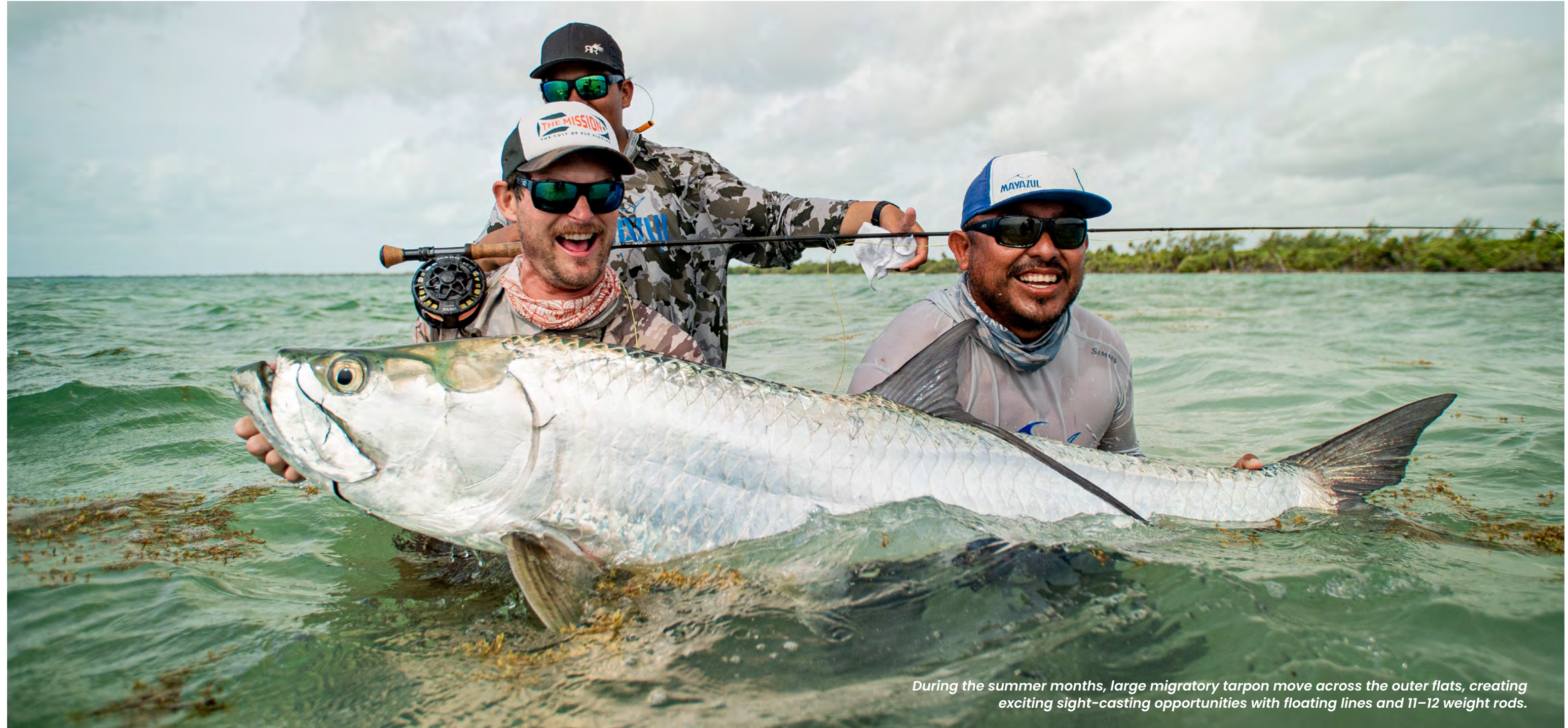
During the summer months, large migratory tarpon move across the outer flats, creating exciting sight-casting opportunities with floating lines and 11-12 weight rods.

This variety gives Beh Kay real Grand Slam potential, but the program remains clear in its identity: permit first, with the rest of the bay always adding depth, surprise, and opportunity.