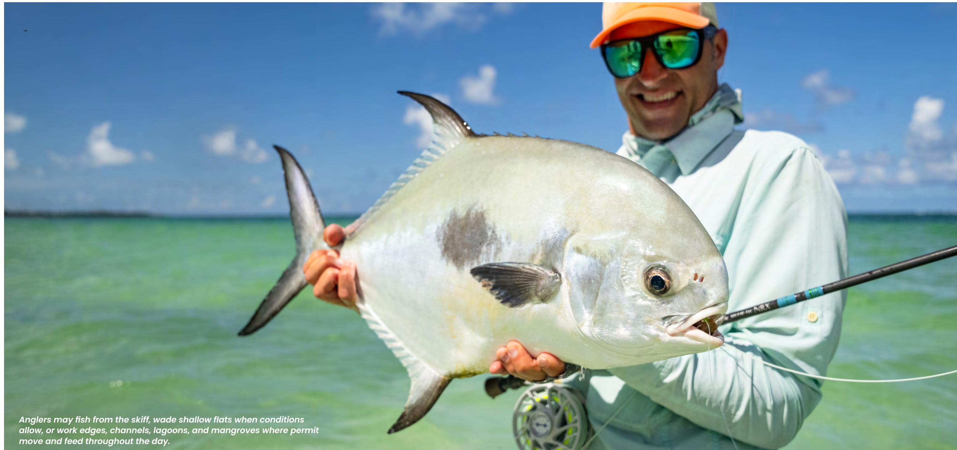
Anglers may fish from the skiff, wade shallow flats when conditions allow, or work edges, channels, lagoons, and mangroves where permit move and feed throughout the day.

The guide program is a key part of the experience. Beh Kay's guides work as a team, rotate with guests throughout the week, and share information about tides, light, wind, fish movement, and productive areas. In a fishery this varied, that collaboration matters. It allows each day to be shaped around the best opportunities the bay is offering.