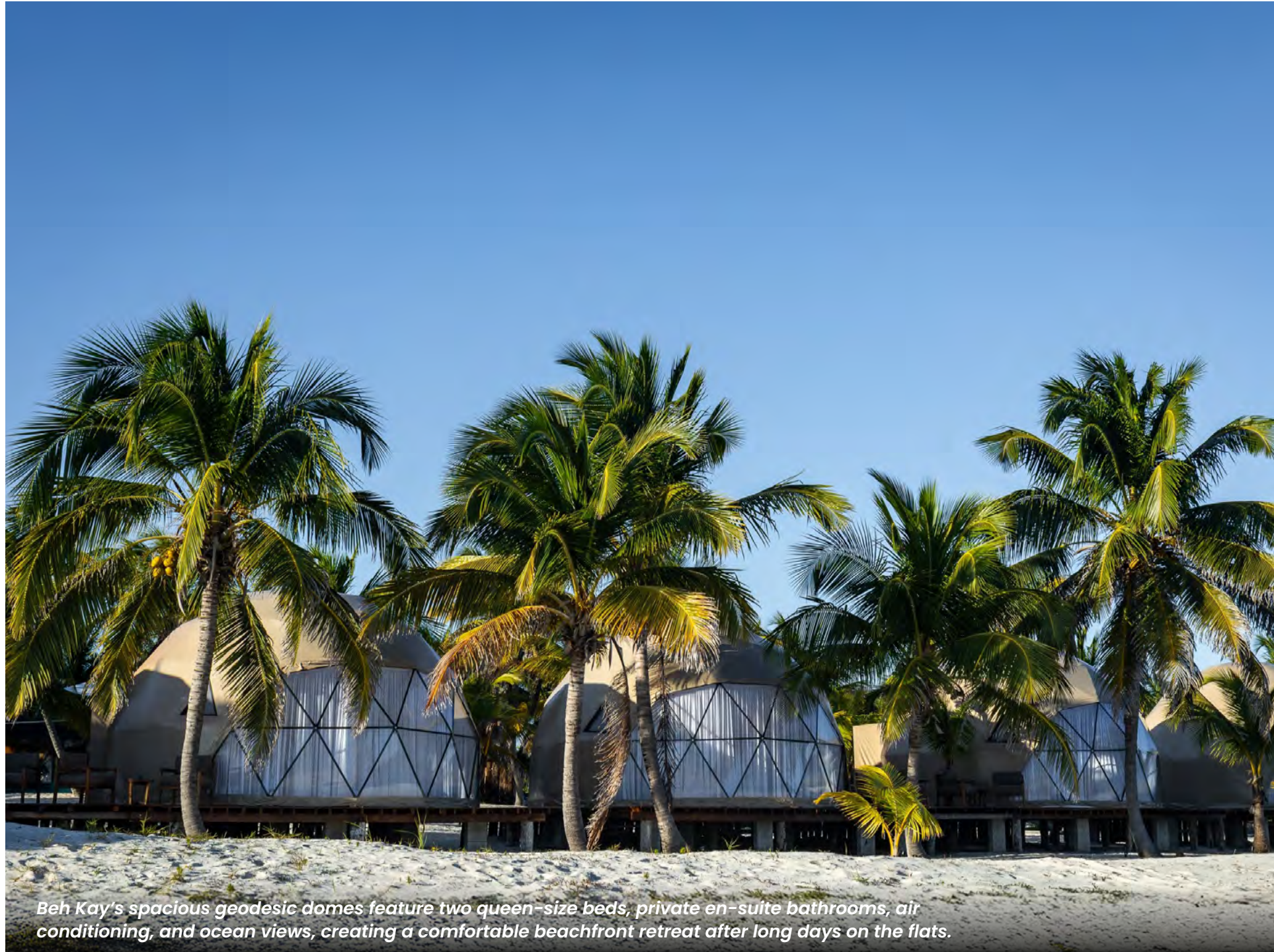
Beh Kay's spacious geodesic domes feature two queen-size beds, private en-suite bathrooms, air conditioning, and ocean views, creating a comfortable beachfront retreat after long days on the flats.