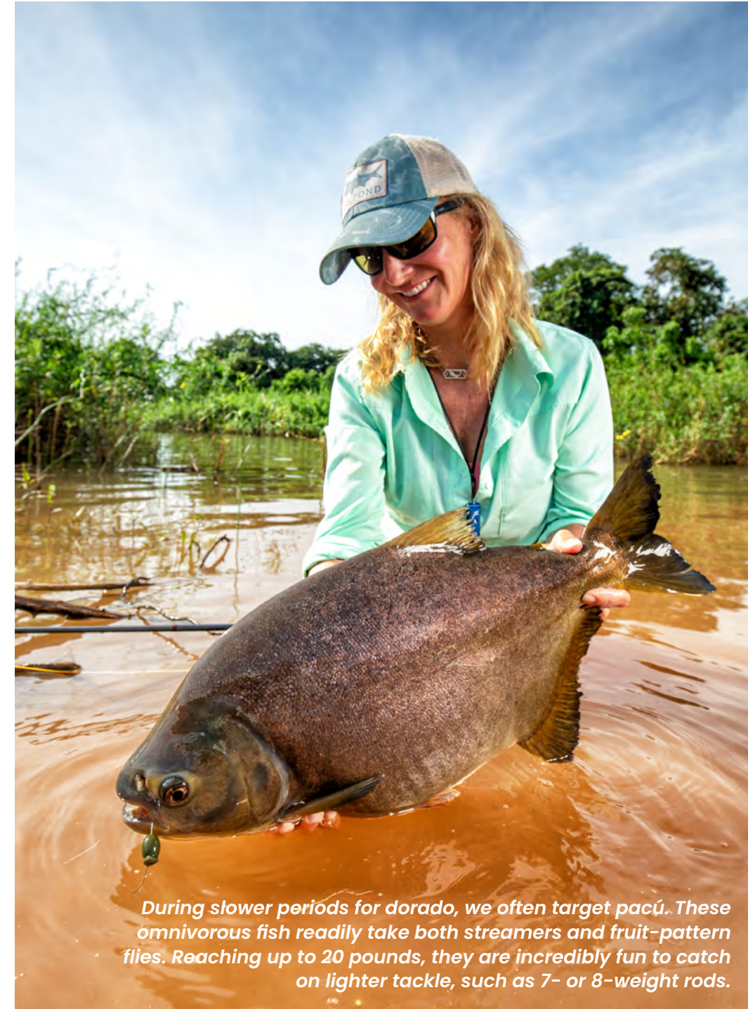
During slower periods for dorado, we often target pacu. These omnivorous fish readily take both streamers and fruit-pattern flies. Reaching up to 20 pounds, they are incredibly fun to catch on lighter tackle, such as 7- or 8-weight rods.