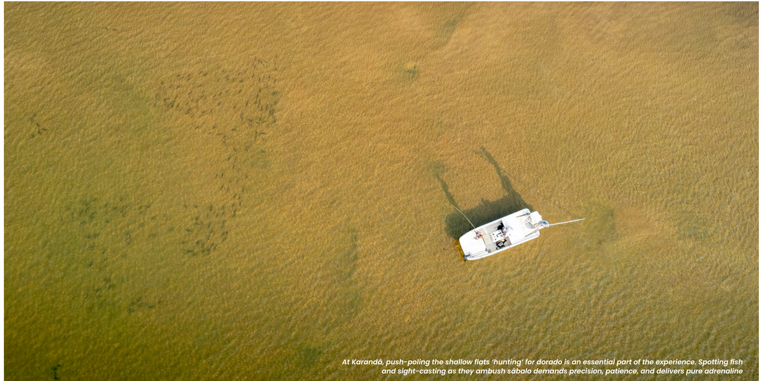
At Karandá, push-poling the shallow flats 'hunting' for dorado is an essential part of the experience. Spotting fish and sight-casting as they ambush sábalo demands precision, patience, and delivers pure adrenaline

Generally speaking, we can divide Dorado fishing into two main approaches: blind casting and sight-casting. At Karandá, we do both, depending on weather conditions and where the fish are holding.